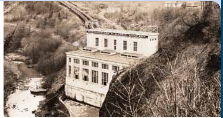
Condit Powerhouse during the early years of operation

but these facilities twice washed out due to floods during the early life of the dam. After the second washout, the Washington State Fisheries Department required Northwestern Electric to contribute to construction of a state fish hatchery rather than rebuild the fish ladders. A final attempt was made in 1925, when experiments were done on a newly designed fish elevator, without success. Just as in the 1920s, PacifiCorp understands the importance of appropriate fish passage, but the cost to customers must also be considered. In the case of Condit, removing the dam instead of installing expensive fish passage over or around the project is the best alternative for customers.