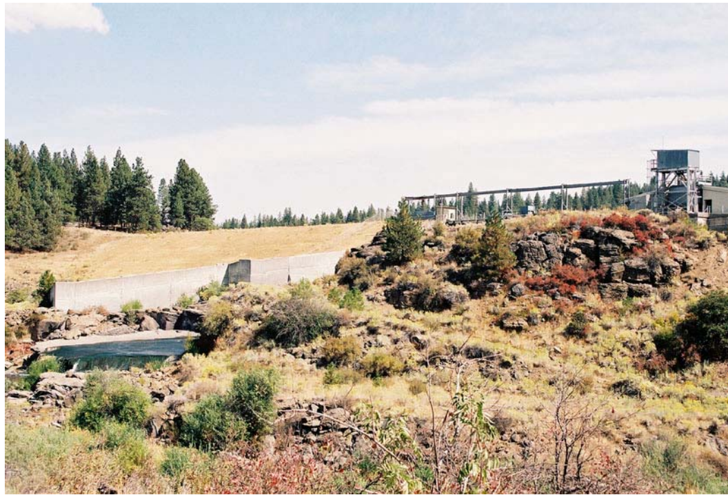
BB8: J.C. BOYLE POWERHOUSE AND PENSTOCKS