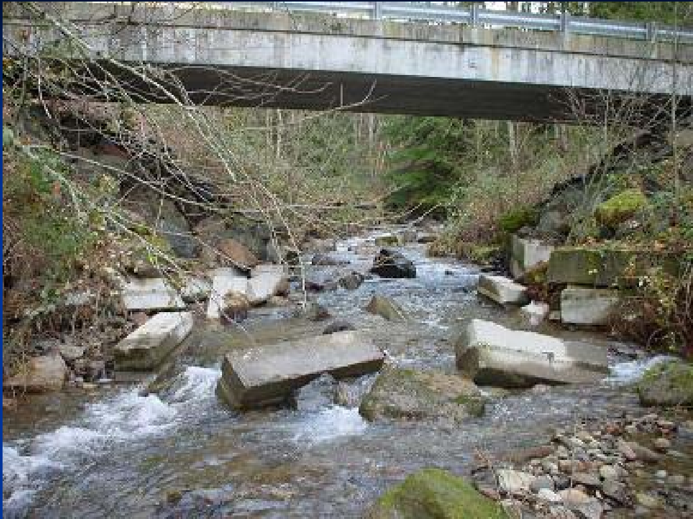
Brooks Creek early-December