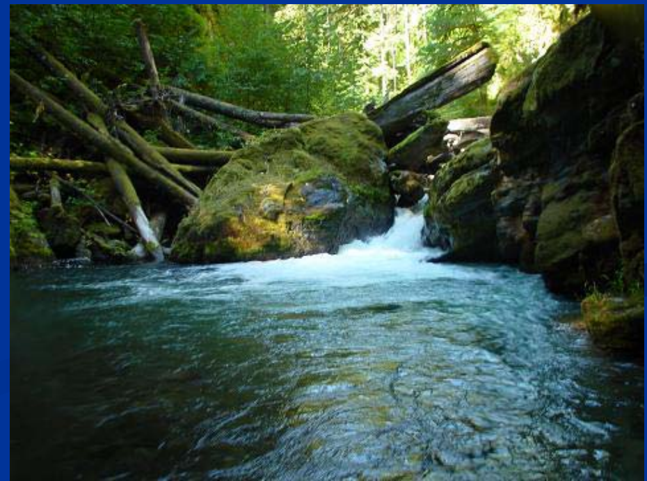
Swift Creek below 5-ft falls