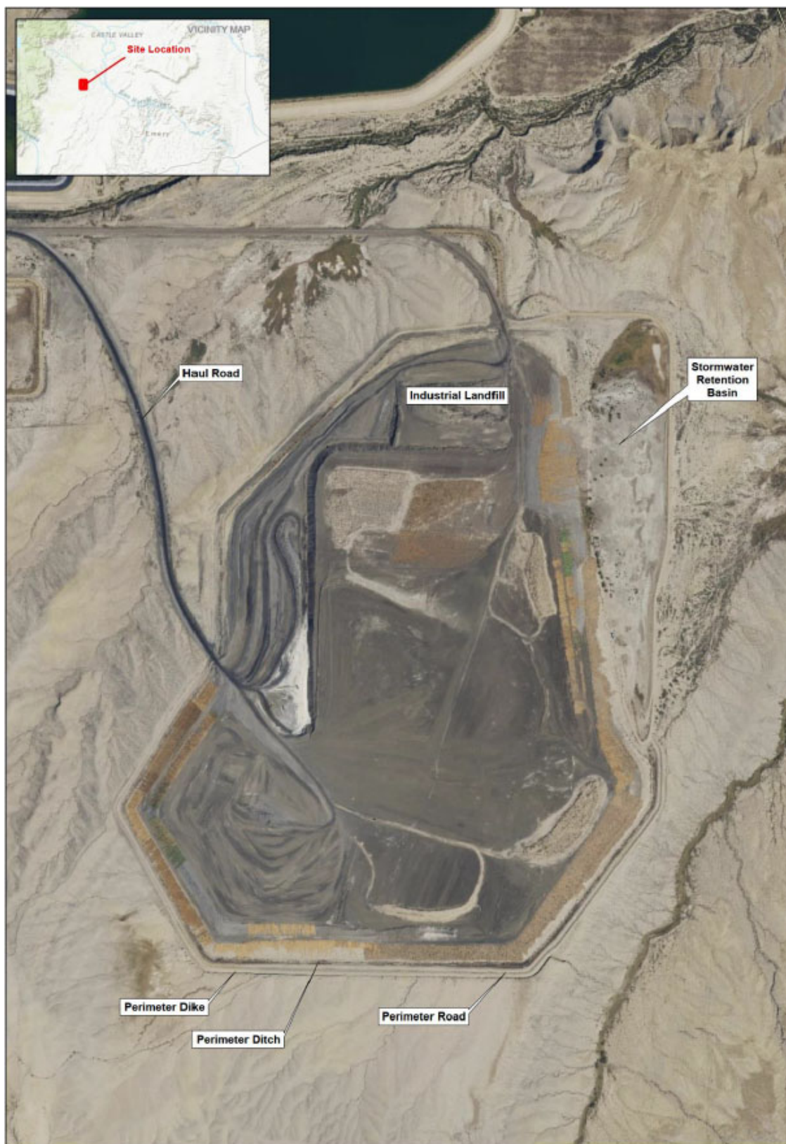
Figure 1 : Hunter CCR Landfill