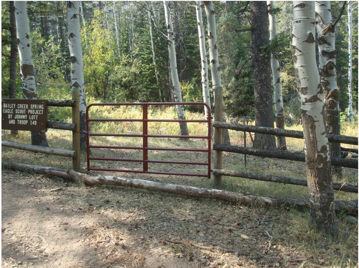
Bailey Creek Fencing