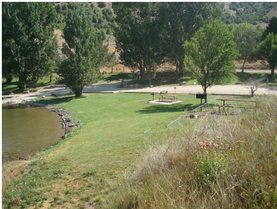
Oneida Plant Parcel