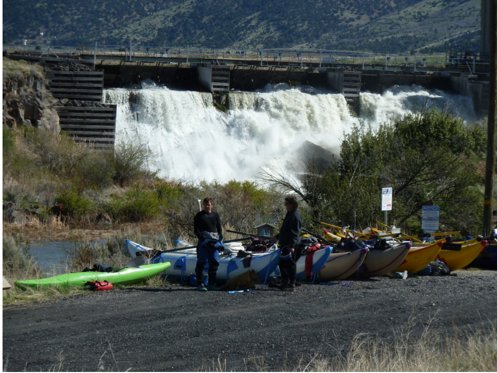
Boaters prepare for a 2012 whitewater boater flow release below Grace Dam.