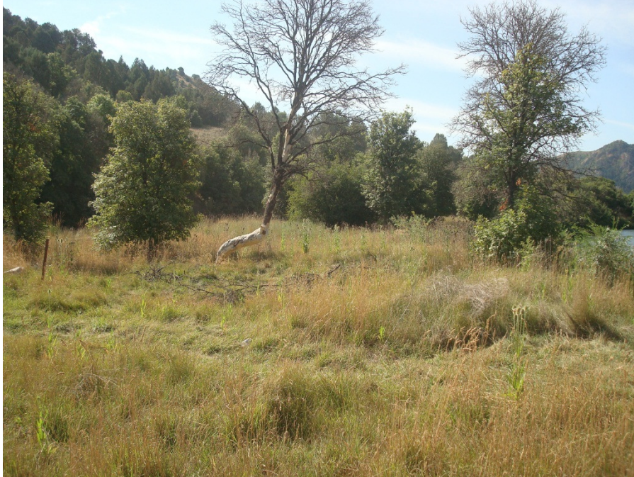
RP 3 - 21 August 2012