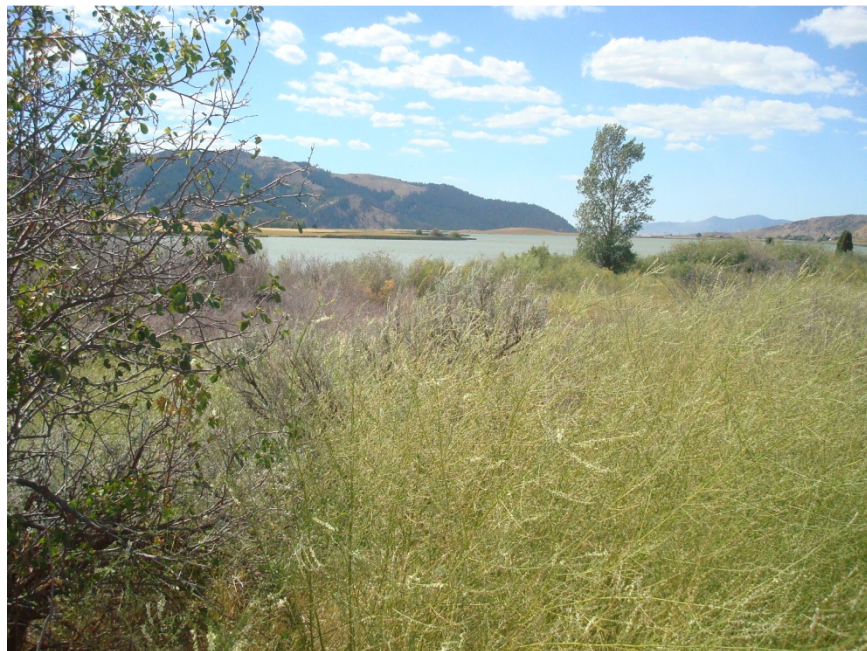
MO 4 – 23 September 2012