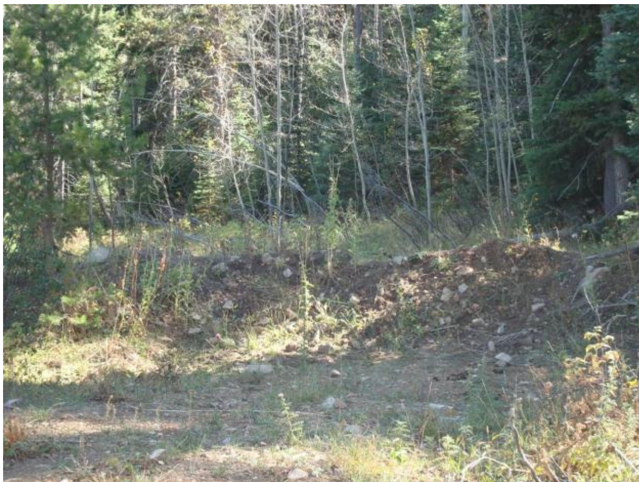
Eightmile Canyon #8