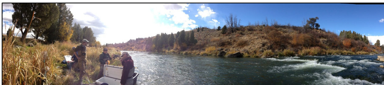
Idaho Department of Fish and Game field crew sampling as part of the Bonneville cutthroat trout conservation hatchery evaluation.

The Oneida Development Water Year 2012 Operation Report was completed during the 2012 reporting period and has been submitted along with this annual report to the FERC.