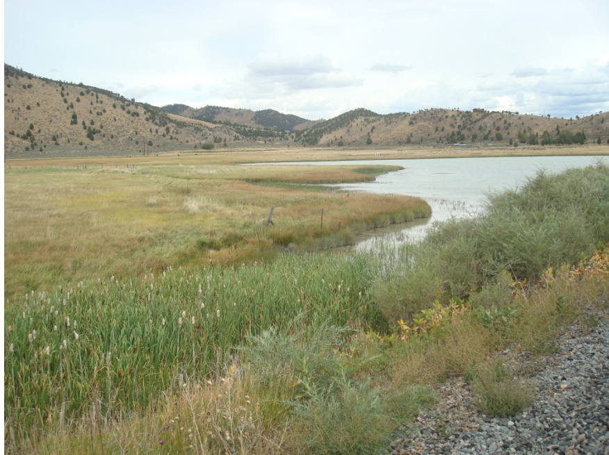
MO 3 – 23 September 2012