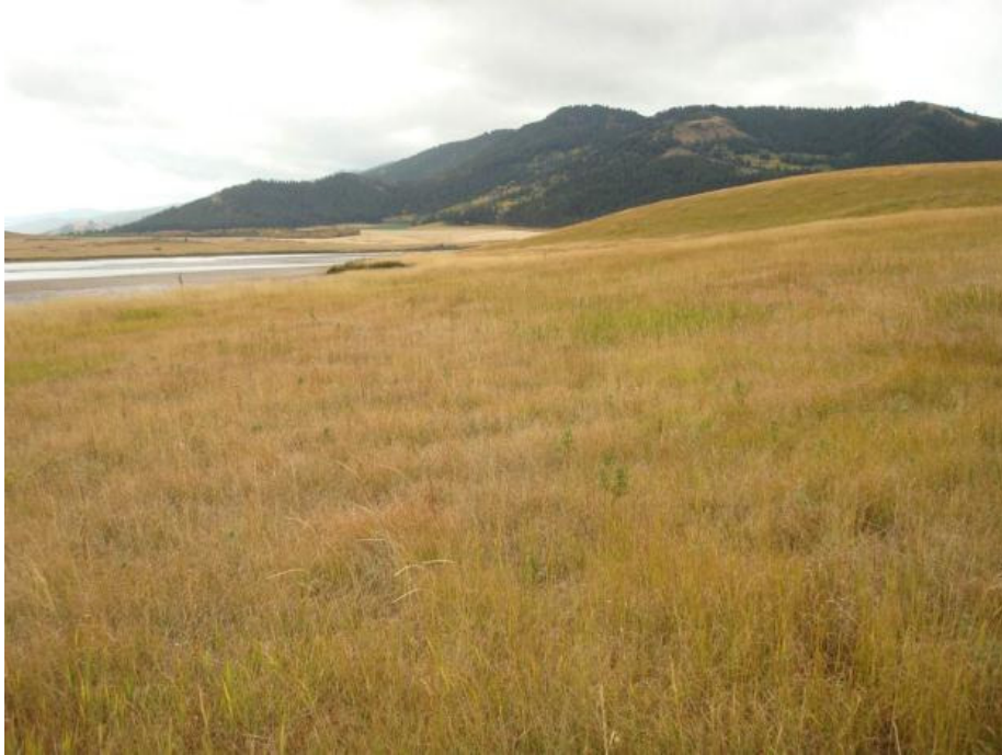
Alexander North Planting Location