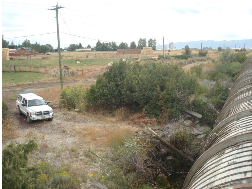
GD 2 – 28 August 2012