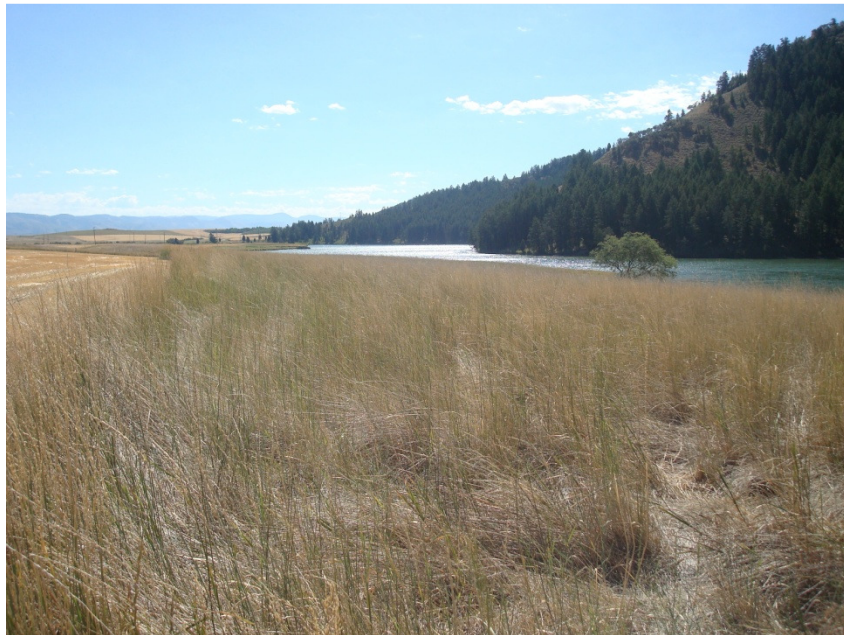
NA 4 – 23 September 2012