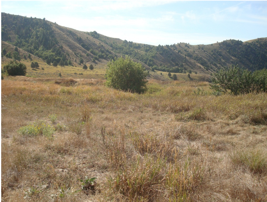
RP1 - 21 August 2012