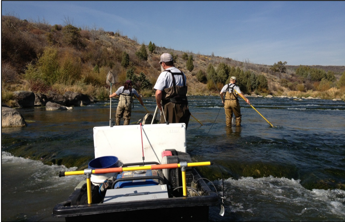
Idaho Department of Fish and Game field crew sampling the Black Canyon of the Bear River as part of the Bonneville cutthroat trout conservation hatchery evaluation.

The genetics study was completed by IDFG during 2007. IDFG completed its final report on the Telemetry Study during 2009. Results of these studies were synthesized in a Comprehensive Bonneville Cutthroat Trout Restoration Plan prepared by PacifiCorp in consultation with the ECC during 2008.