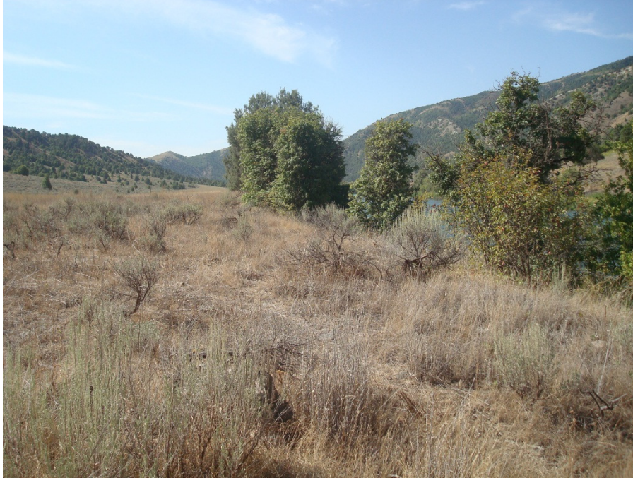
EP3 - 21 August 2012