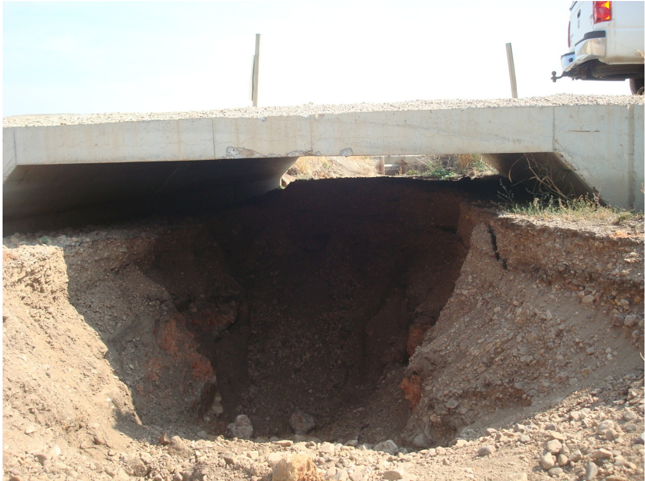
Nounan Road Crossing