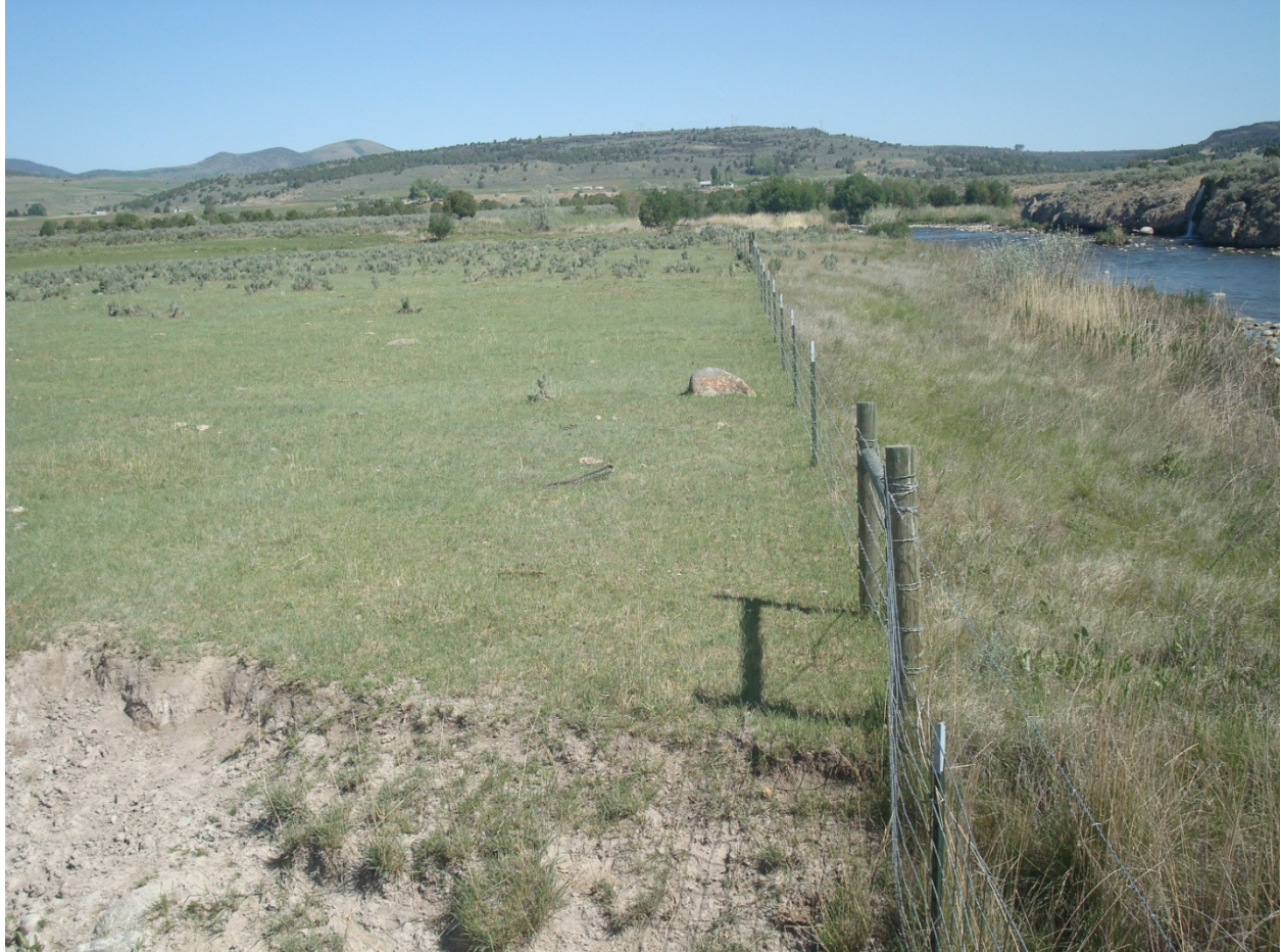
2012 Harris Riparian Section

2012 photo taken looking north along riparian/upland area.