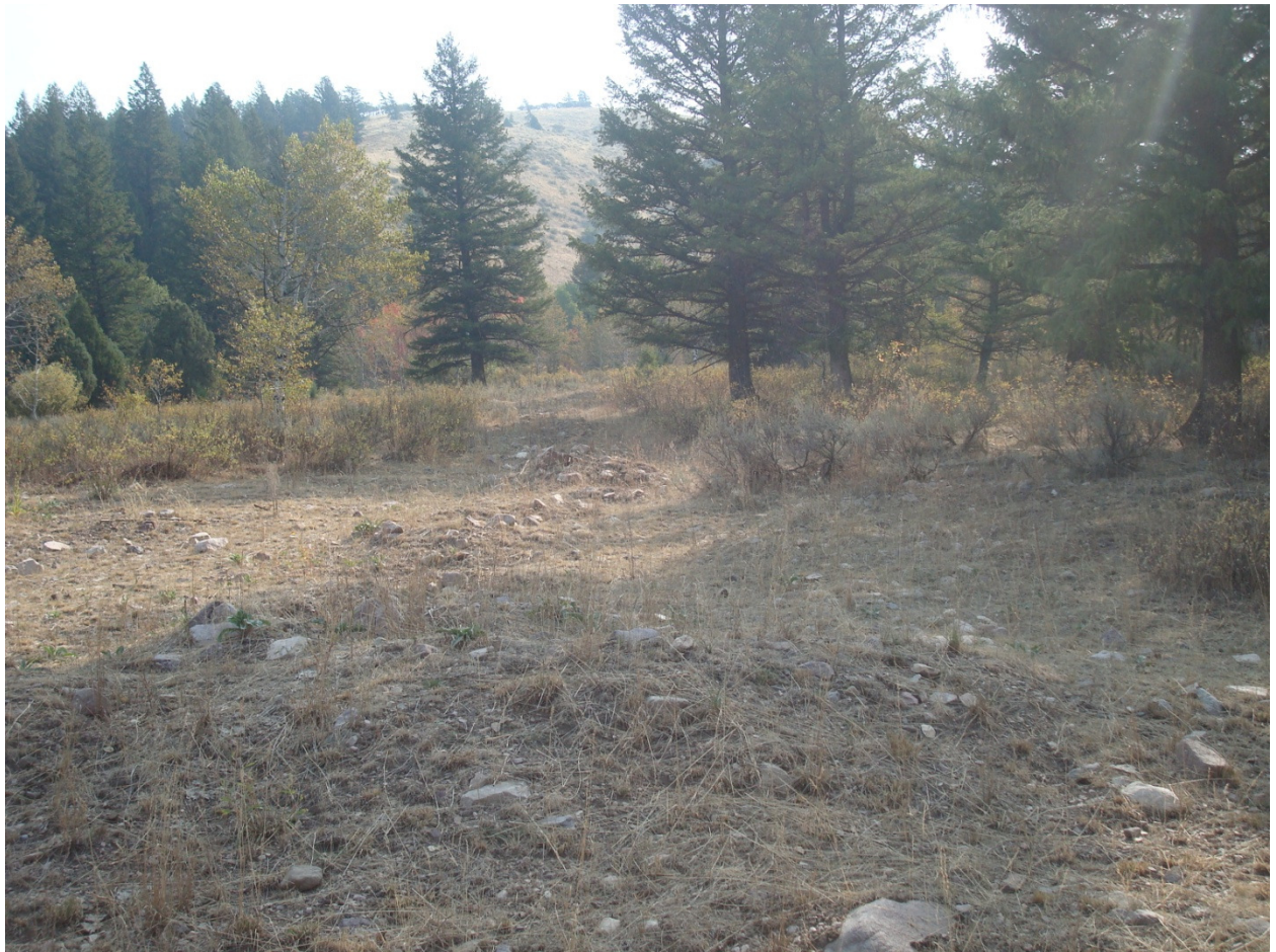
Eightmile Canyon #2