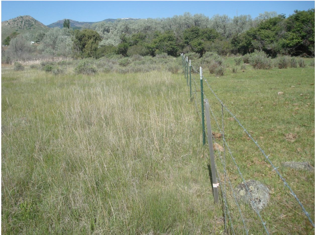
Olsen I 2012

2012 photo taken looking west from fence corner.