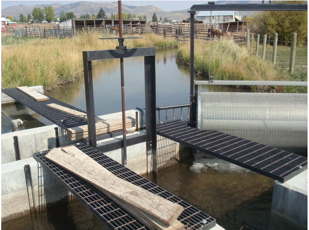
Alleman Dam Removal