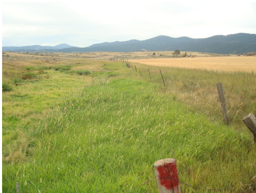
SA 3 – 23 September 2012