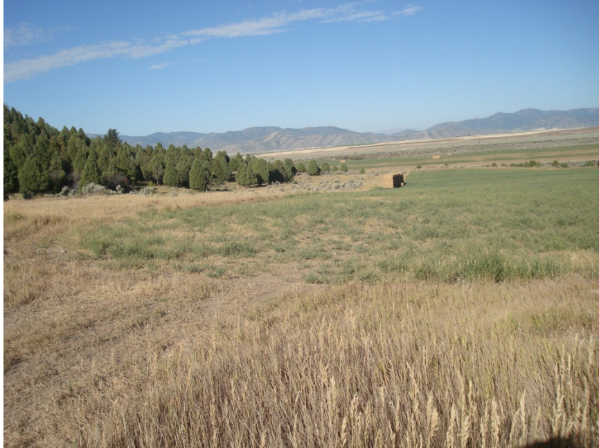
LC 5 – 28 August 2012