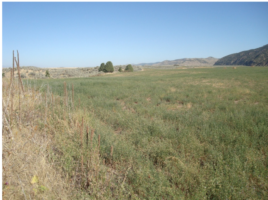
LC 6 – 28 August 2012