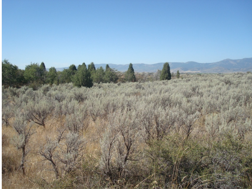
LC 3 – 28 August 2012