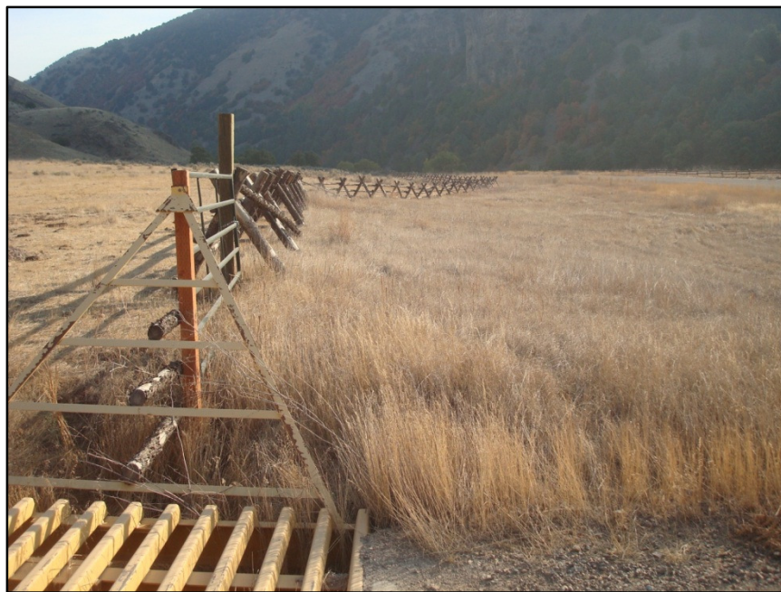
The Oneida Narrows riparian protection project, funded by the ECC in 2010, excludes cattle from the Oneida Narrows Boater take-out on BLM land along the Bear River.

A discussion of the activities associated with each of the PM&E measures is presented in Table 3.1-1 by License Article for the report period January - December 2012. A description of funding amounts deposited and disbursed during 2012 is provided in Section 4.0 - Funding.