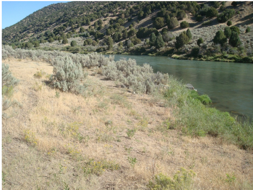
LC 2 – 28 August 2012