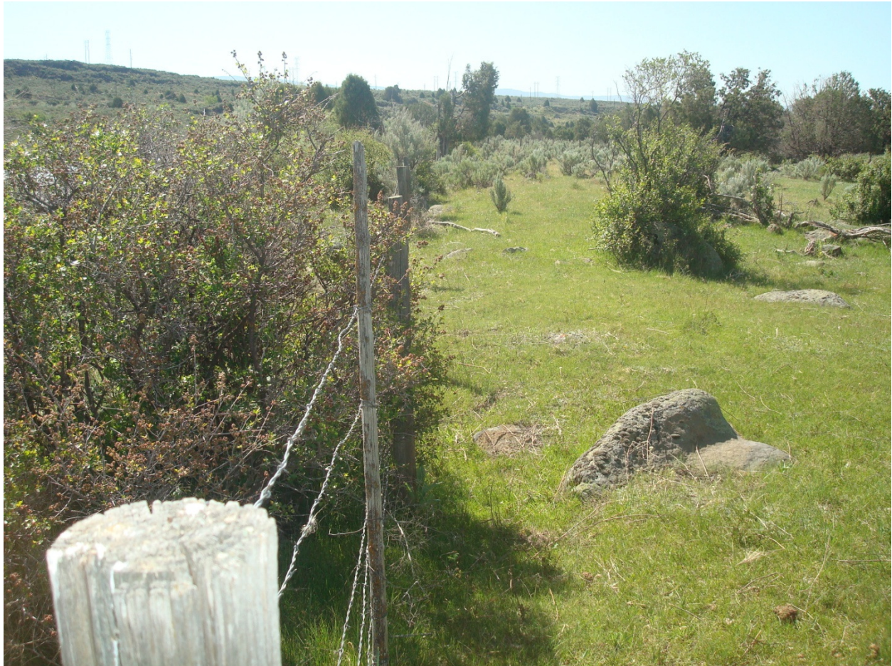
2012 Olsen II

2012 photo looking south through riparian zone.