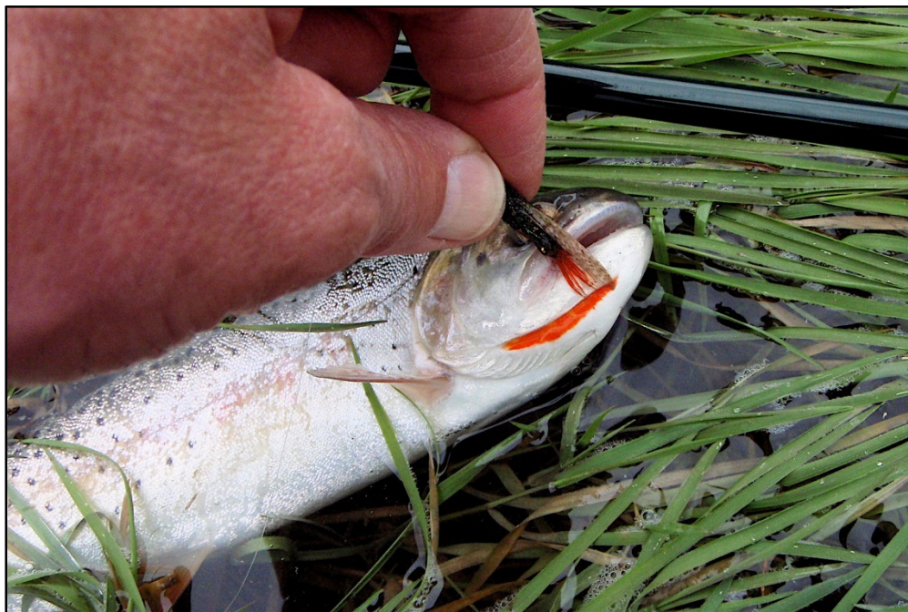
Kackley Springs Bonneville cutthroat trout.

The Kackley Springs Plan was completed as part of the Implementation Plan filed with FERC May 28, 2004 and an order modifying and approving the Kackley Springs Plan was issued by FERC March 22, 2005. The Kackley Springs Plan was also discussed by the ECC as part of the Grace-Cove Site Plan. The Kackley Springs Plan proposes studies and monitoring to determine the effects of flow on Bonneville cutthroat trout and other aquatic resources. In 2006, the ECC awarded a habitat enhancement fund grant to a graduate student to investigate options to reconnect the Kackley Springs flow to the channel that crosses the Kackley Parcel. The ECC reviewed this report during 2008 and conducted a field review of the site during its July 2008 meeting. A conceptual plan was agreed to by the ECC to discontinue diversion of the spring directly into the Bear River and send the water down a longer route that can potentially be used by native fish for spawning. Habitat enhancement funding was approved for the project during 2009 (see Article 405, above) and the Kackley Springs Reroute Project was completed later that year. Noxious weed control took place and additional shrubs and willow stakes were planted during 2009, 2010 and 2012. This article is now complete; however, the ECC approved a project to raise the elevation in the main pond during the 2012 grant fund cycle. Future land management activities around the springs will be conducted in accordance with the Grace-Cove Site Plan.