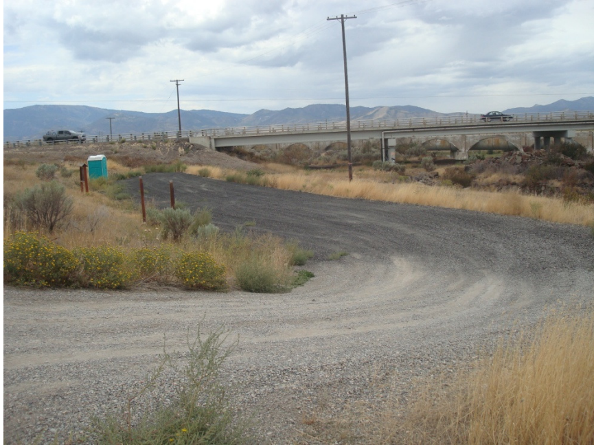
GD 1 – 28 August 2012