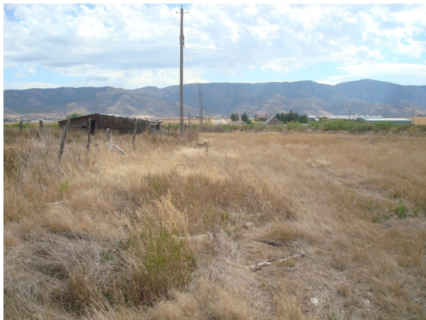
FL 1 – 28 August 2012