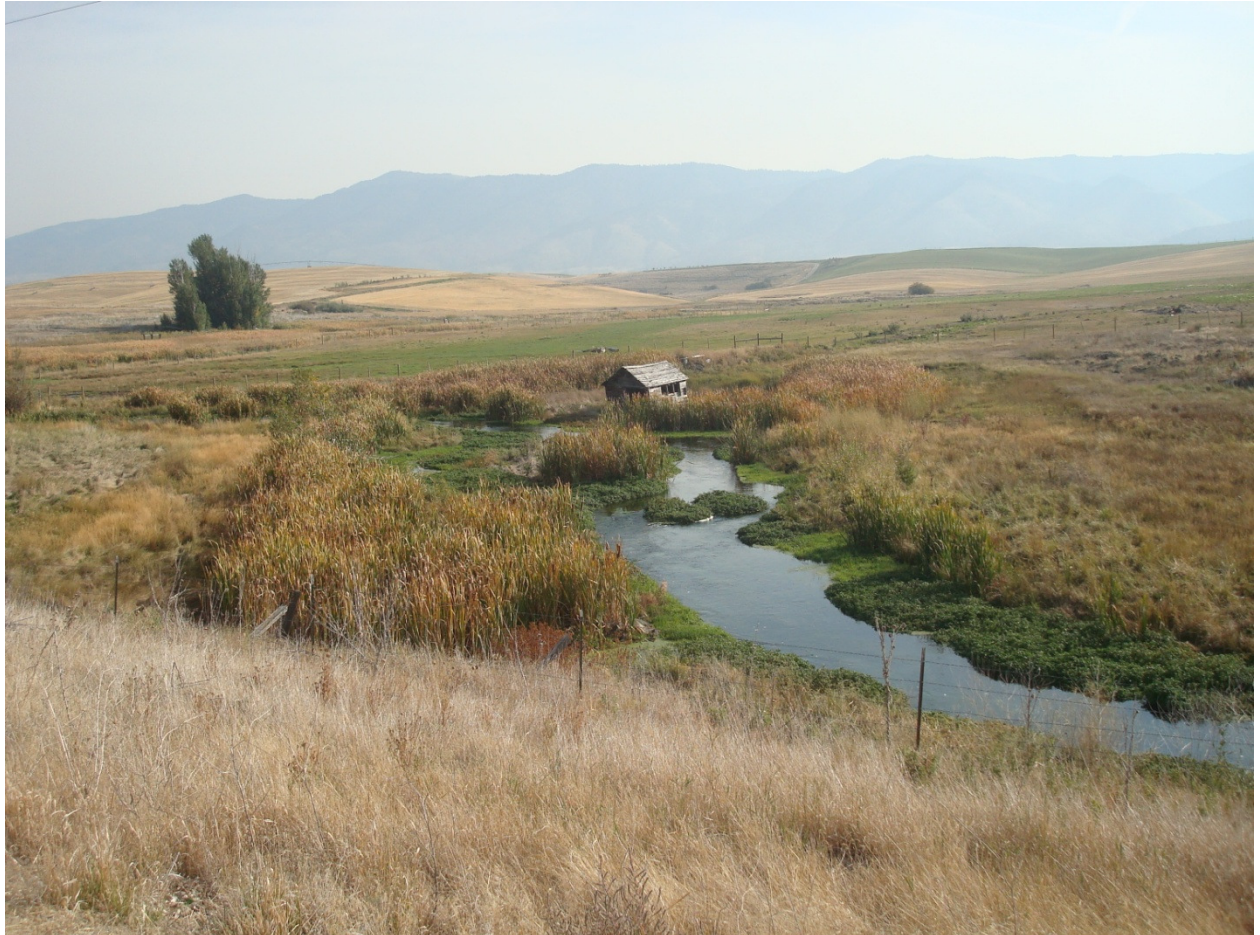
Whiskey Creek Habitat Restoration