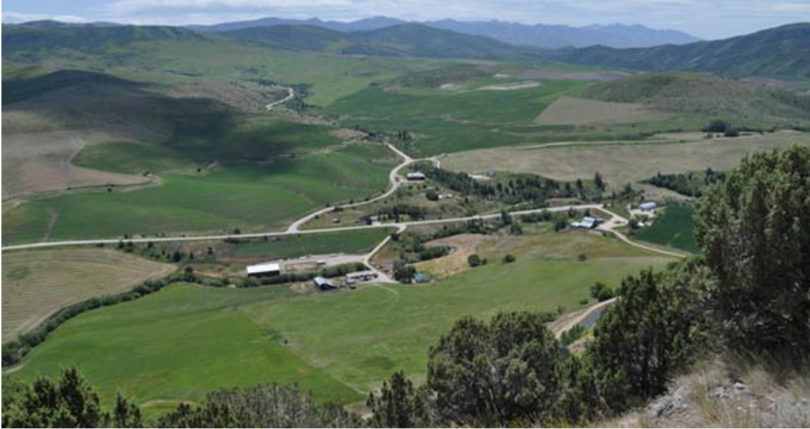
The Lower Christensen conservation easement, which closed in 2012, is located along Mink Creek in Franklin County, Idaho. The conservation easement will permanently protect the property's diverse open space values, including riparian woodlands along Mink Creek, as well as prime agricultural and ranch land.