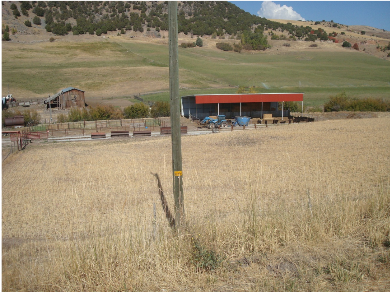
Battle and Mink Creek