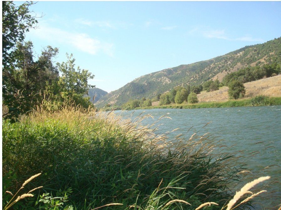
EP4 - 21 August 2012