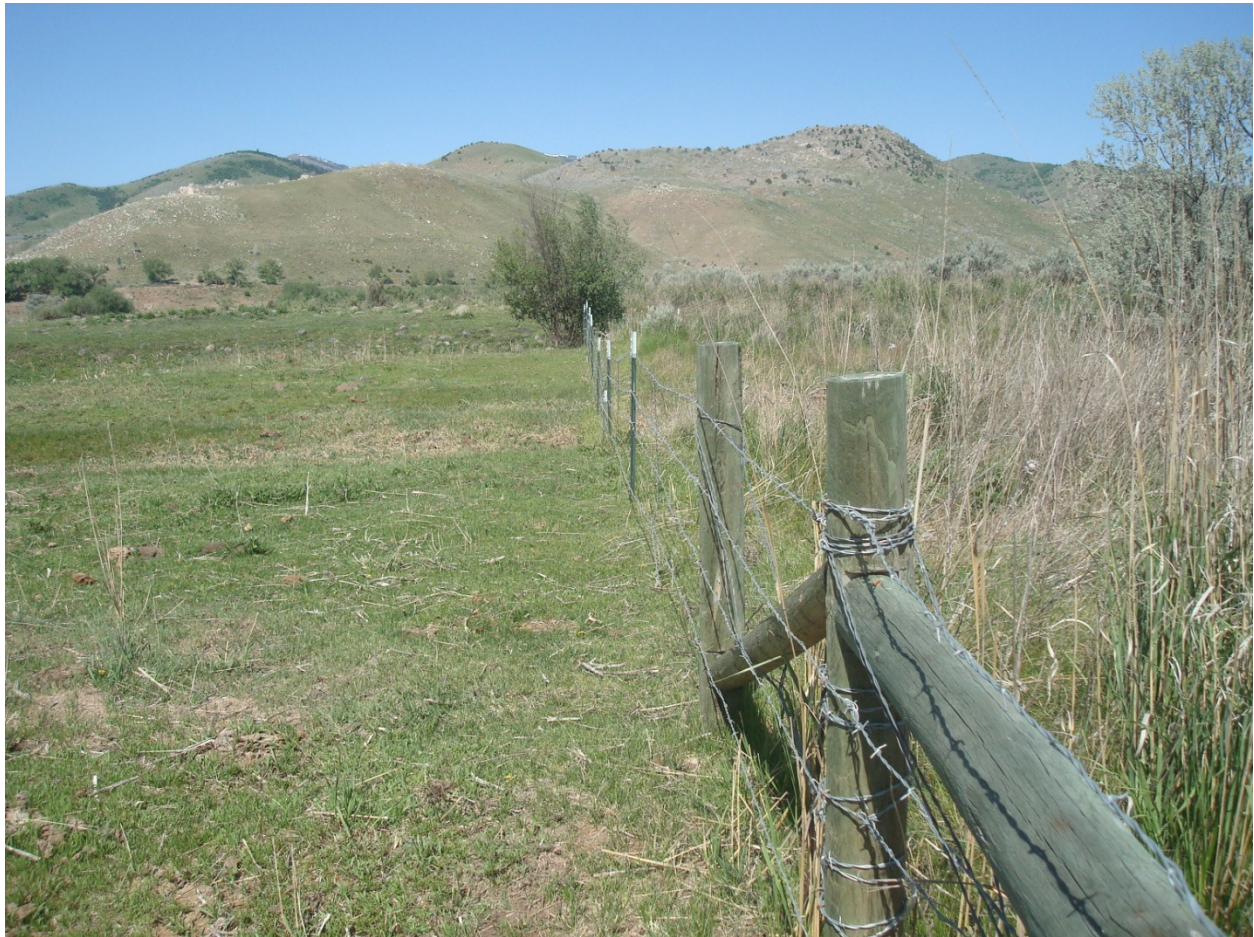
2012 Harris BLM Section

2012 photo taken looking west along BLM property line.