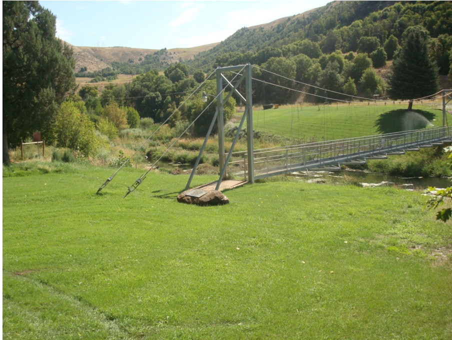
OP3 - 21 August 2012