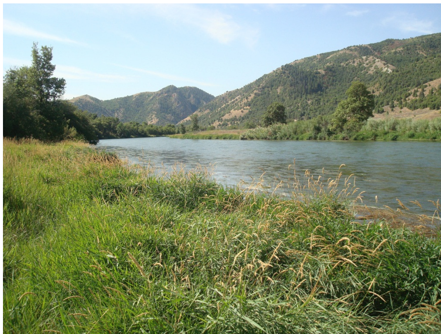
EP2 - 21 August 2012