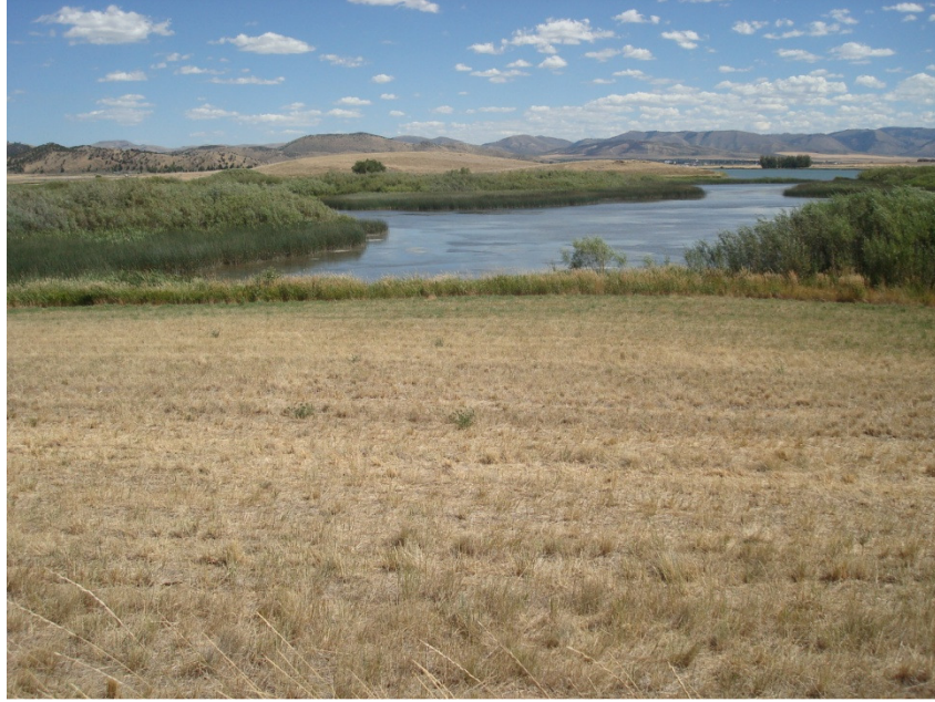
NA 3 – 23 September 2012