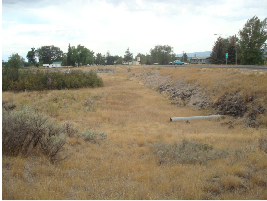
GD 3 – 28 August 2012