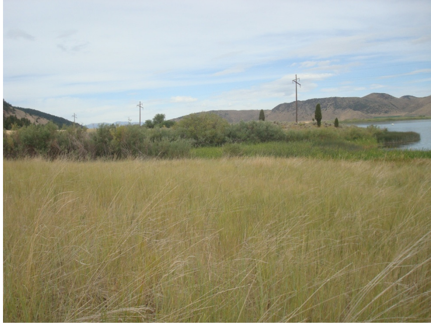
SA 2 – 23 September 2012