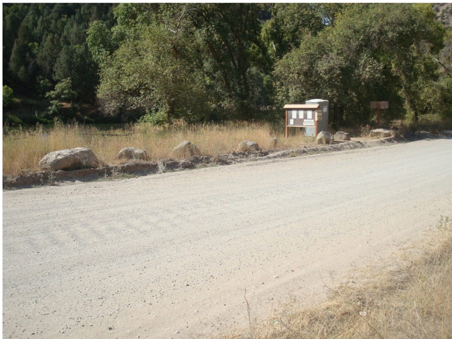
OP4 - 21 August 2012