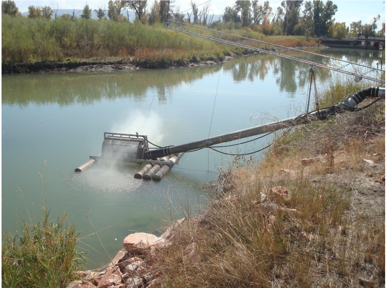
Keetch Fish Screen