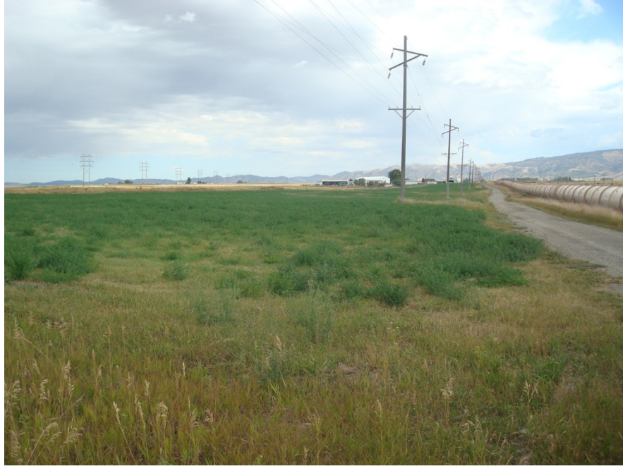
FL 4 – 28 August 2012