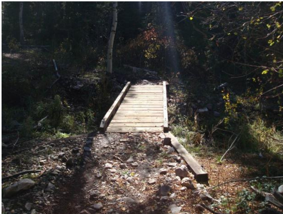
Eightmile Canyon #5, Bridge #2