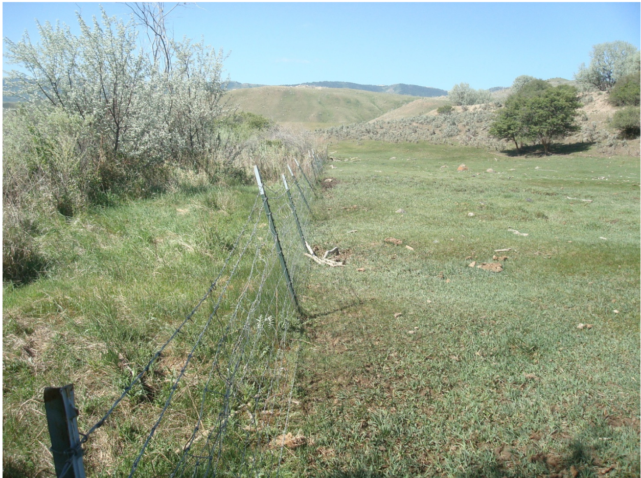
2012 McCurdy II

2012 photo looking south through McCurdy II riparian zone.