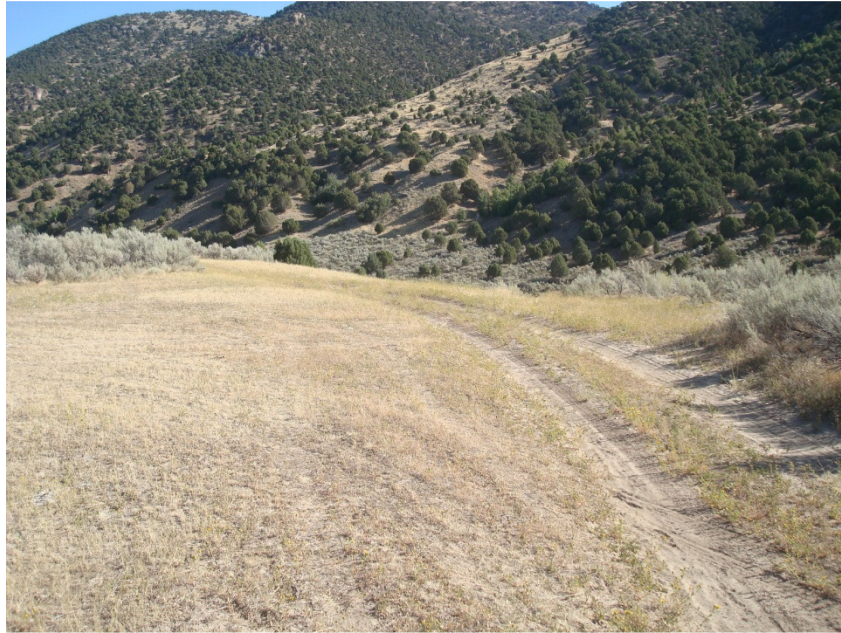
LC 1 – 28 August 2012