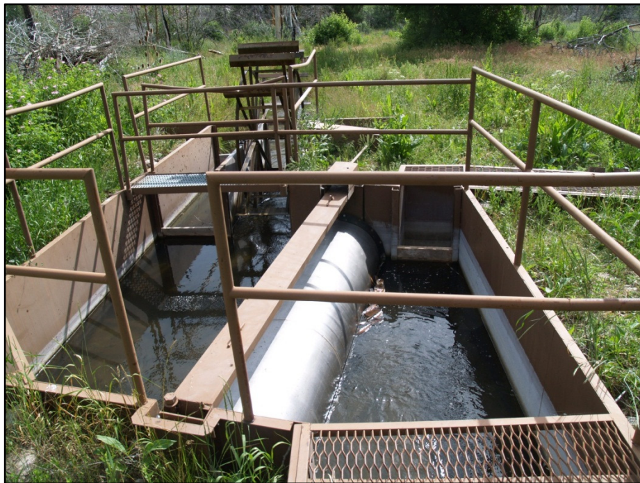
A fish screen on the lower diversion of Cottonwood Creek, funded by the ECC in 2005, prevents fish from being entrained in the irrigation canal.

The ECC awarded $39,000 to Trout Unlimited for an estimated $168,000 project to fabricate and install rotary drum fish screens for the Davis and Treasureton diversions on upper Cottonwood Creek. The project will eliminate the entrainment of fish in canals at two problematic irrigation diversions on Cottonwood Creek. Upper Cottonwood Creek contains a strong population of resident Bonneville cutthroat trout and has the potential to produce large numbers of juvenile BCT on an annual basis. Shepherding this excess production to the mainstem Bear River is expected to increase numbers of migratory native trout in the Thatcher reach of the Bear River. This project will compliment fish passage and screening efforts taking place downstream, as well as BCT recovery efforts underway throughout the Thatcher reach.