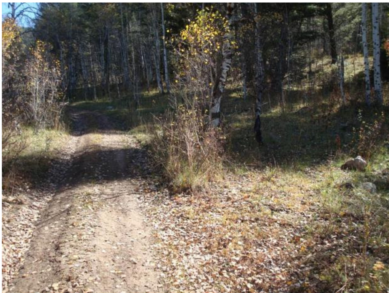
Eightmile Canyon #1