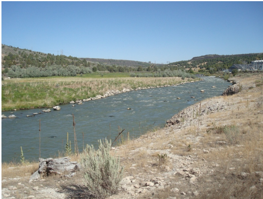
Cove Forebay (New Photo Point added in 2012)