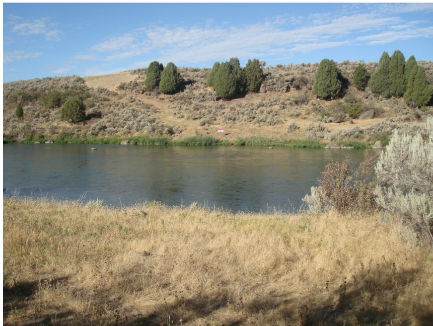
LC 4 – 28 August 2012