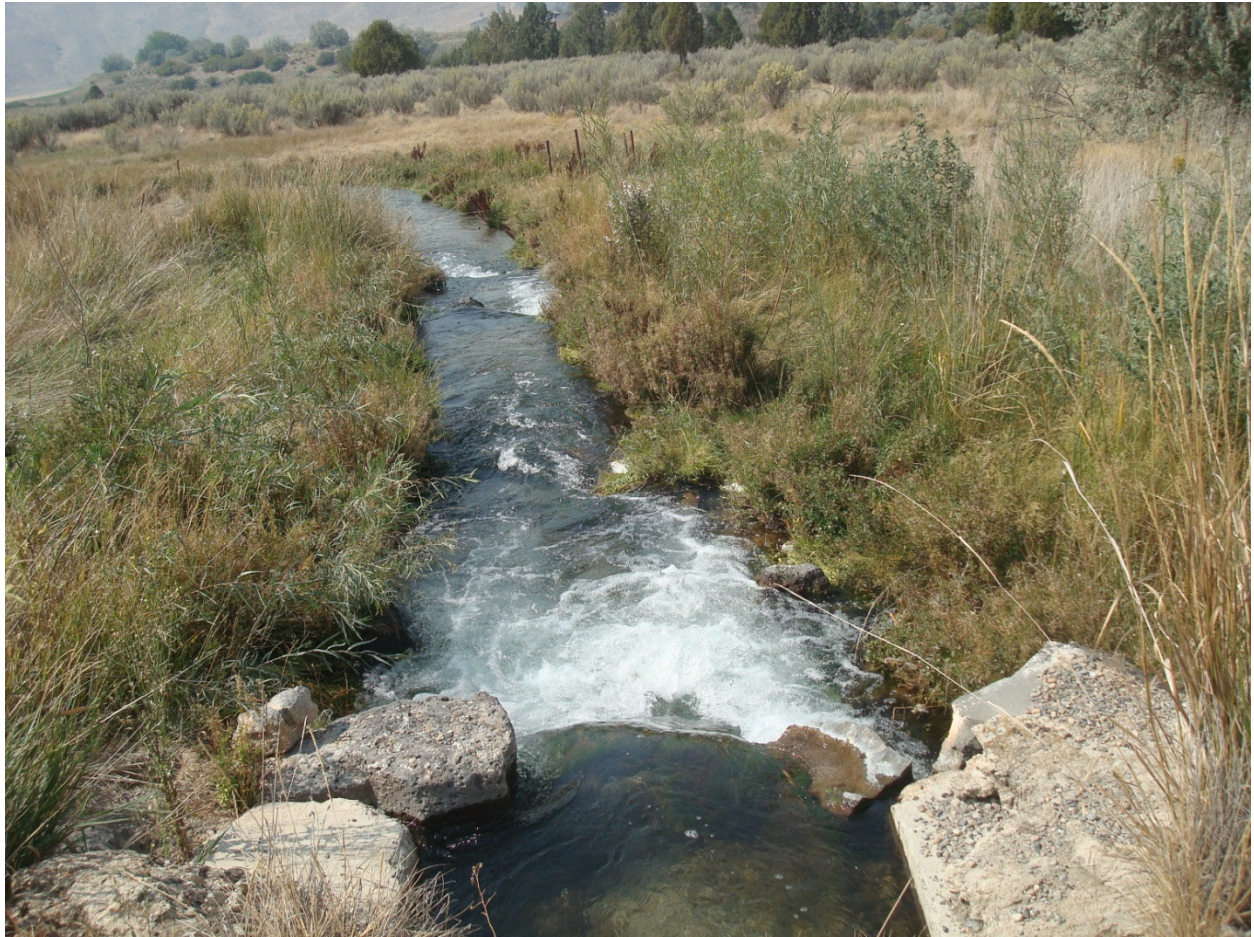
Kackley Springs Reroute