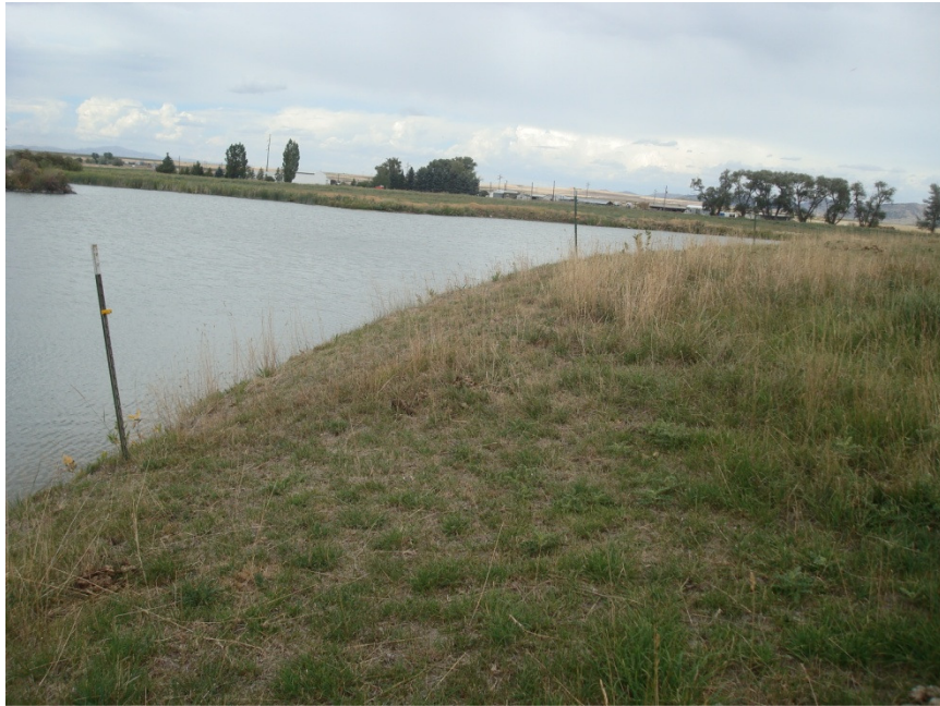
GD 4 – 28 August 2012