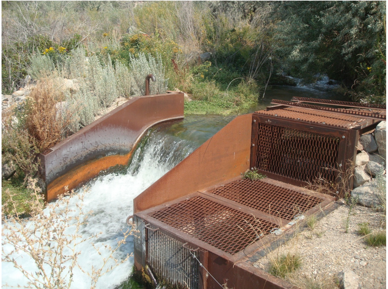
Kackley Springs Fish Trap