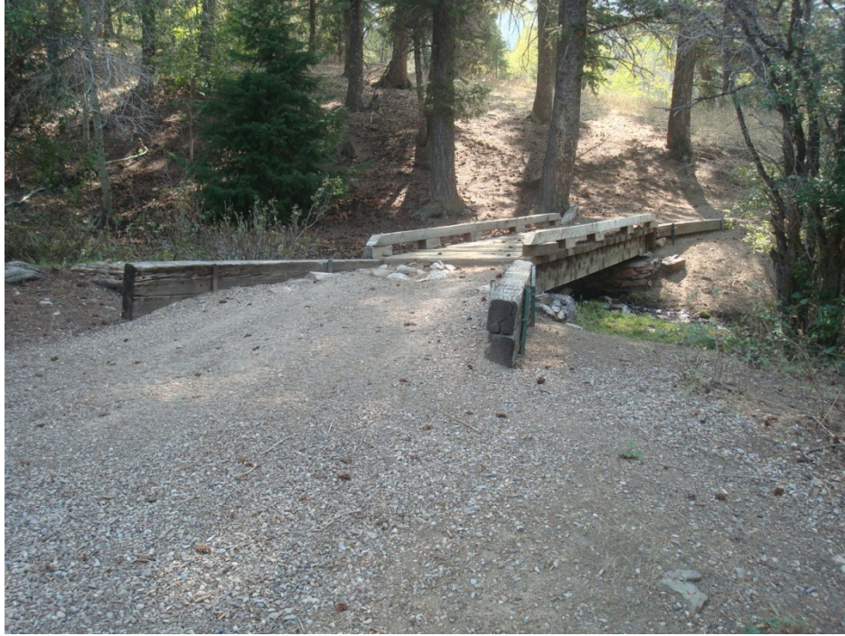
Eightmile Canyon #5, Bridge #1