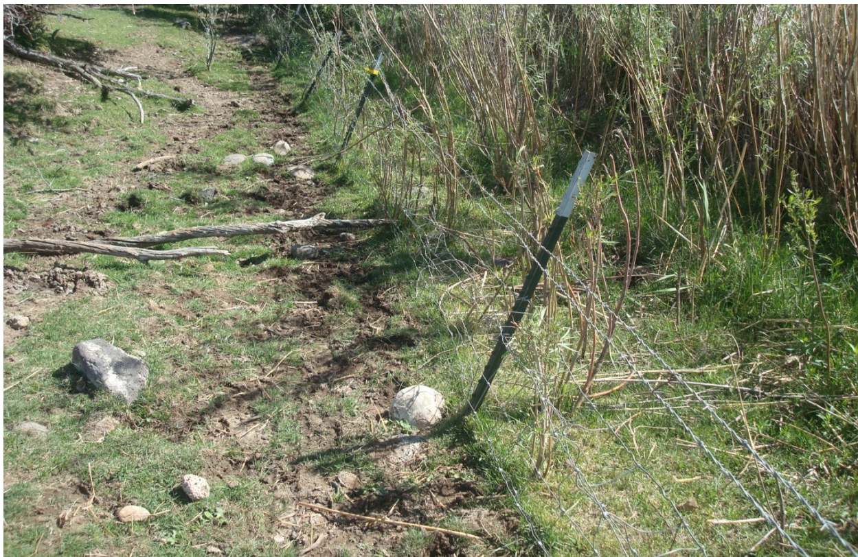
McCurdy II fence damage 2012