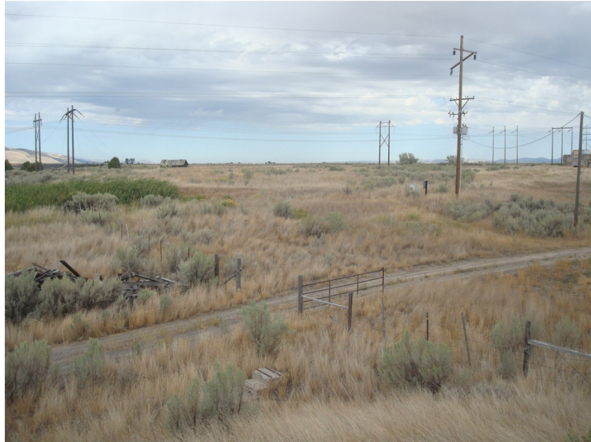
FL 3 – 28 August 2012