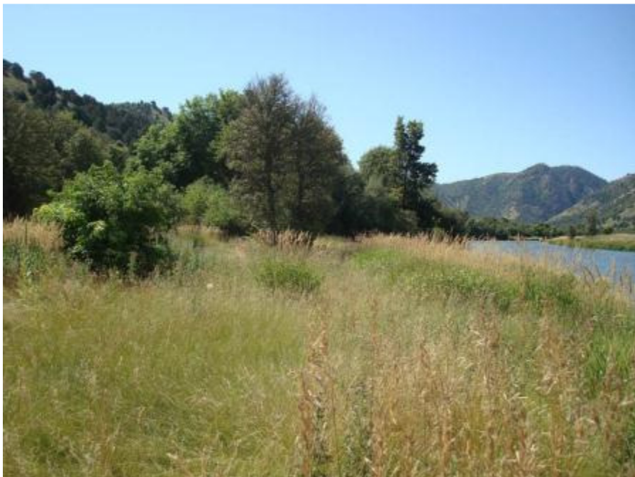
RP4 - 21 August 2012