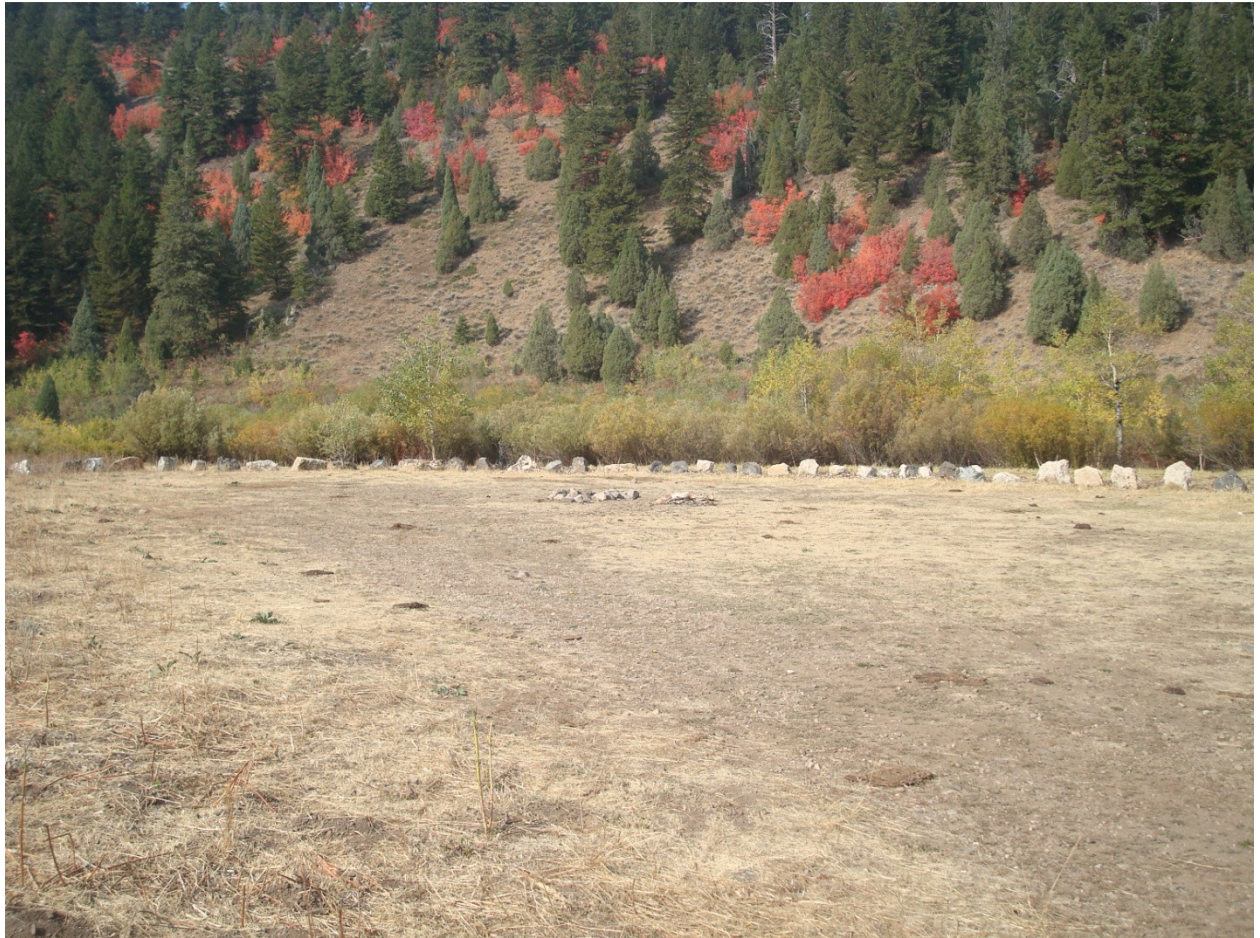
Eightmile Canyon #3