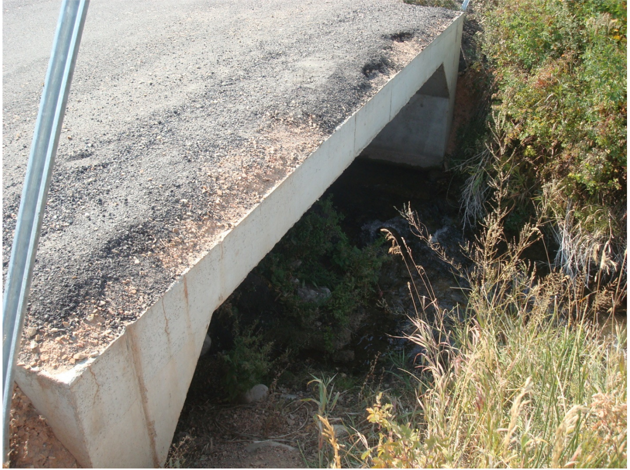
Bailey Creek Culvert