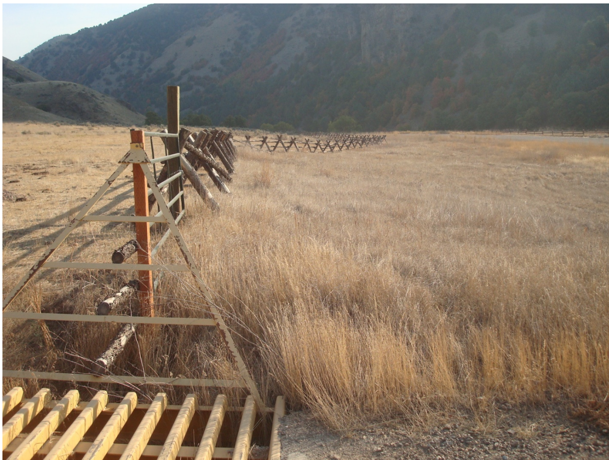
Oneida Narrows Riparian Protection