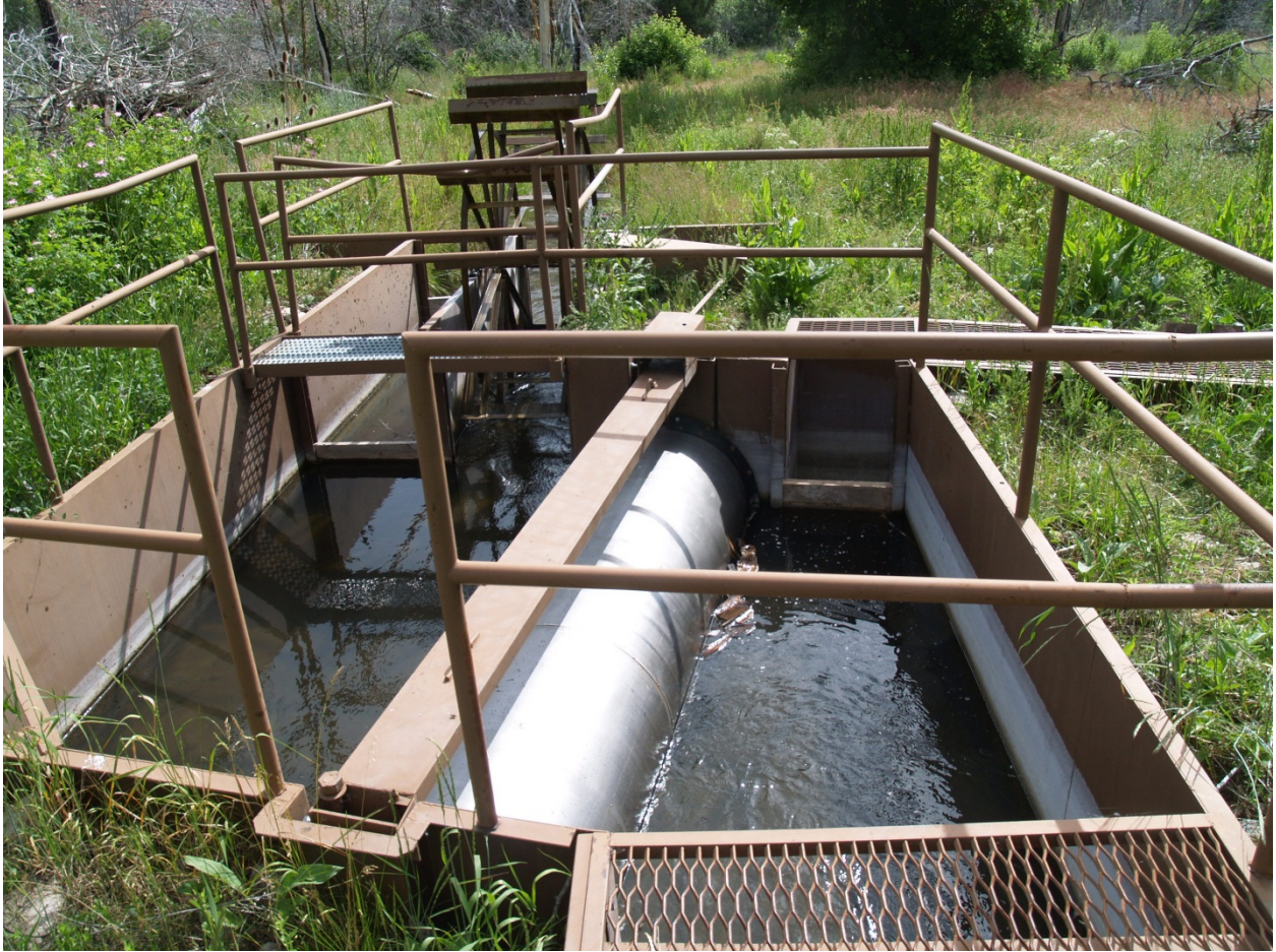
Cottonwood Creek Lower Diversion