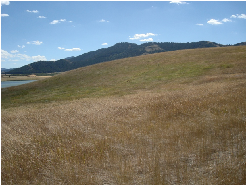
NA 2 – 23 September 2012