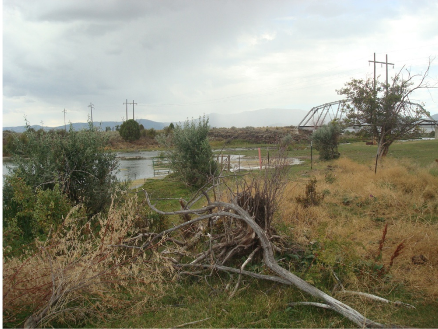
GD 5 – 28 August 2012