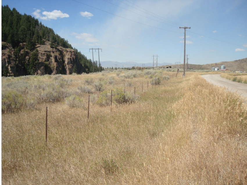
NA 1 – 23 September 2012