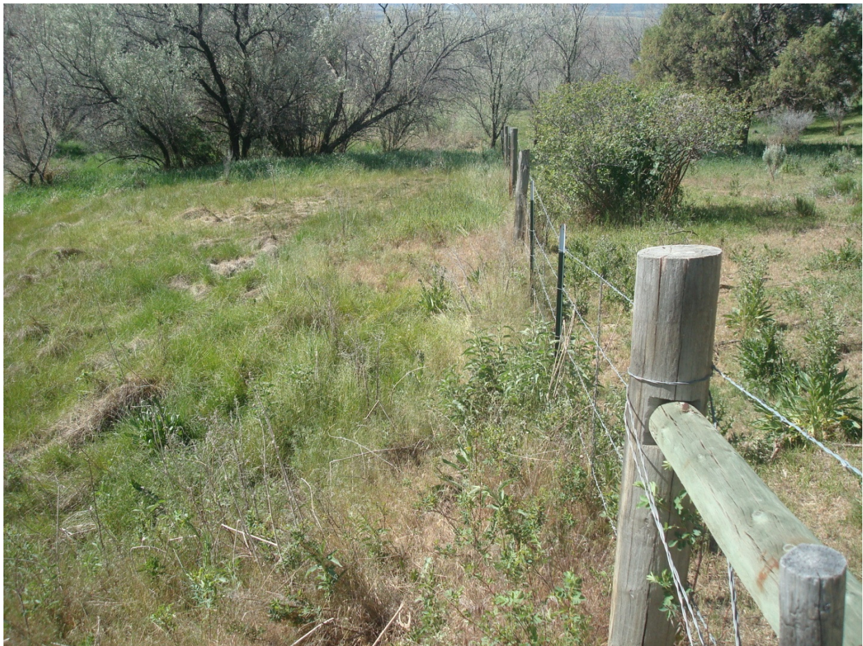
McCurdy I 2012

2012 photo looking south on west boundary.