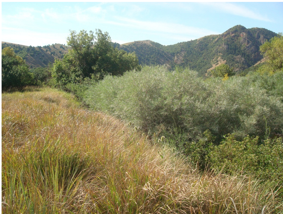
RP2 - 21 August 2012