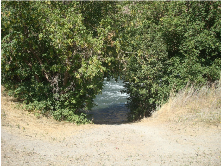
OP 1 - 21 August 2012