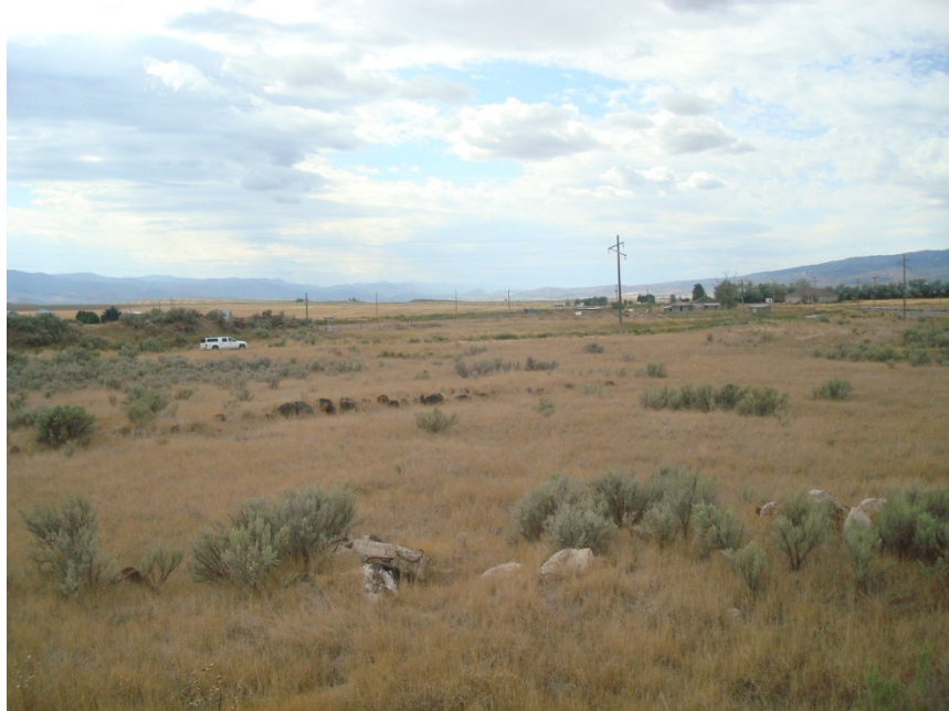
FL 2 – 28 August 2012