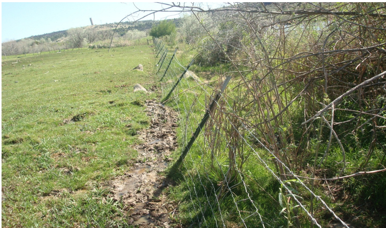
McCurdy II fence damage 2012