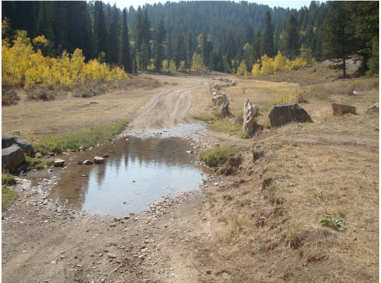
Eightmile Canyon #10