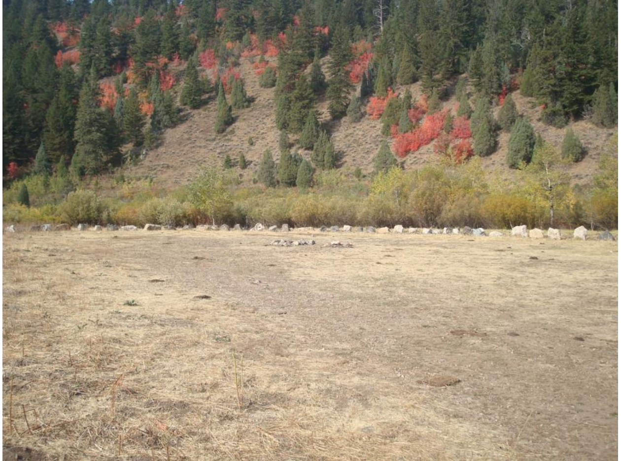
Eightmile Canyon #3