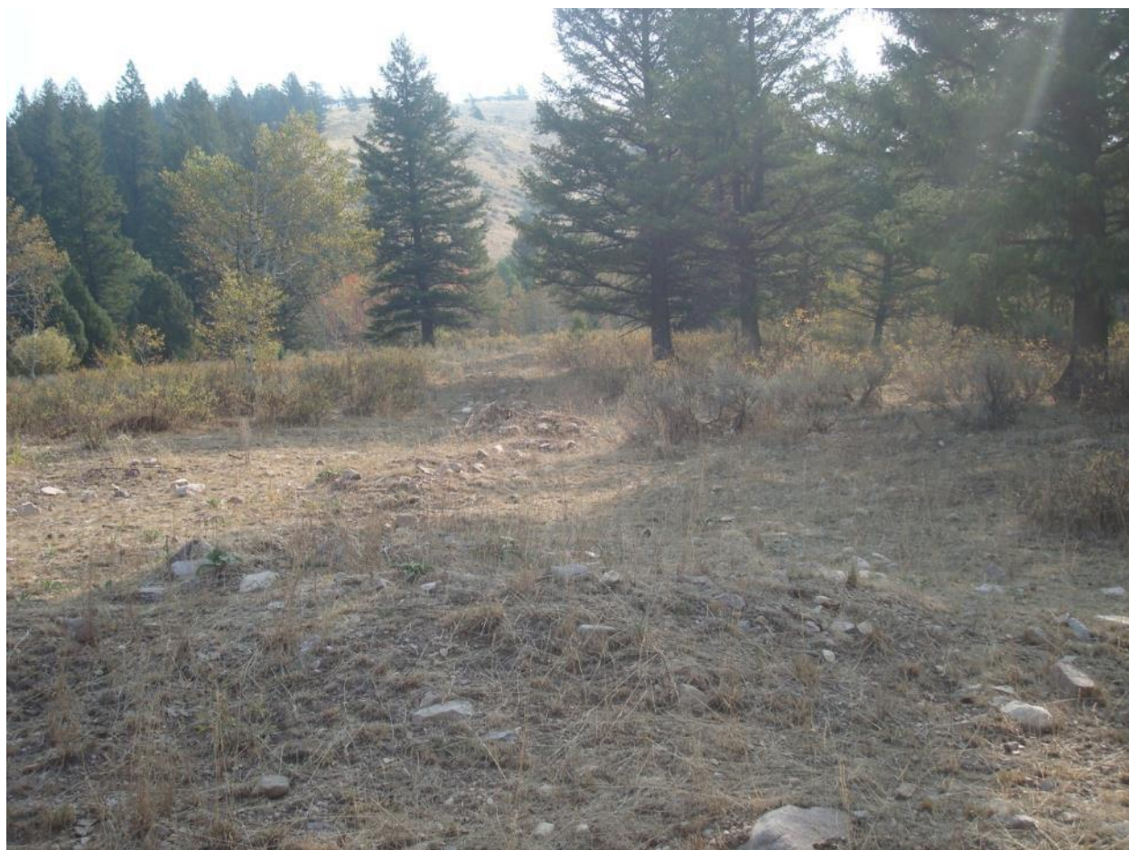
Eightmile Canyon #2