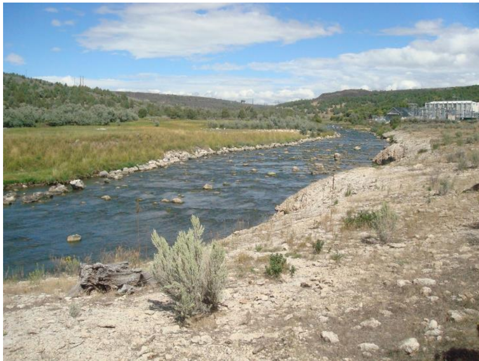
Cove Forebay (New photo point added in 2012)