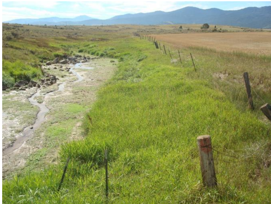
SA 3 – 9 September 2013