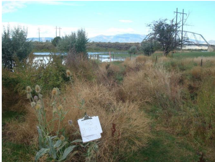
GD 5 – 5 September 2013