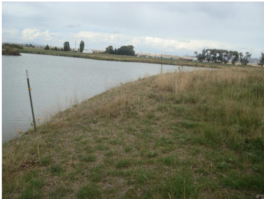
GD 4 – 5 September 2013