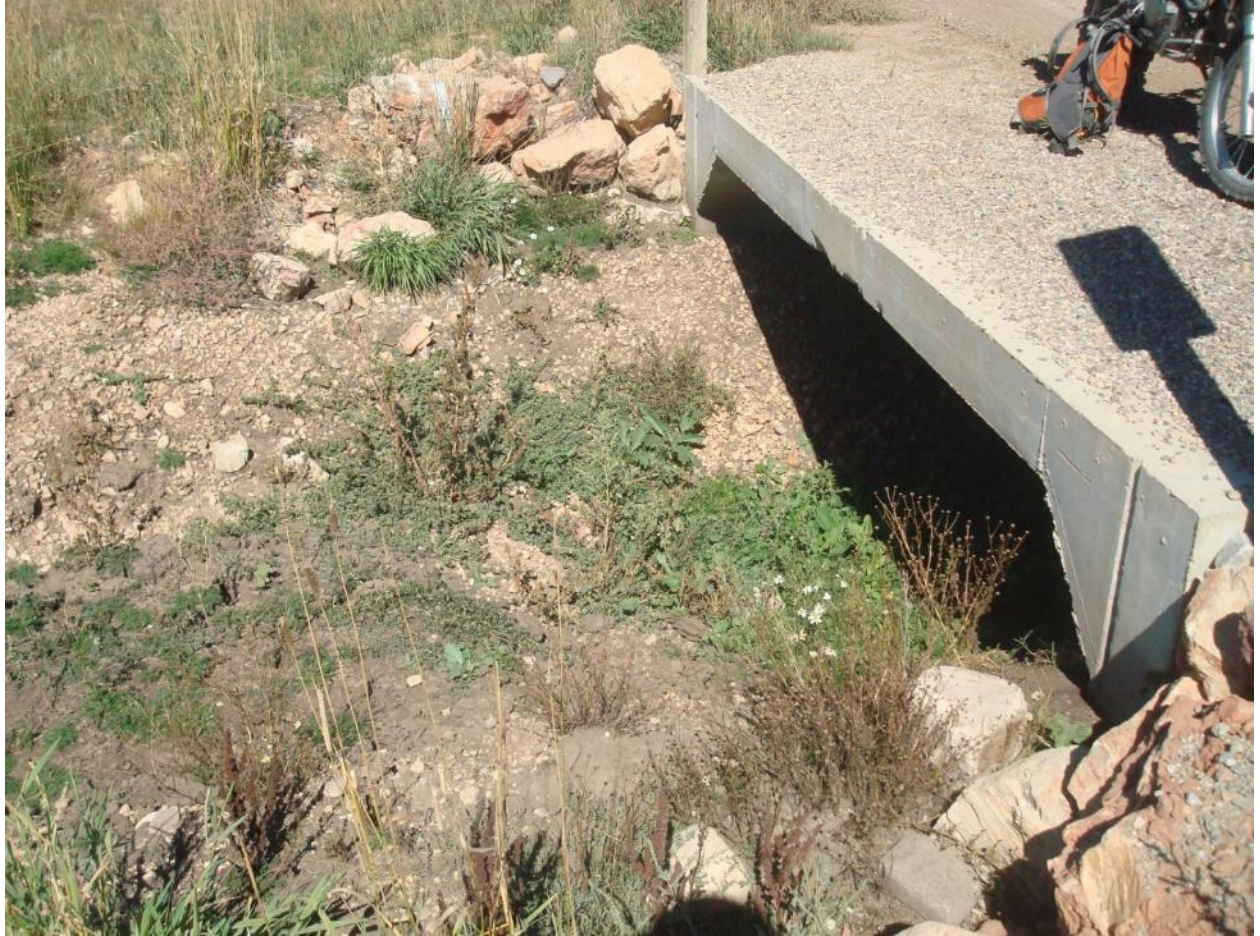
Nounan Road Crossing