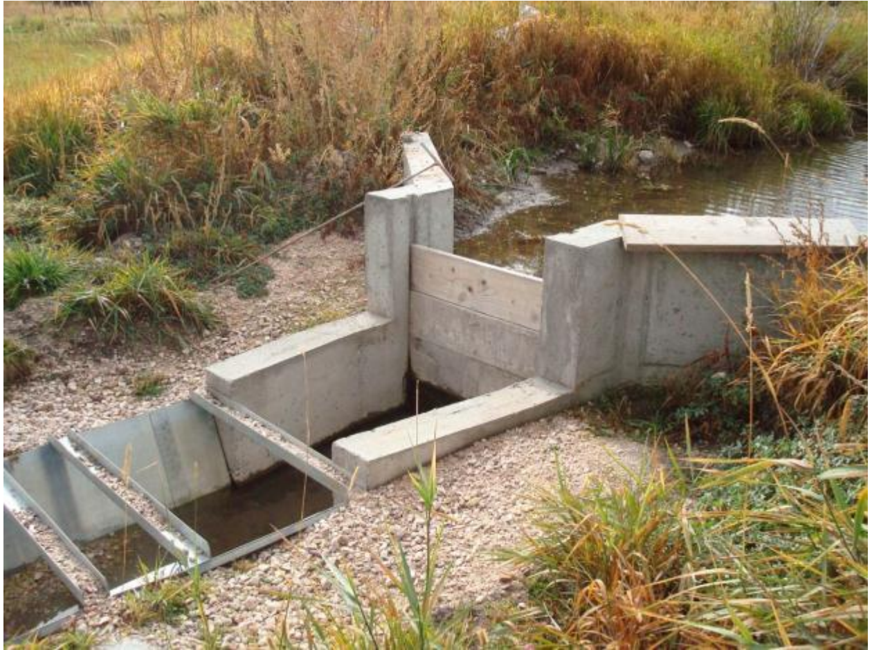
Bunderson Fish Bypass