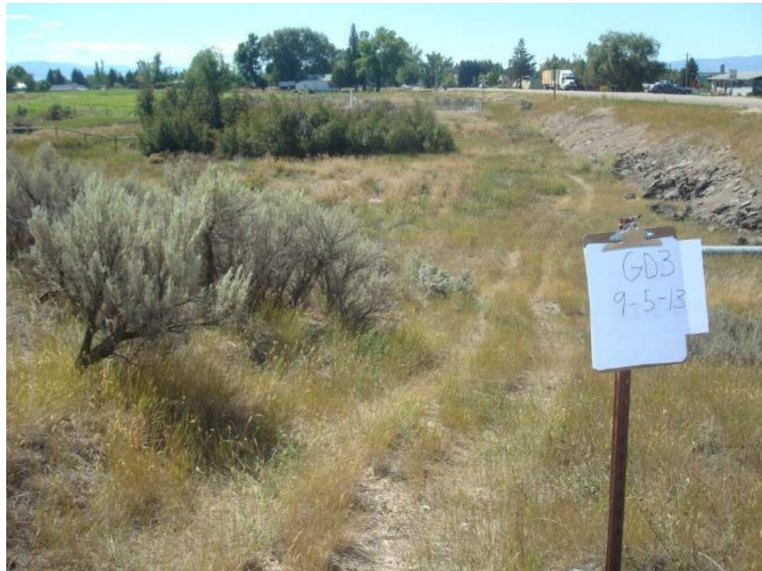
GD 3 – 5 September 2013