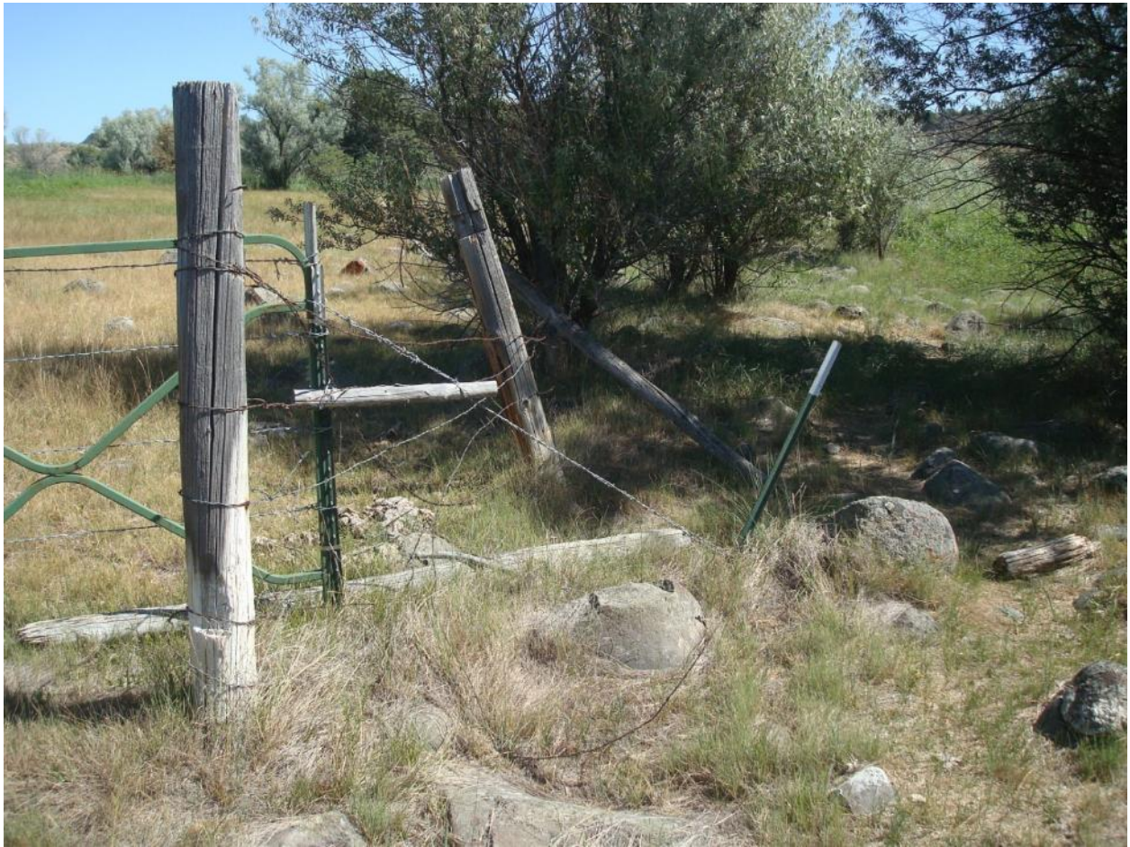
PacifiCorp property fence damage (This fence connects to Olsen I)