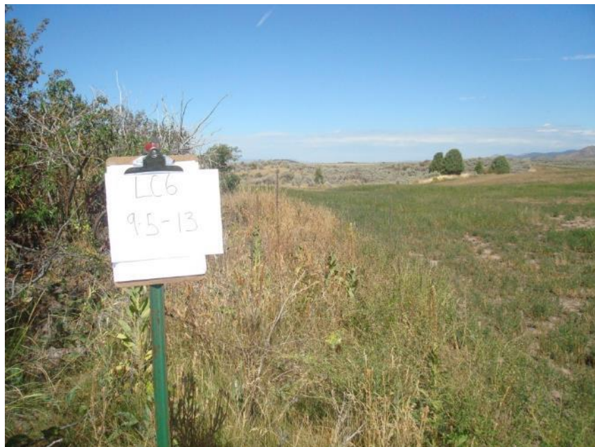
LC 6 – 5 September 2013