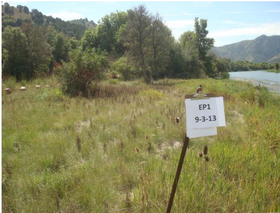
EP1 - 3 September 2013