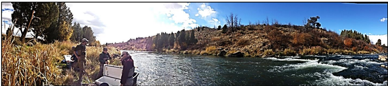
Idaho Department of Fish and Game field crew sampling as part of the Bonneville cutthroat trout conservation hatchery evaluation.

The Oneida Development Water Year 2013 Operation Report was completed during the 2013 reporting period and has been submitted along with this annual report to the FERC.