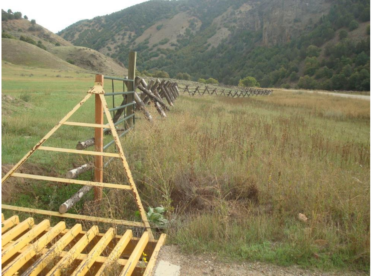
Oneida Narrows Riparian Protection