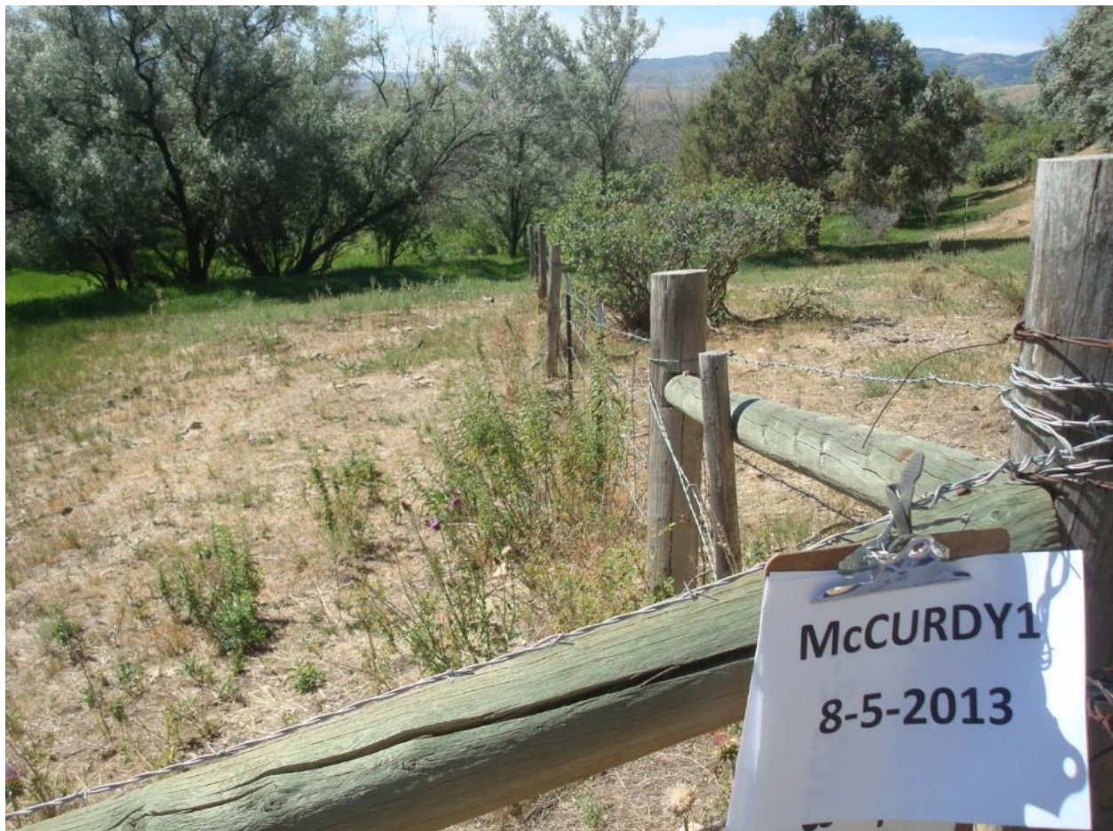
McCurdy I 2013

2013 photo looking south on west boundary.