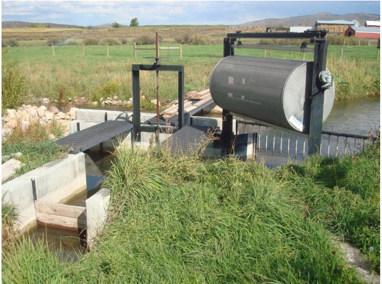
Alleman Dam Removal