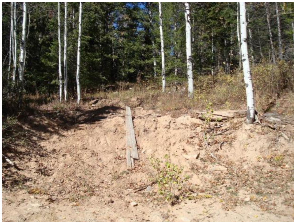
Eightmile Canyon #9