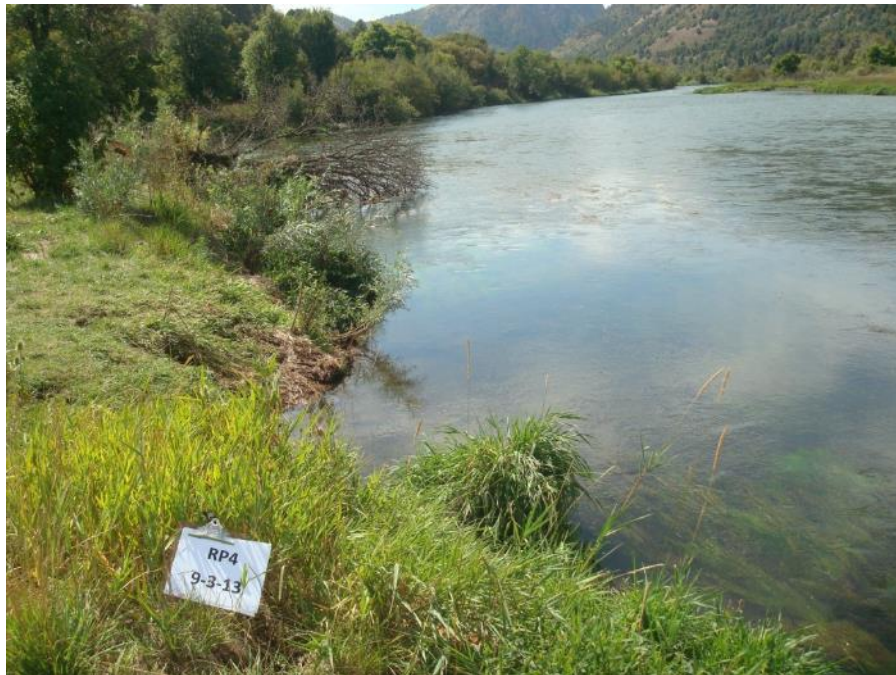
RP4 – 3 September 2013