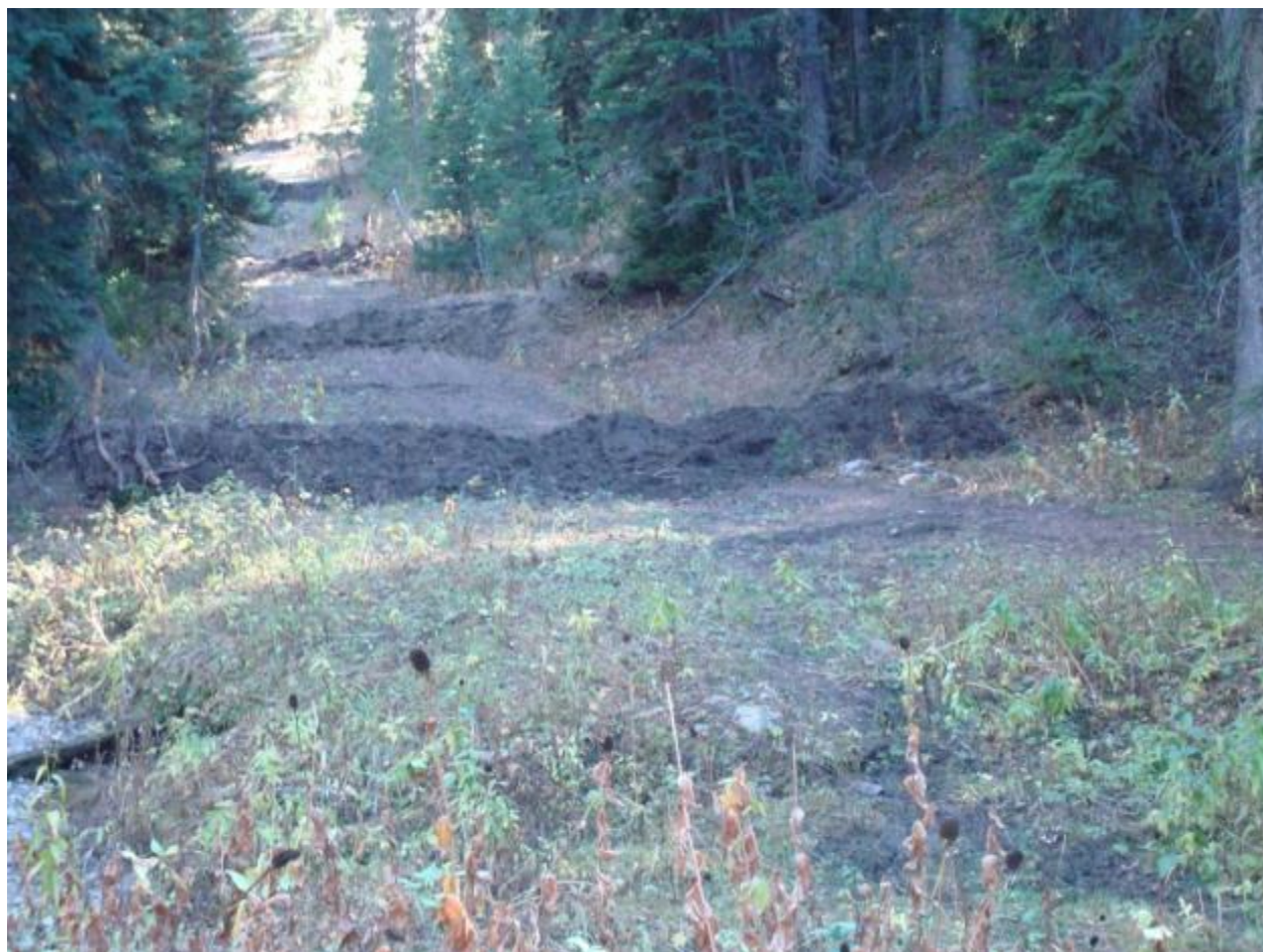
Eightmile Canyon #7