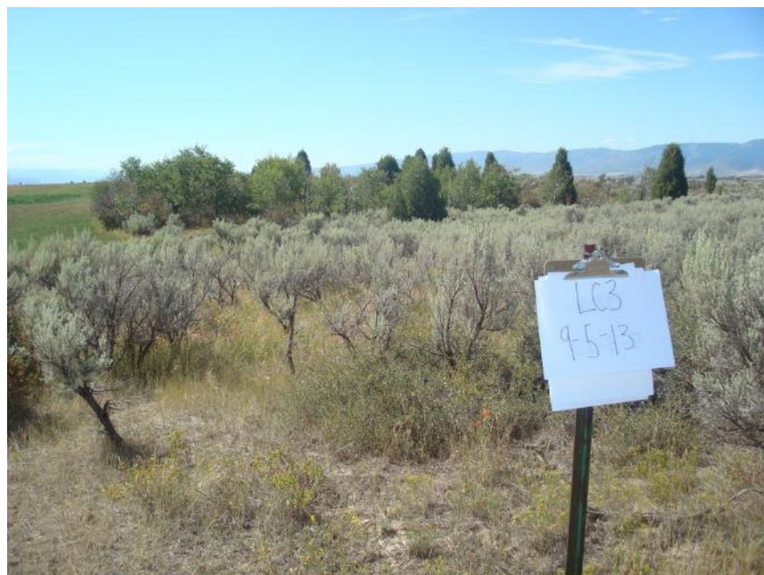
LC 3 – 5 September 2013