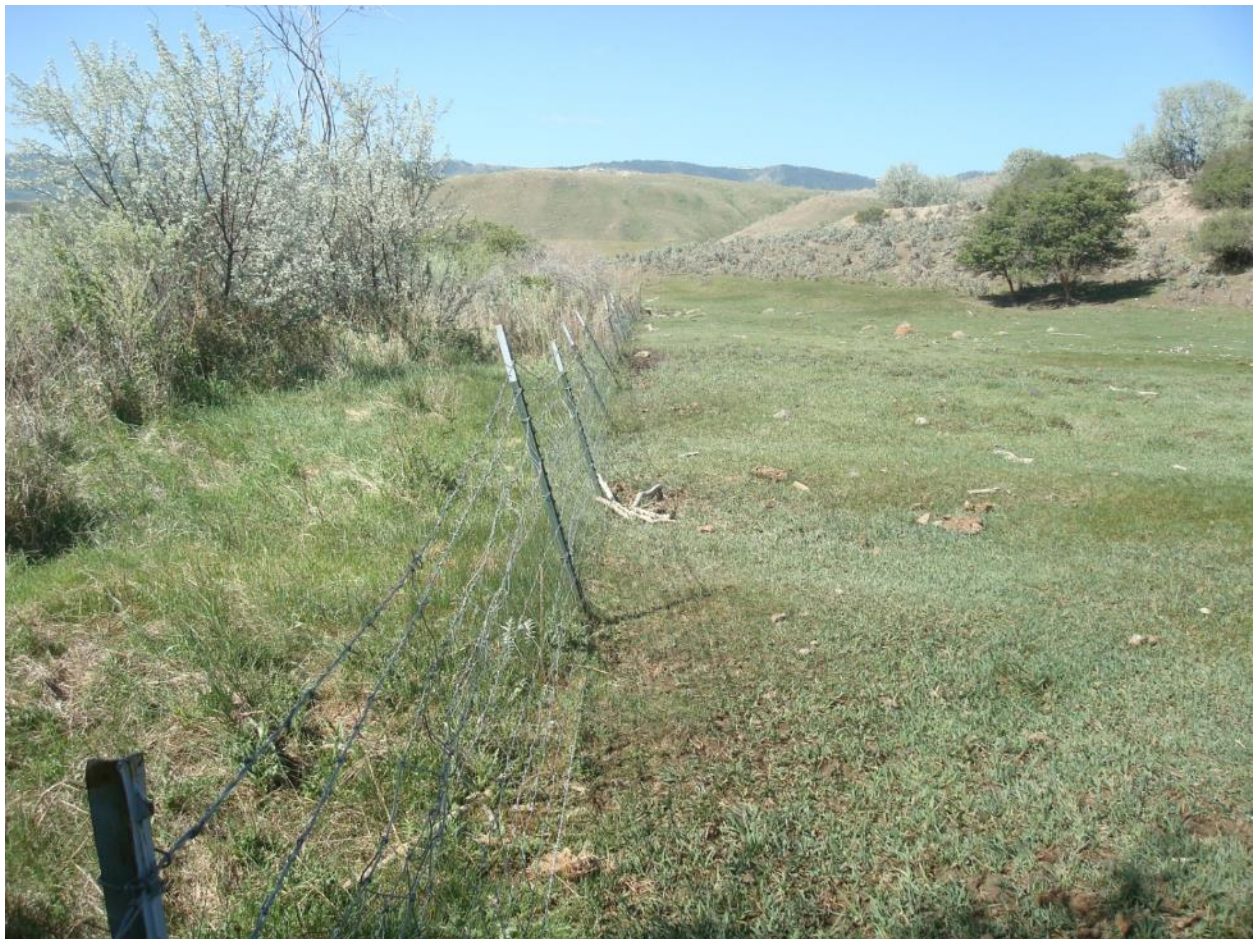
2013 McCurdy II

2013 photo looking south through McCurdy II riparian zone.