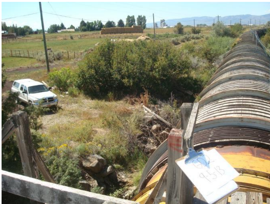
GD 2 – 5 September 2013