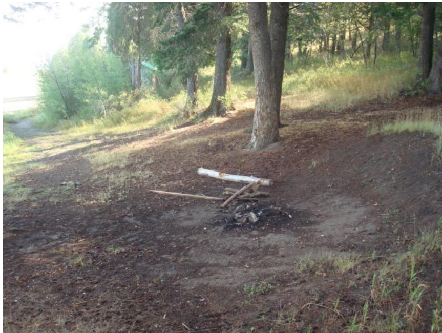
AL 1 – 9 September 2013