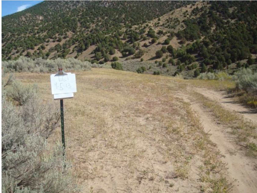
LC 1 – 5 September 2013