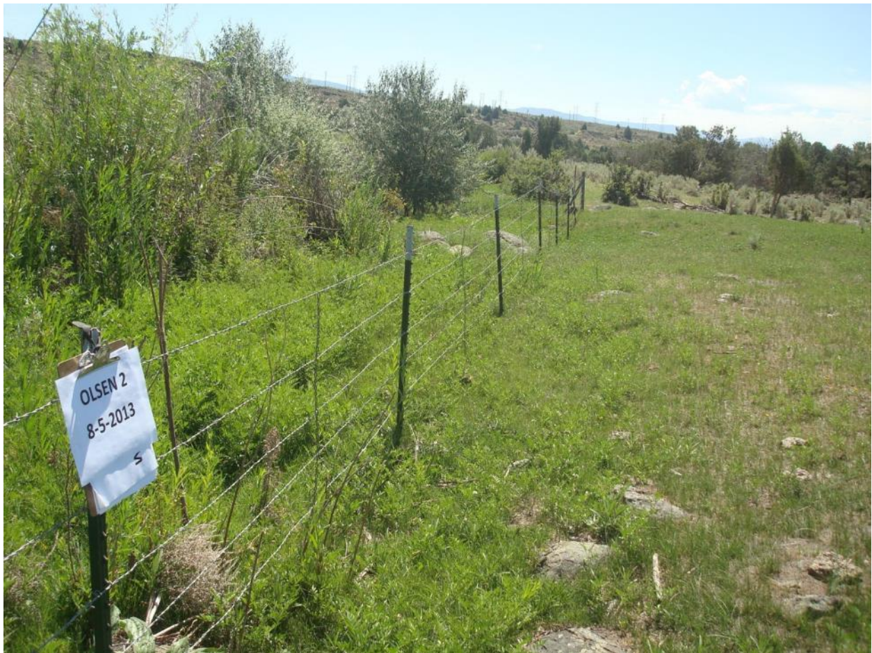
2013 Olsen II

2013 photo looking south through riparian zone.