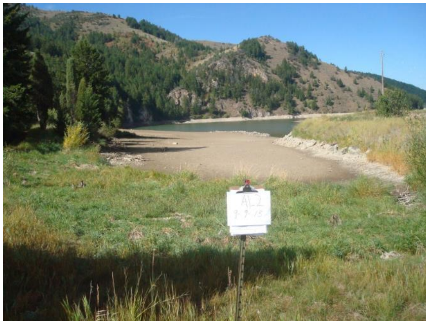
AL 2 – 9 September 2013