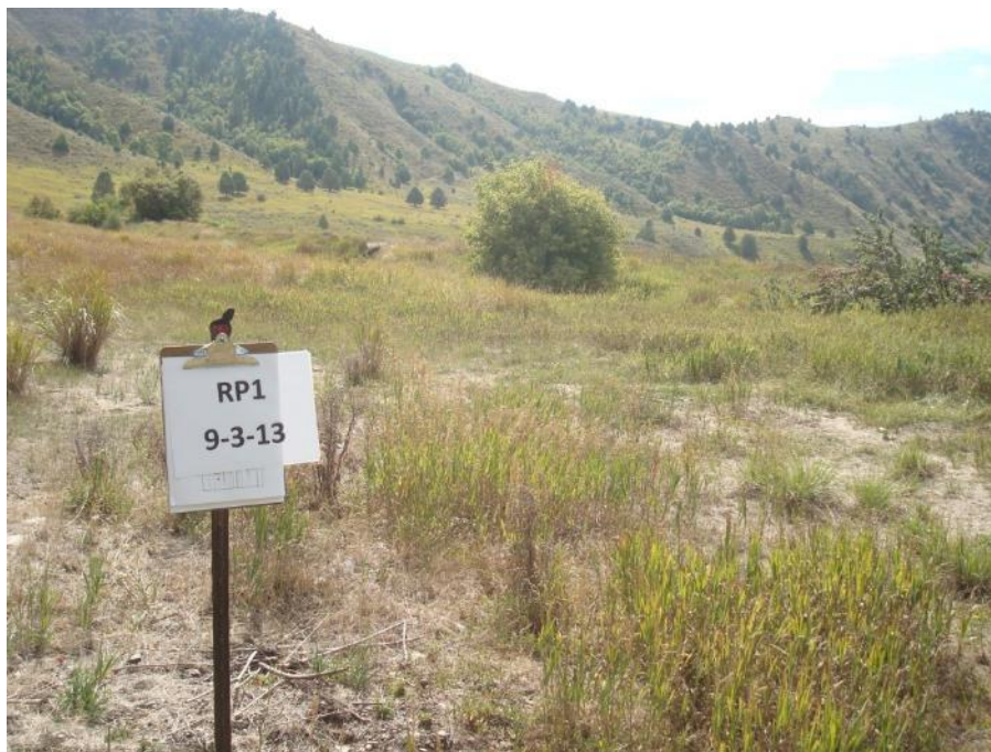
RP1 – 3 September 2013