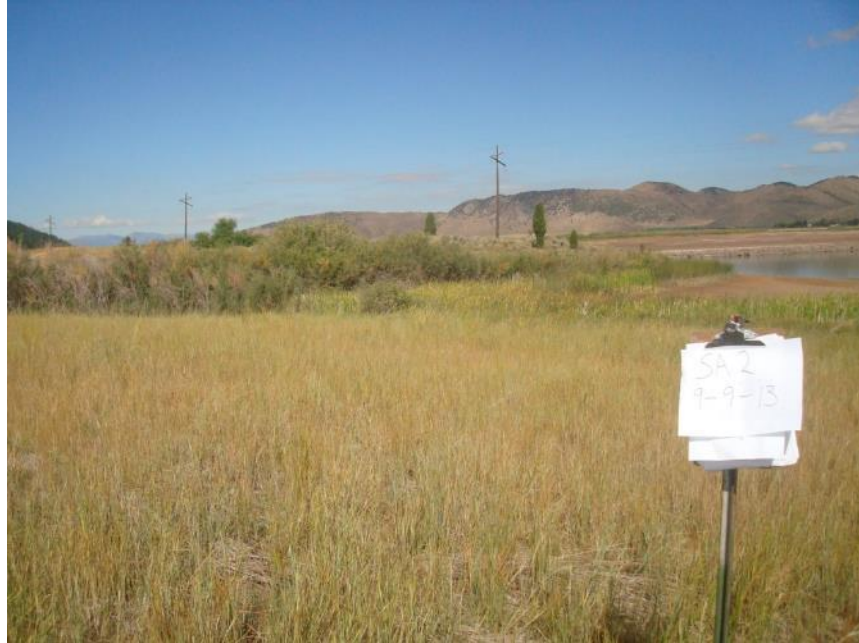
SA 2 – 9 September 2013