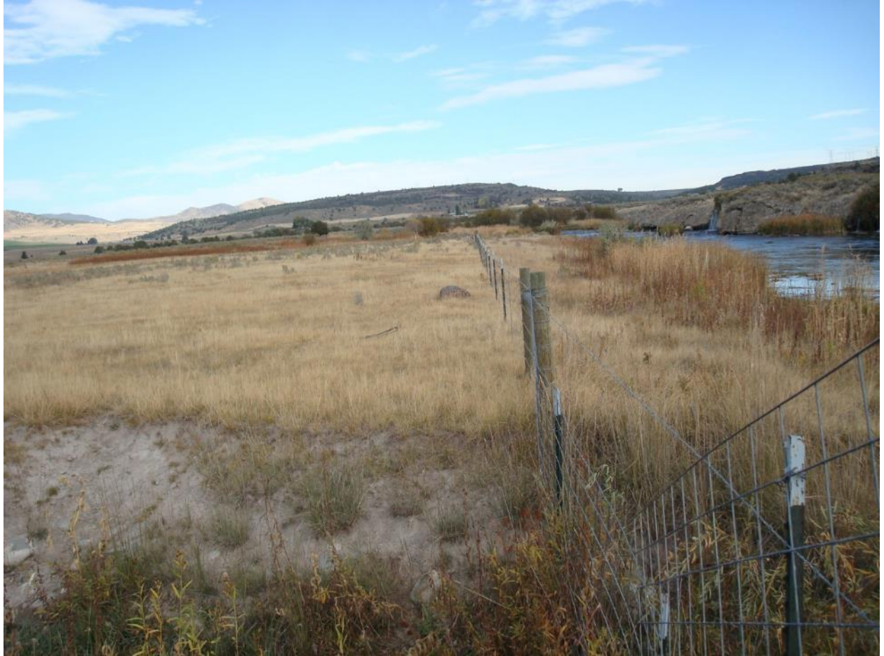
Cove Bypass Fence