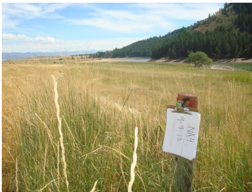
NA 4 – 9 September 2013