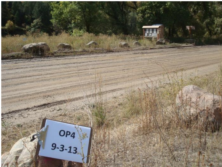
OP4 - 3 September 2013