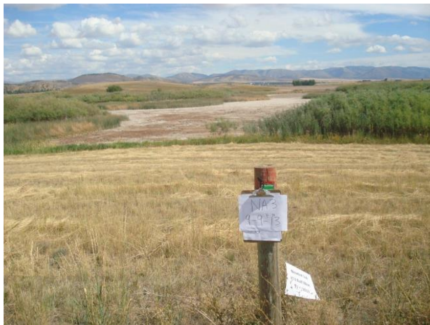
NA 3 – 9 September 2013