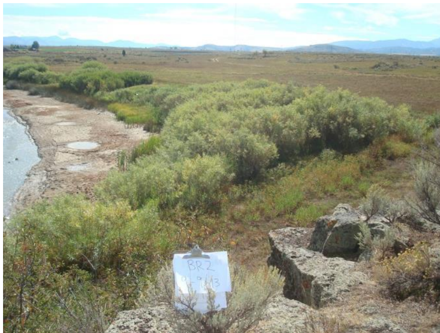
BR 2 – 9 September 2013