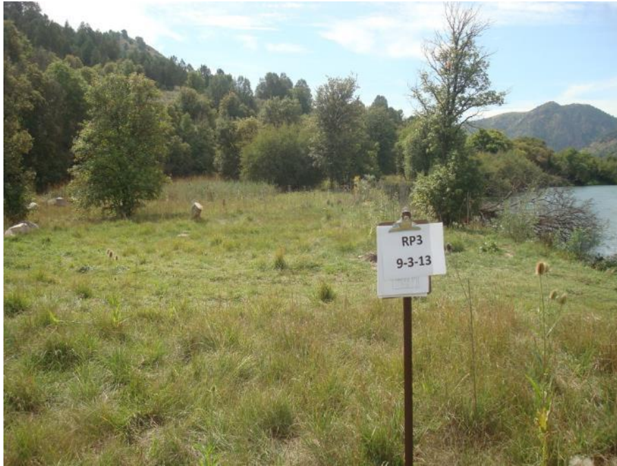
RP 3 -3 September 2013