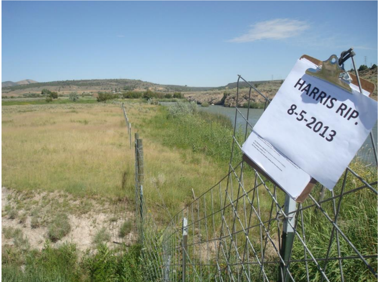
2013 Harris Riparian Section

2013 photo taken looking north along riparian/upland area.