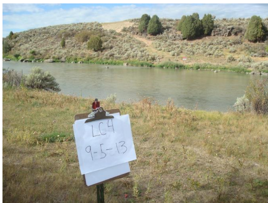
LC 4 –5 September 2013