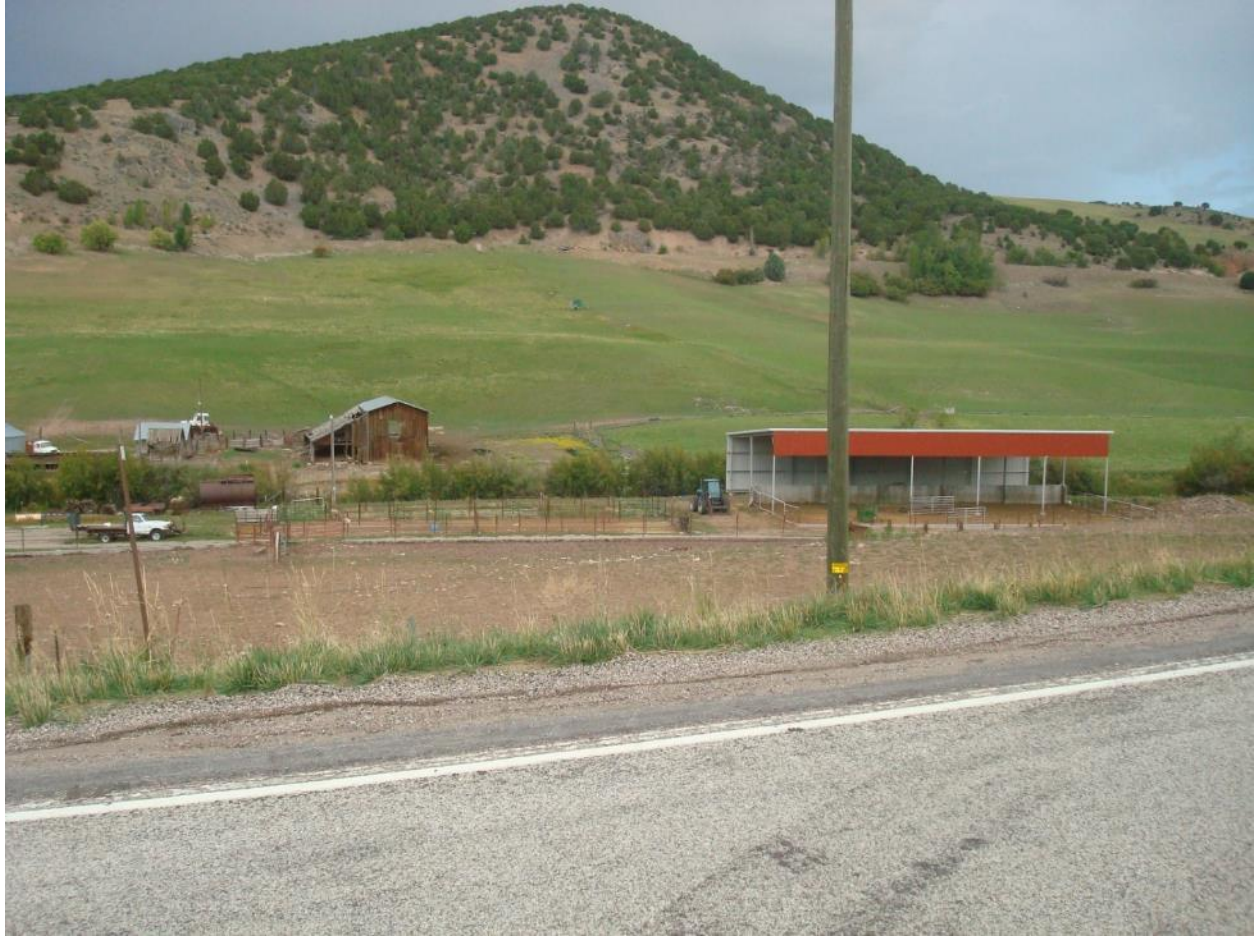
Battle and Mink Creek