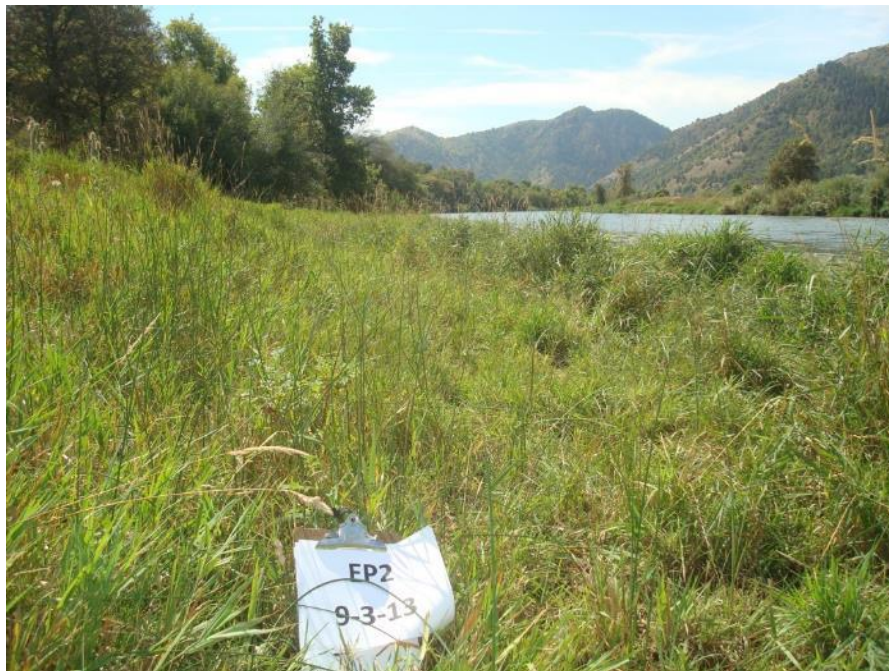
EP2 – 3 September 2013