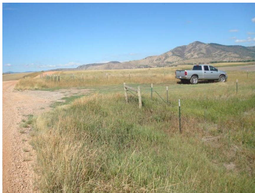
SA 1 – 9 September 2013