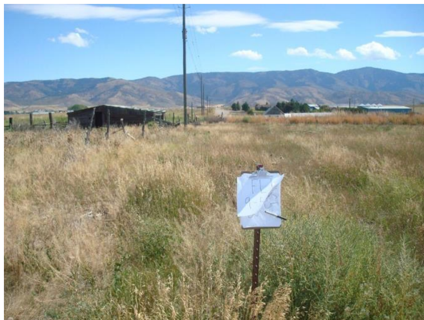
FL 1 – 5 September 2013