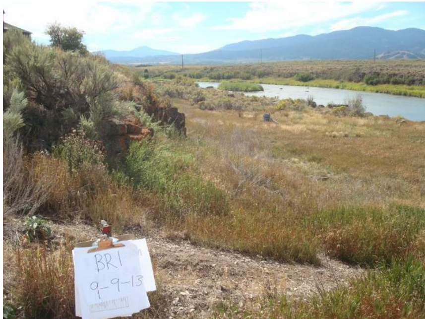
BR 1 – 9 September 2013