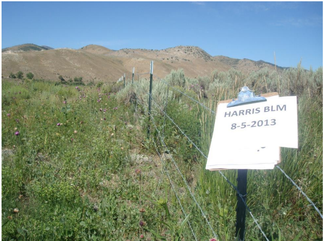
2013 Harris BLM Section

2013 photo taken looking west along BLM property line.