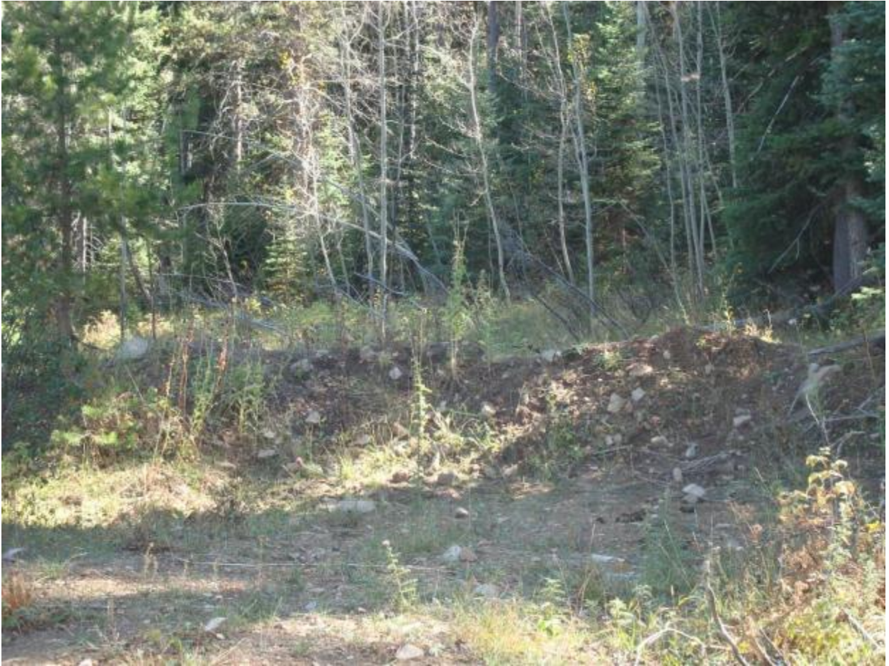
Eightmile Canyon #8