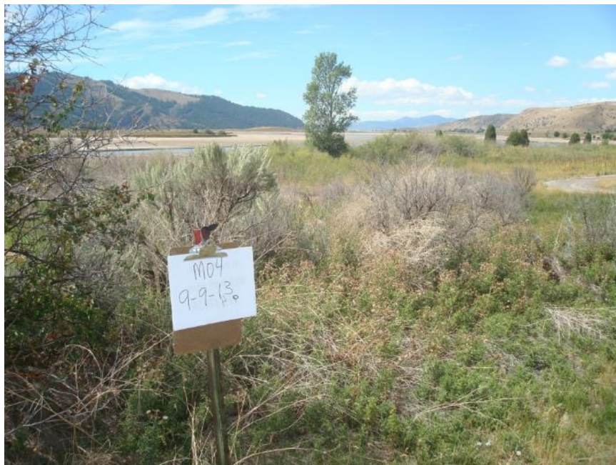
MO 4 – 9 September 2013