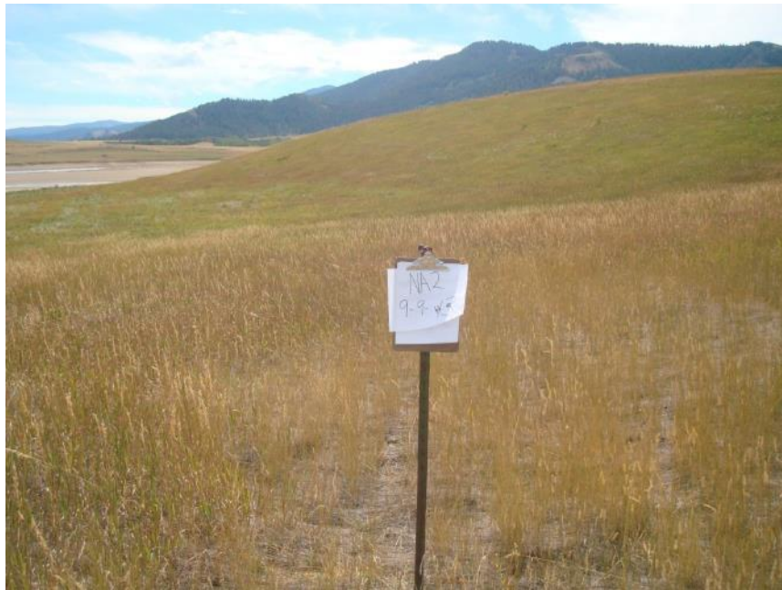
NA 2 –9 September 2013