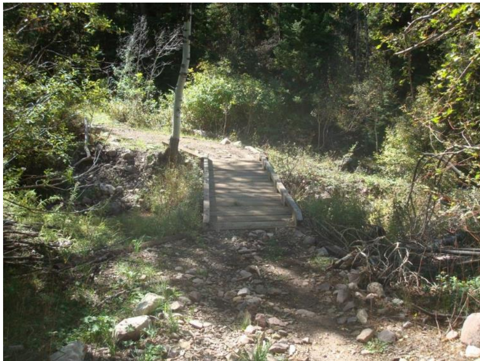
Eightmile Canyon #5 Bridge #2