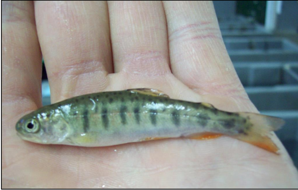
Bonneville cutthroat trout fingerling produced at Idaho Department of Fish and Game's Grace Fish Hatchery. Nearly 20,000 BCT were released during 2013 stocking efforts.

A funding agreement for the disbursement of broodstock funds was drafted by PacifiCorp and IDFG during late 2008. IDFG has chosen to proceed initially with a broodstock program focusing on fish from the Thatcher reach, between Grace Dam and Oneida Reservoir, and will utilize the state's Grace Fish Hatchery near Grace, Idaho to rear broodstock. Disbursement of broodstock development funding for 2008 and 2009 was made upon completion of the funding agreement in early 2009. A final payment was made in 2010. Funding was used by IDFG to improve the spring source and water supply to the hatchery to better protect the broodstock from the potential for disease and cross contamination within the hatchery. A portion of the funds were used to support collected fish at Kent Clegg's spring-fed fish ponds in Grace, Idaho. In addition, IDFG produced 19,000 Bonneville cutthroat trout fingerlings at the Grace Hatchery during 2010. On April 20, 2011, IDFG released the first Bonneville cutthroat trout produced at the hatchery at the site of the Kackley Springs reroute project. IDFG issued a final report of broodstock development activities on January 24, 2012. This license article is complete.