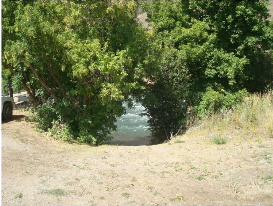
OP 1 – 3 September 2013