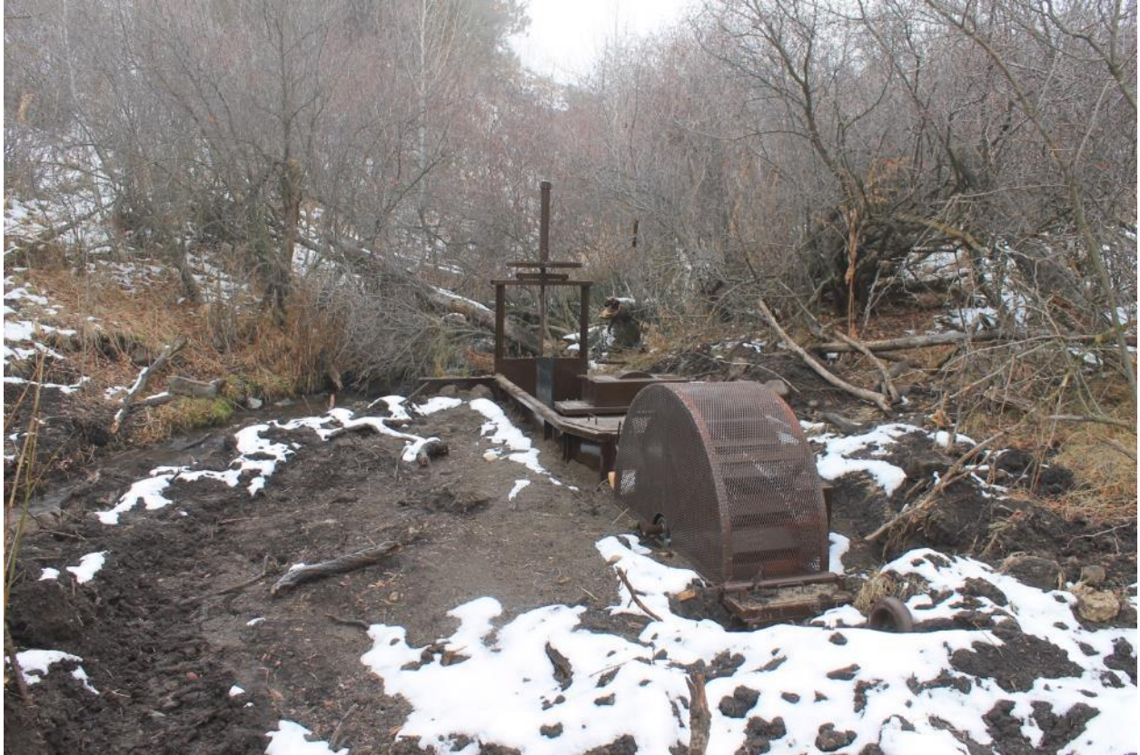
North Hoops Fish Screen