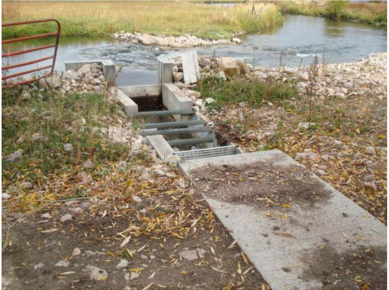
Roy Bunderson Irrigation Structure