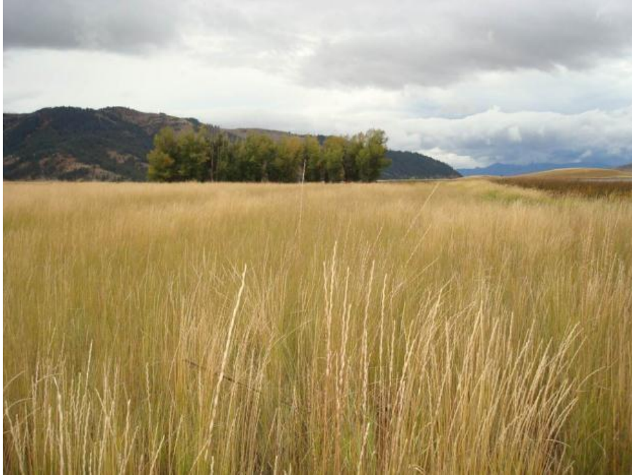
Alexander South Planting Location