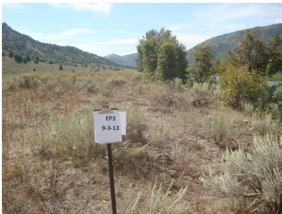
EP3 – 3 September 2013