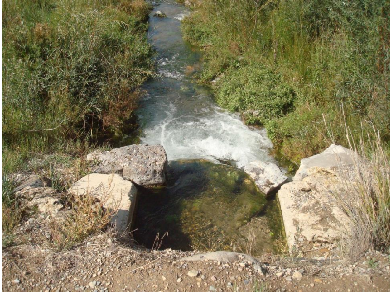
Kackley Springs Reroute