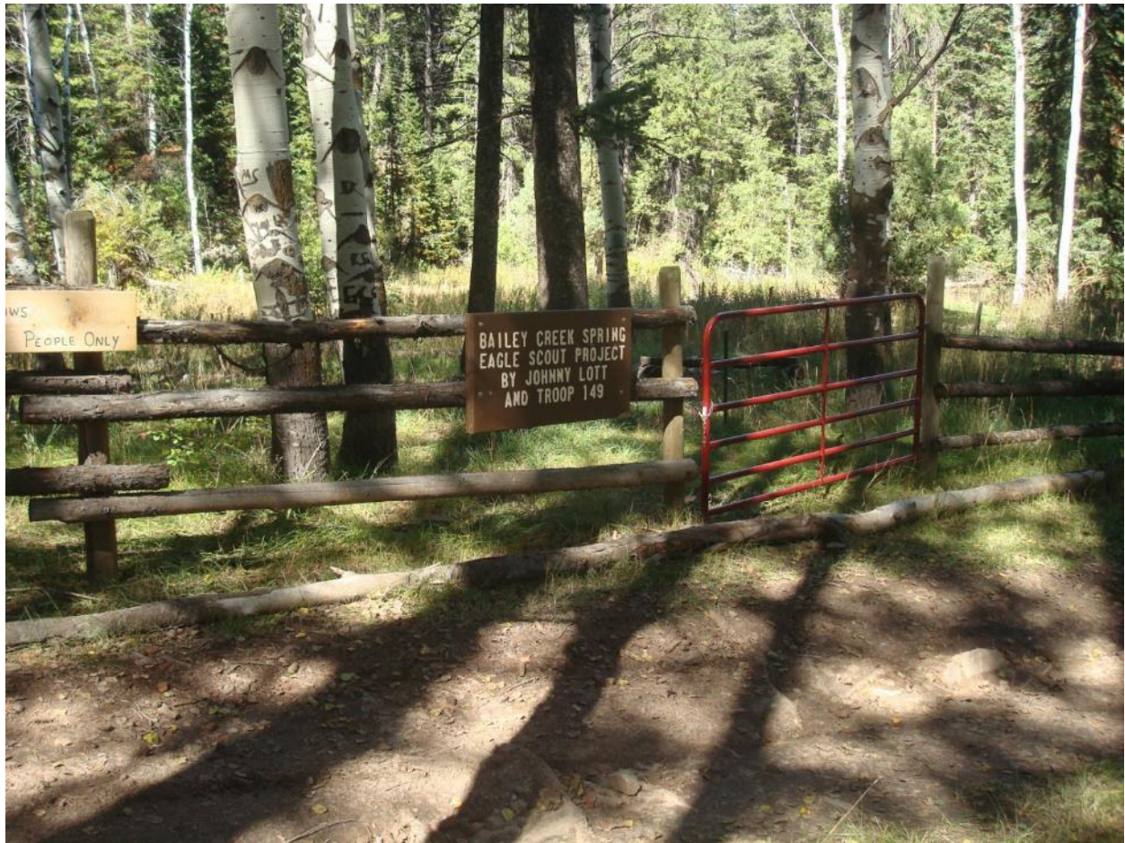
Bailey Creek Fencing