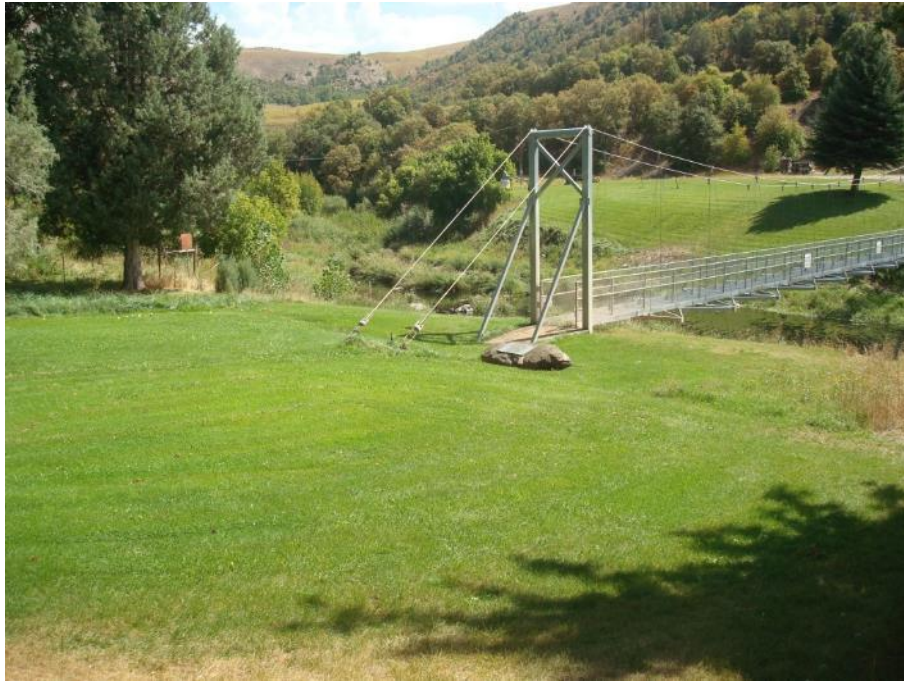
OP3 - 3 September 2013