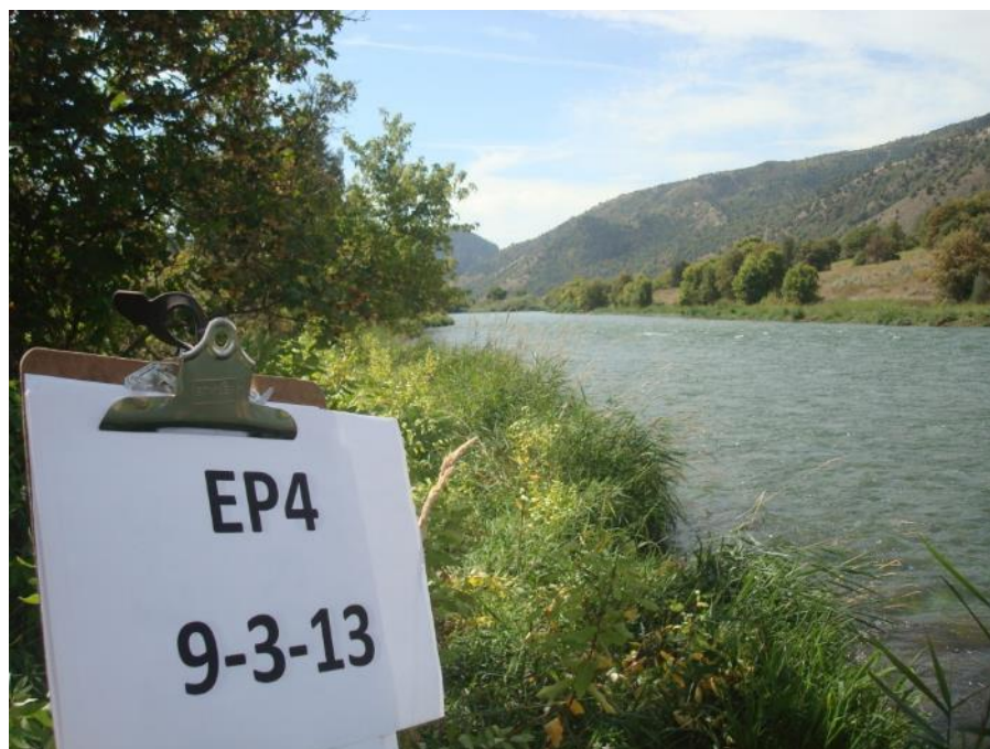
EP4 – 3 September 2013