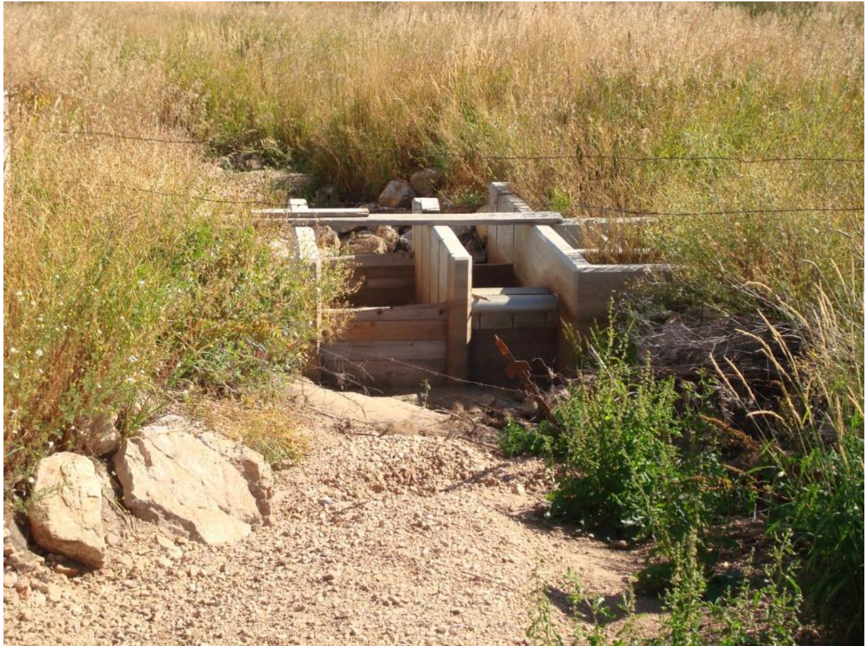
Alleman Lower Diversion Screening