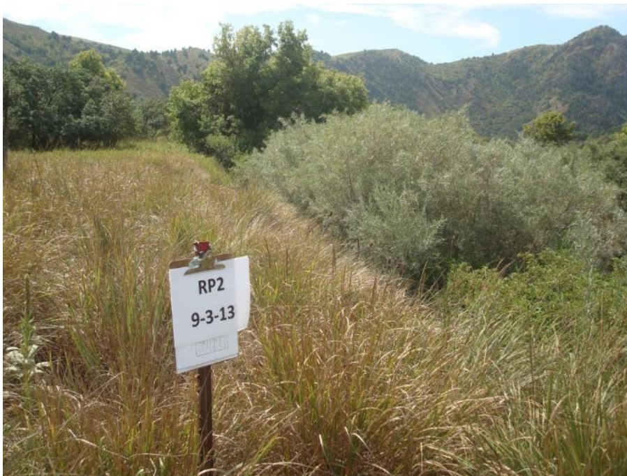
RP2 – 3 September 2013