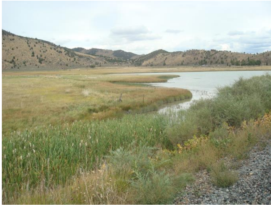
MO 3 – 9 September 2013