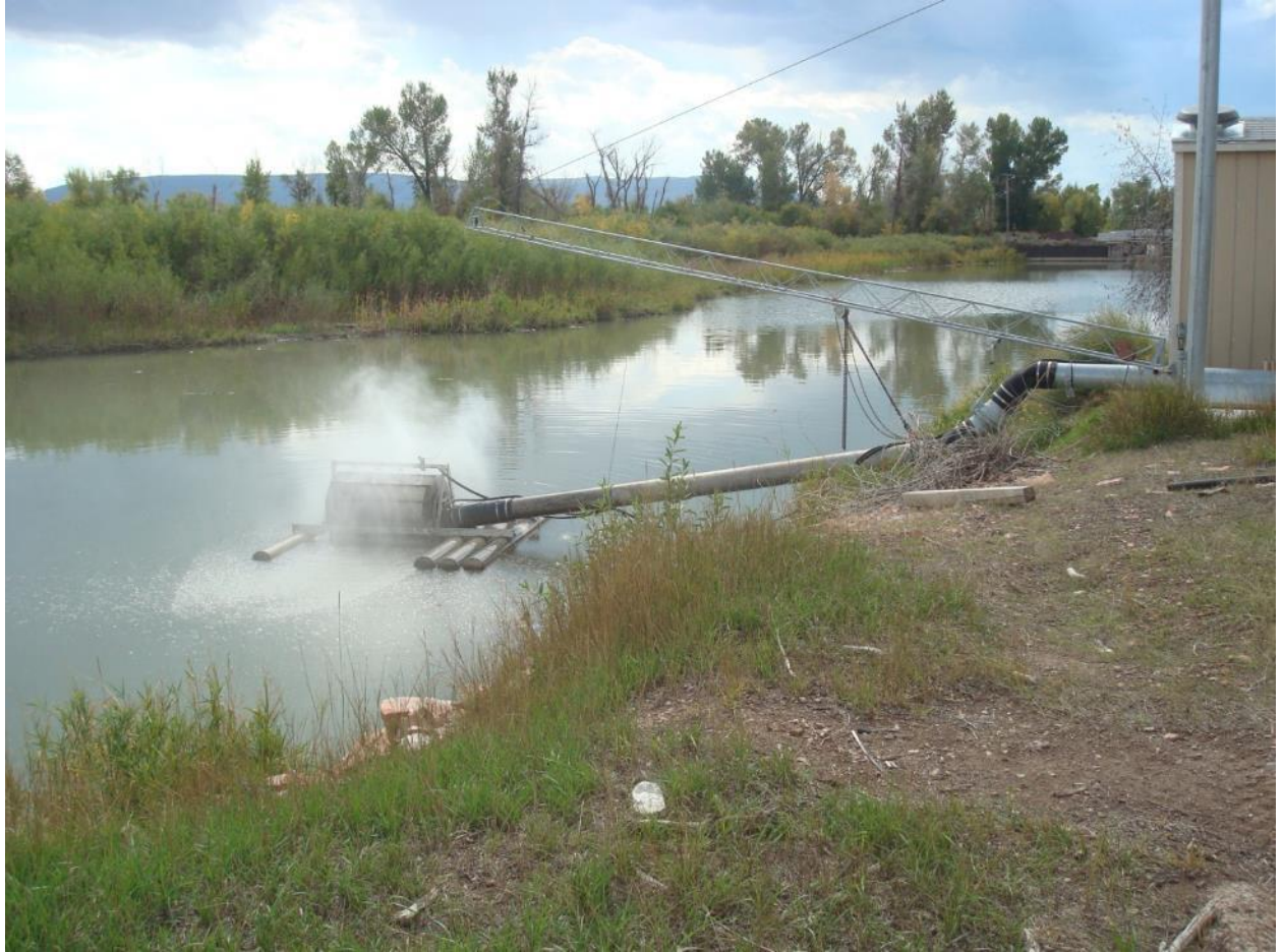
Keetch Fish Screen