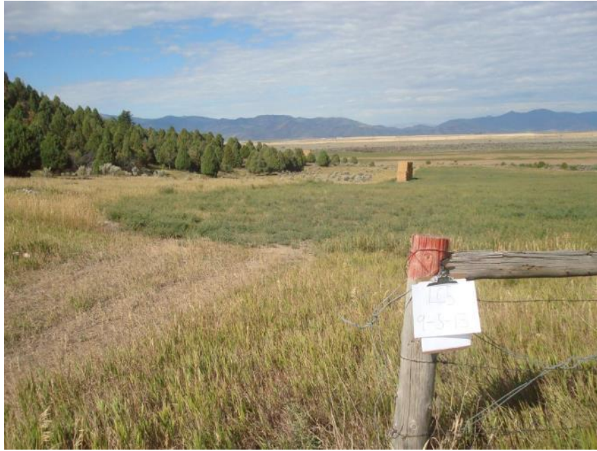
LC 5 – 5 September 2013