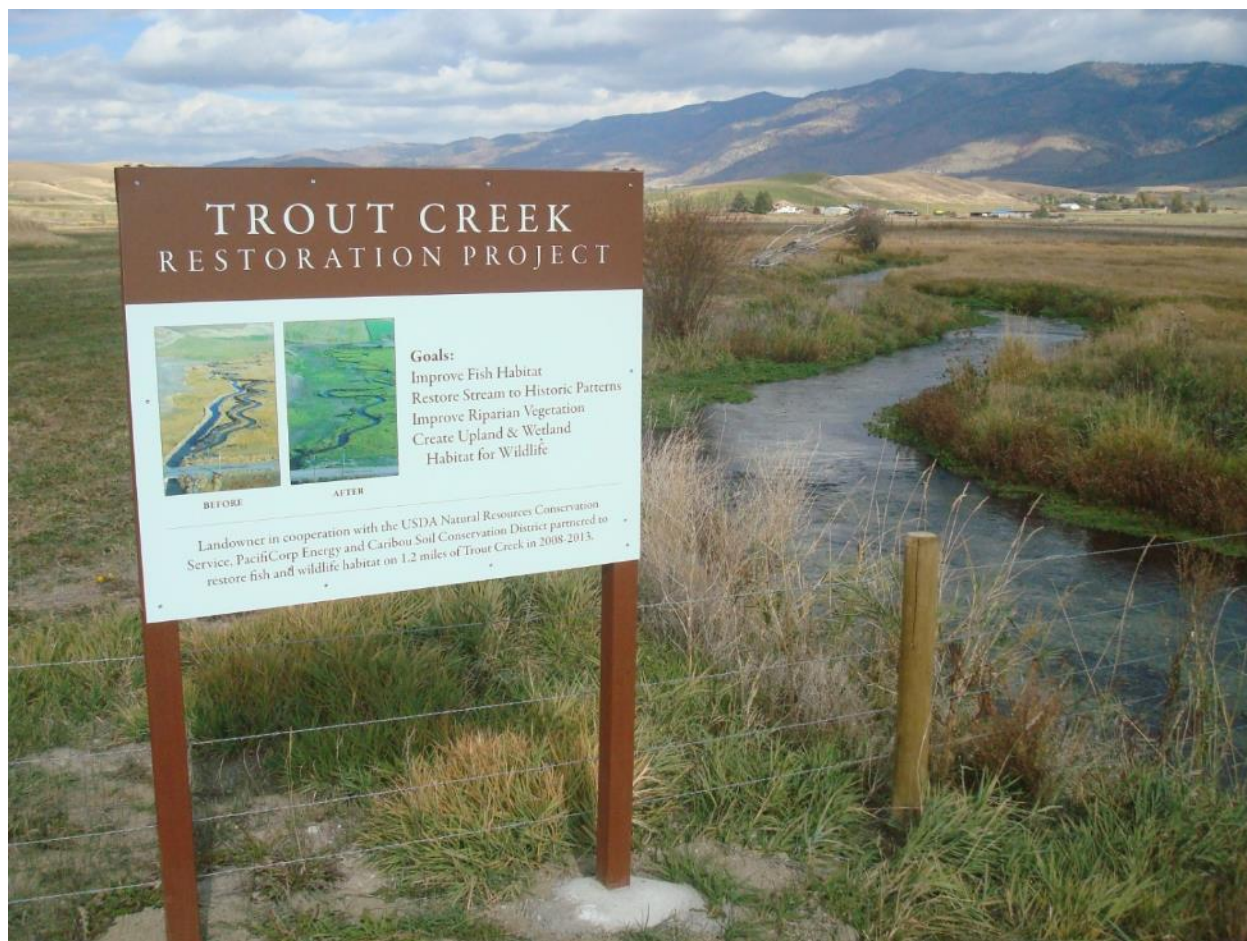
Lower Trout Creek