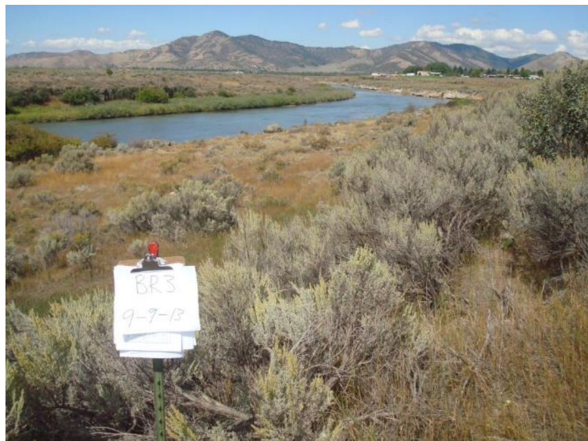
BR 3 – 9 September 2013