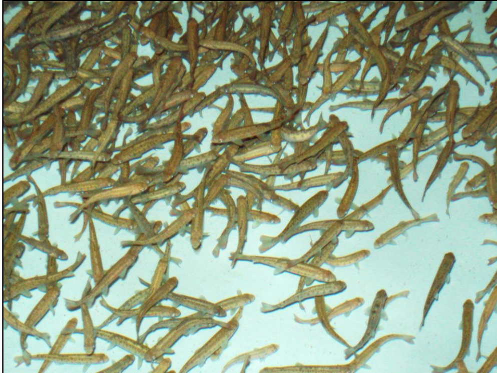
Bonneville cutthroat trout produced at IDFG's Grace Fish Hatchery during 2013.

final report of broodstock development activities on January 24, 2012 and the first conservation hatchery payment was made. IDFG produced and released 19,544 Bonneville cutthroat trout during 2013. Six-inch fish were released in spring; 10-inch fish were released in fall. Approximately 27,874 were produced for release in 2014. IDFG will continue to produce Bonneville cutthroat trout at the Grace Fish Hatchery. Hatchery payments of $100,000 will be made available each year through the end of the license term for implementation of this article, or acceptable alternative use.