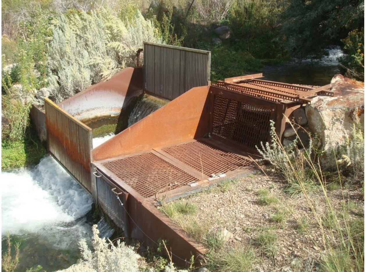
Kackley Springs Fish Trap