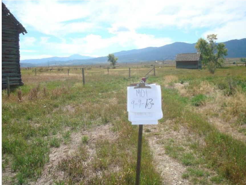
MO 1 – 9 September 2013