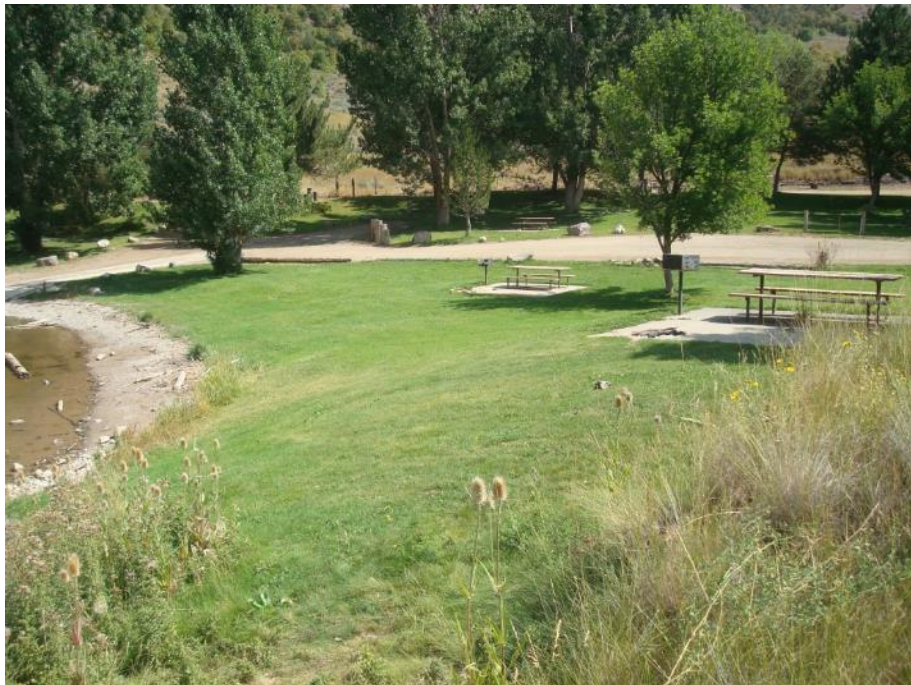
Oneida Plant Parcel