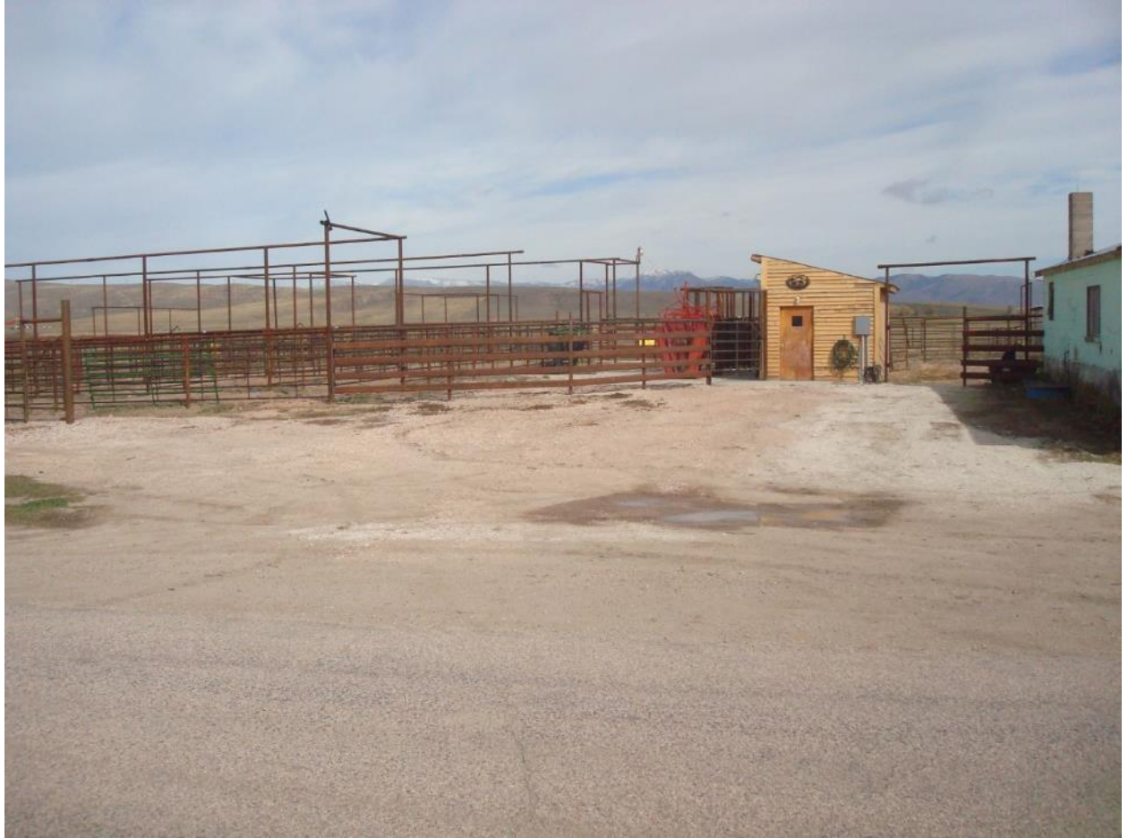
Ovid Corral Relocation