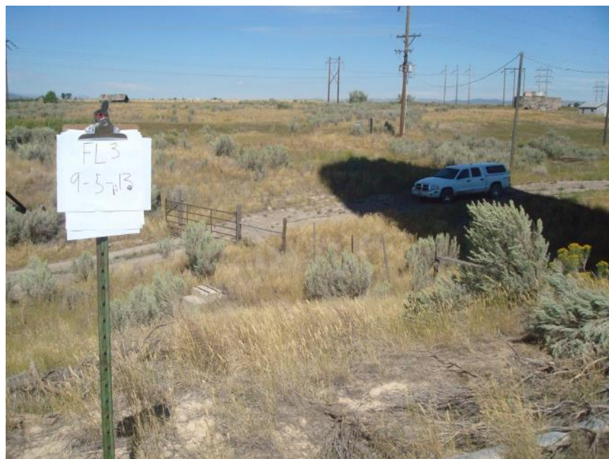
FL 3 – 5 September 2013