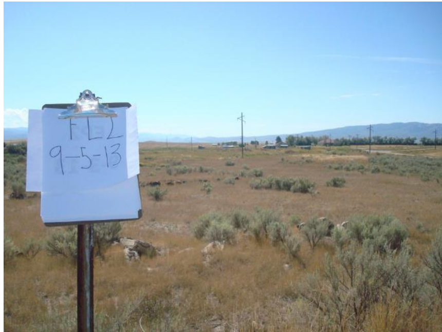
FL 2 – 5 September 2013