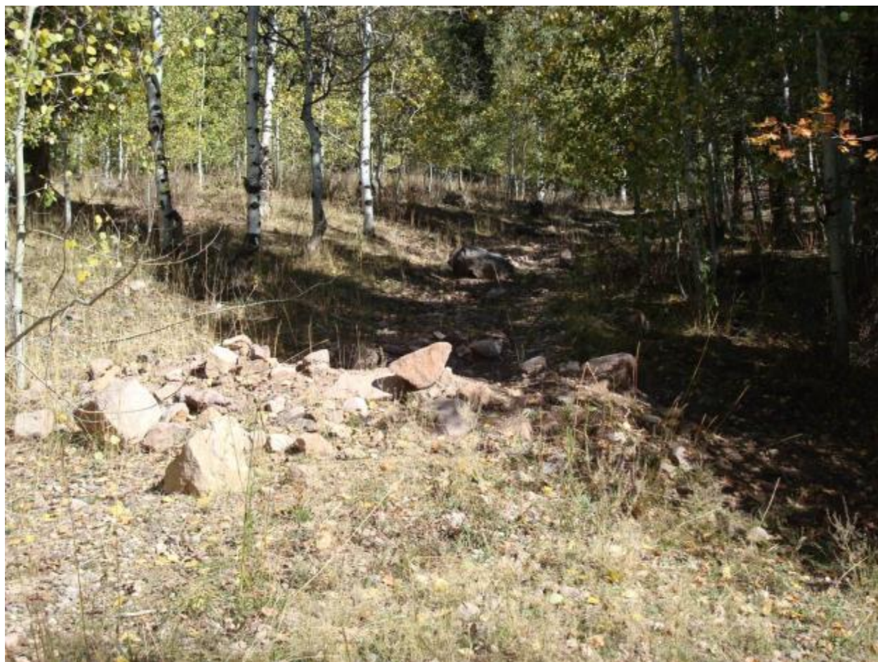
Eightmile Canyon #4