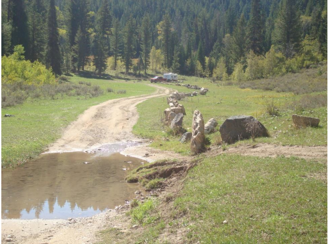
Eightmile Canyon #10