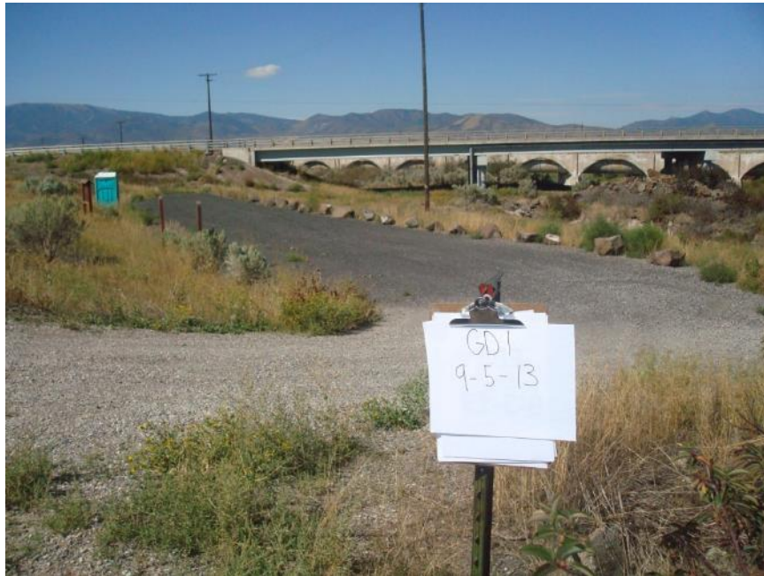
GD 1 – 5 September 2013