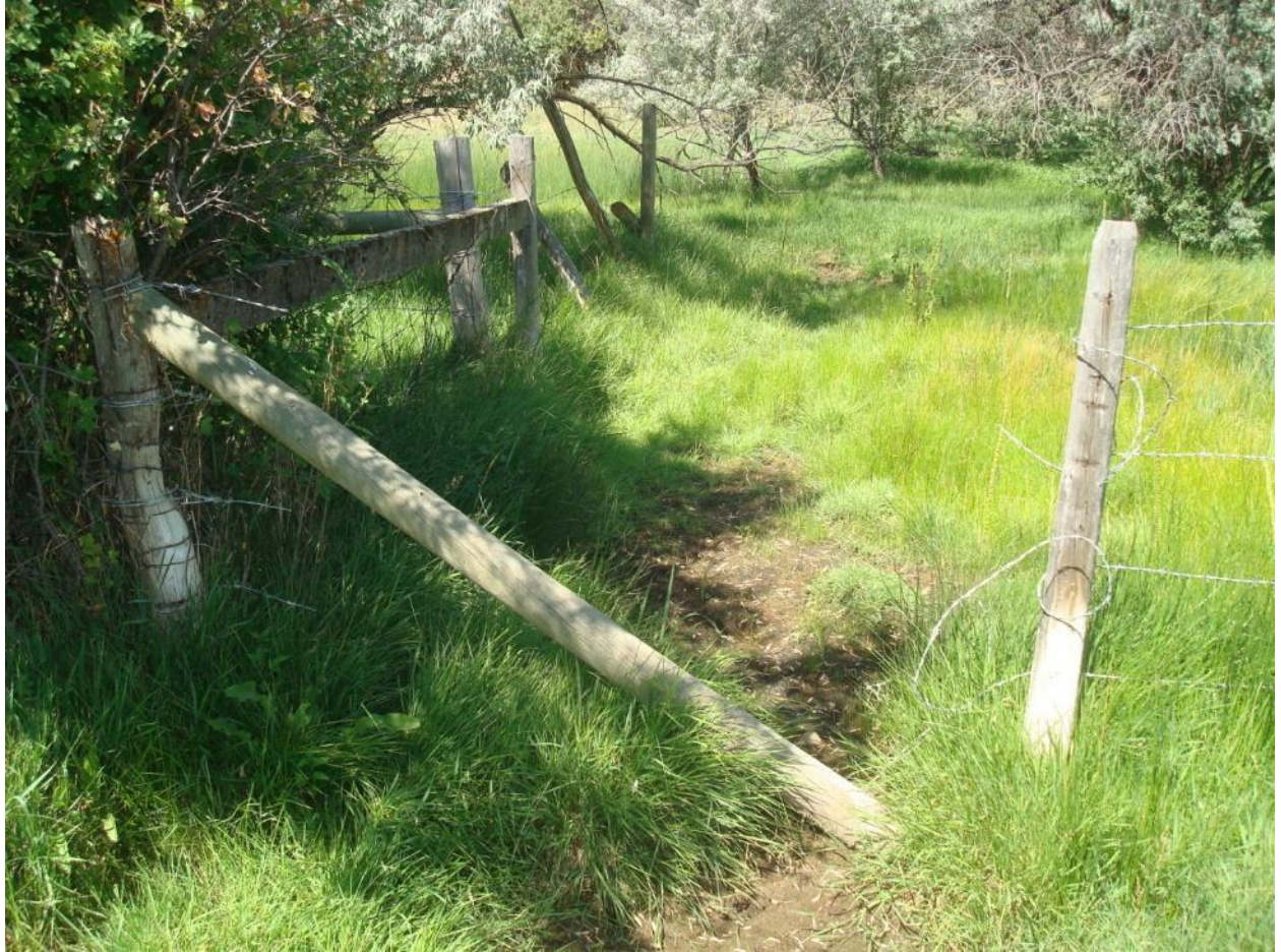
Fence cut on south end of McCurdy I