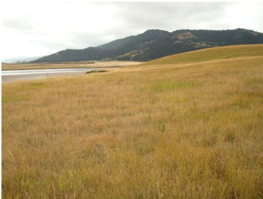
Alexander North Planting Location