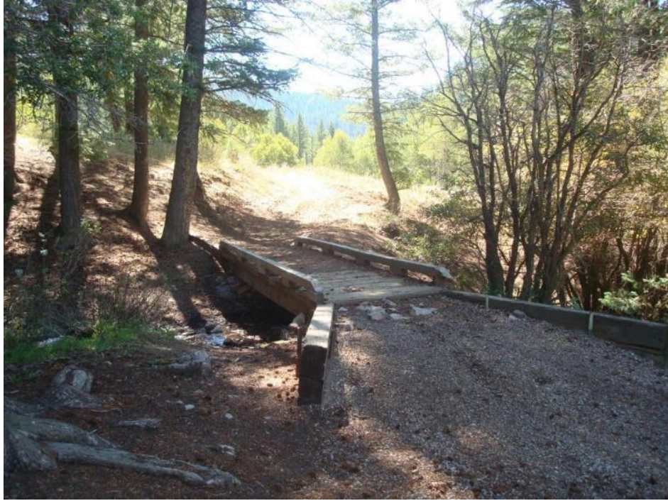
Eightmile Canyon #5 Bridge #1