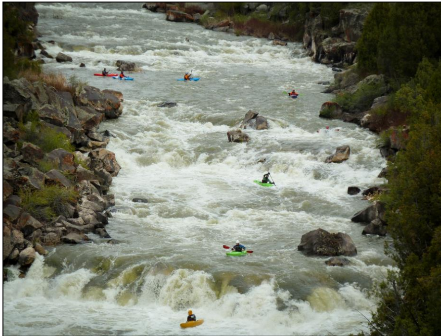
Kayakers descend the Black Canyon of the Bear River during whitewater boater flows.

During fall of 2011, a series of three ECC work sessions were held to discuss study results that included the six-year monitoring report, the fish stranding report, water quality, and the timing and schedule of future boater flows. A report of these discussions was submitted to the FERC on January 31, 2012. This report included the Draft Agreement for Boater Flows: Extended Study Period & Adaptive Management and a commitment to follow up with FERC 45 days after the agreement was finalized. According to the terms of the draft agreement, during the extended study period (2012 – 2014), four weekends of scheduled boater flows will be released between April 1 and June 5; a down ramp rate of 1 foot per hour will be used; and the Article 409 Fish Stranding Minimization Plan will remain suspended. Final ECC approval of the agreement and associated study plans to be implemented by IDFG and IDEQ for monitoring of water quality and fisheries during the extended study period was granted April 18, 2012 and the agreement was implemented during the 2012 whitewater boater flow season.