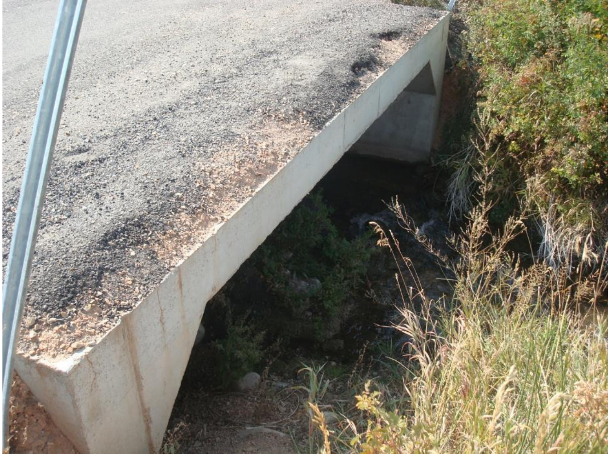
Bailey Creek Culvert