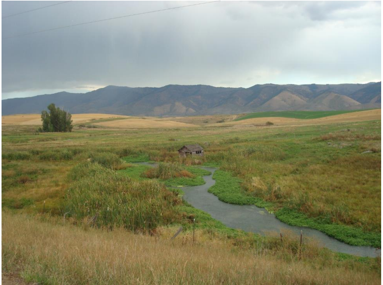
Whiskey Creek Habitat Restoration