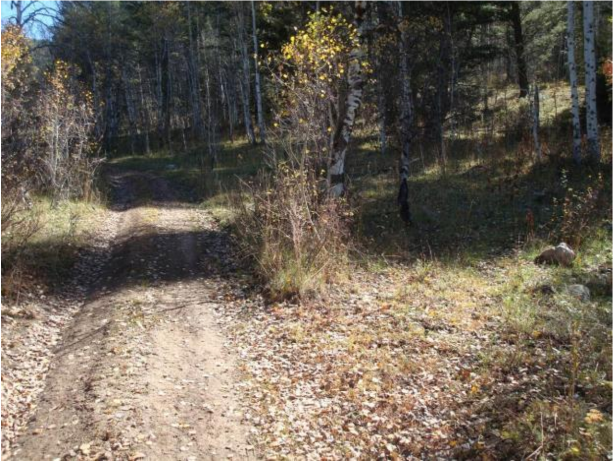
Eightmile Canyon #1