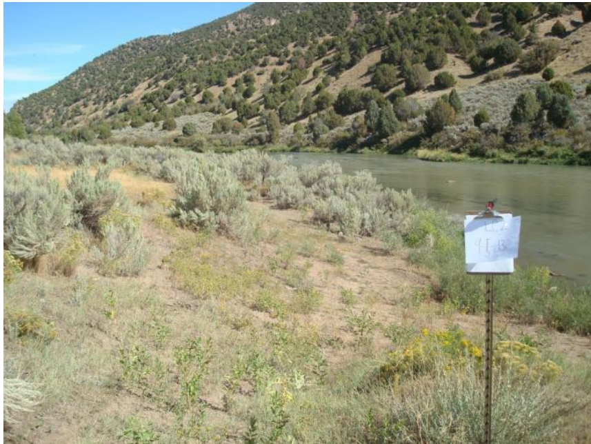
LC 2 – 5 September 2013