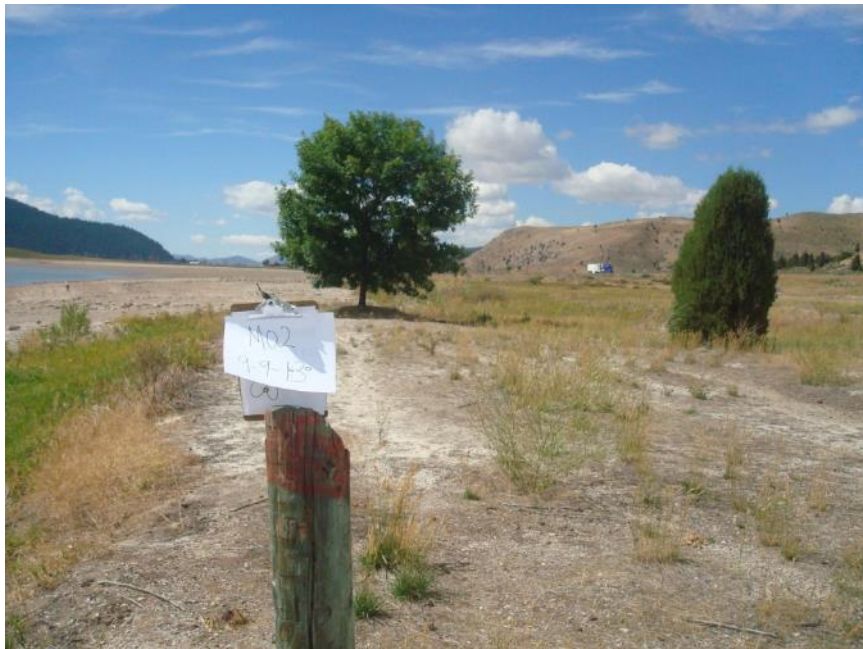
MO 2 – 9 September 2013