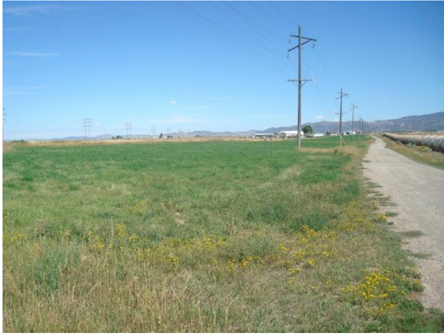
FL 4 – 5 September 2013