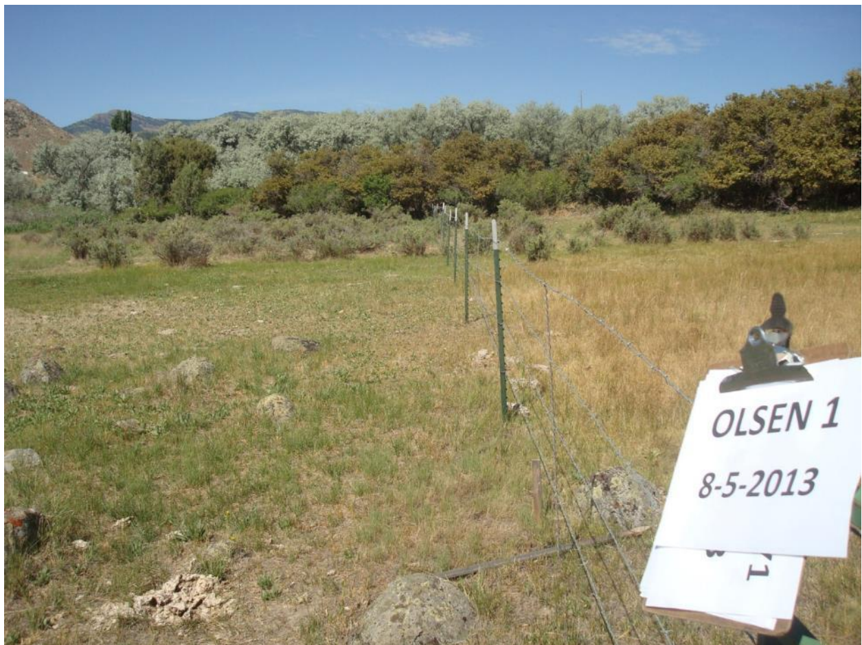
Olsen I 2013

2013 photo taken looking west from fence corner.