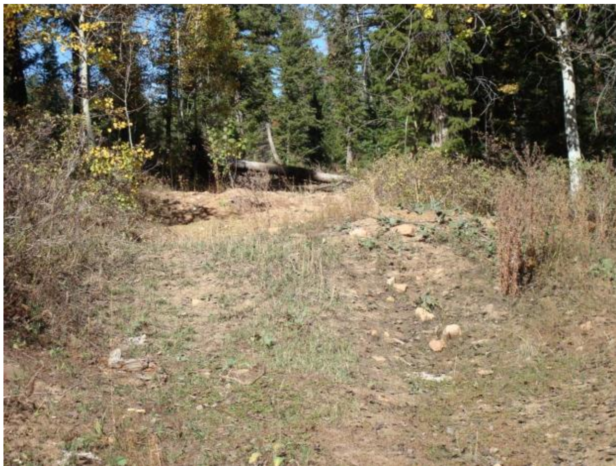
Eightmile Canyon #6