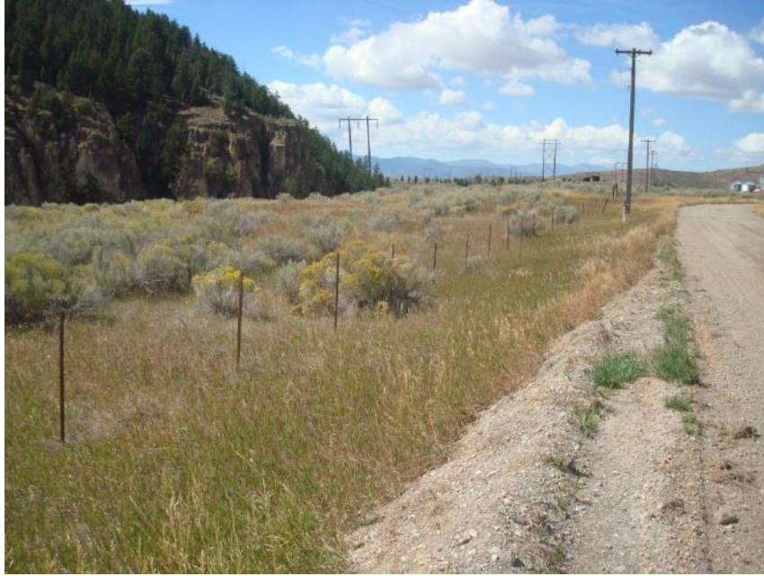
NA 1 – 9 September 2013