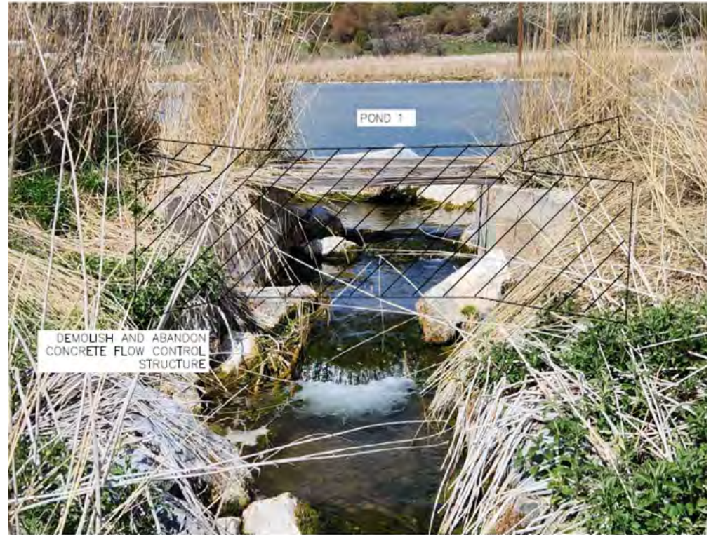
POND 1 LOWER CONTROL STRUCTURE