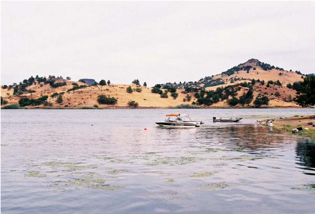
IG5: IRON GATE RESERVOIR FROM MIRROR COVE RECREATION AREA—LOW POOL CONDITIONS