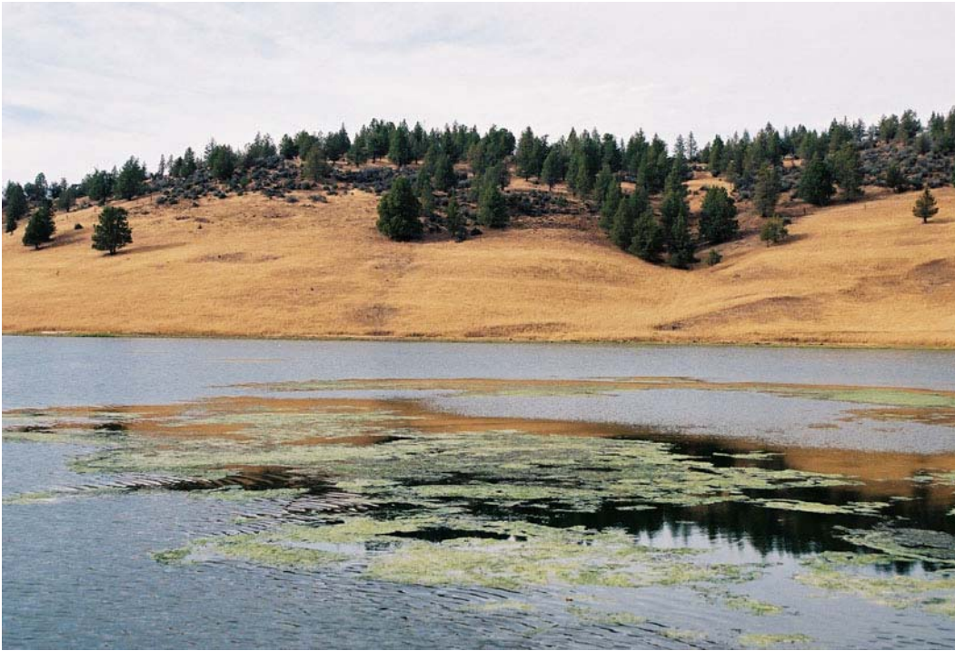
IG7: IRON GATE RESERVOIR FROM LONG GULCH RECREATION AREA—LOW POOL CONDITIONS