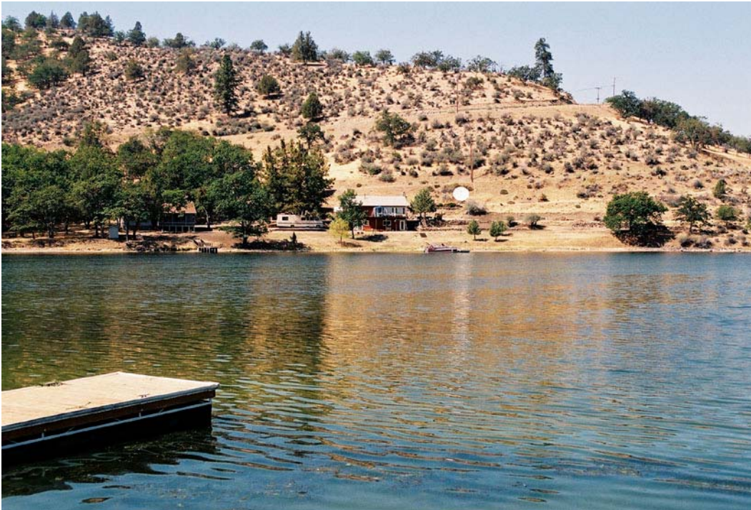
C1: COPCO LAKE FROM MALLARD COVE RECREATION AREA—LOW POOL CONDITIONS