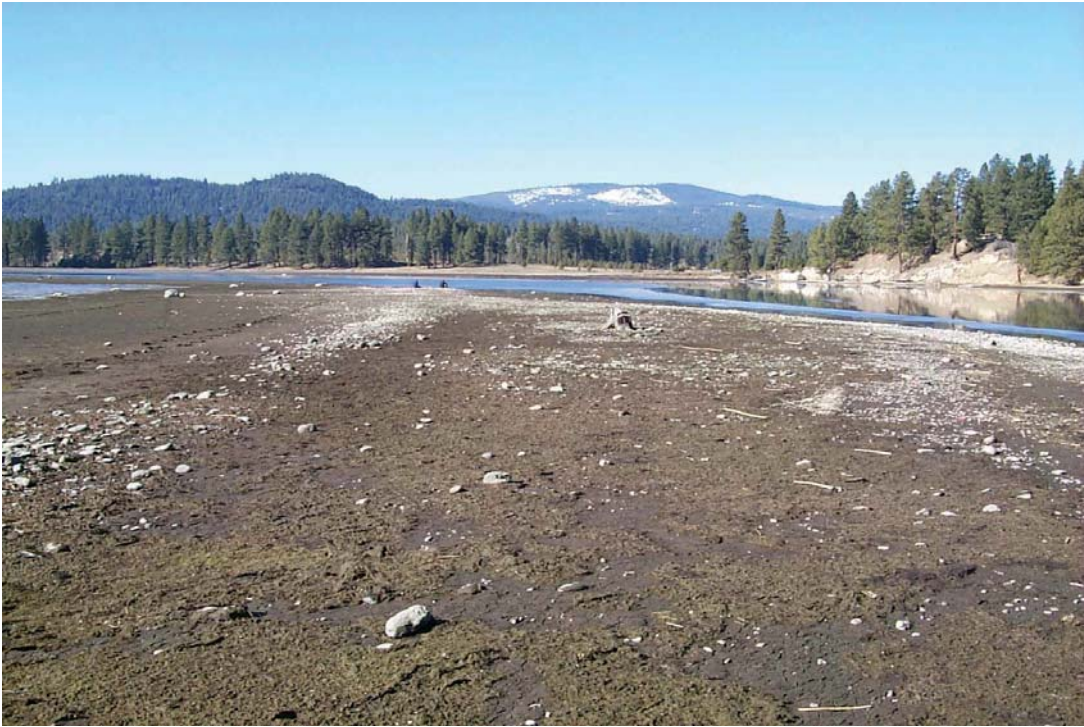
J.C. BOYLE AT MAINTENANCE DRAWDOWN CONDITIONS (VIEW 2)