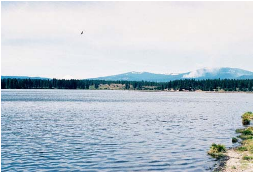
K5: J.C. BOYLE RESERVOIR FROM PIONEER PARK EAST—LOW POOL CONDITIONS