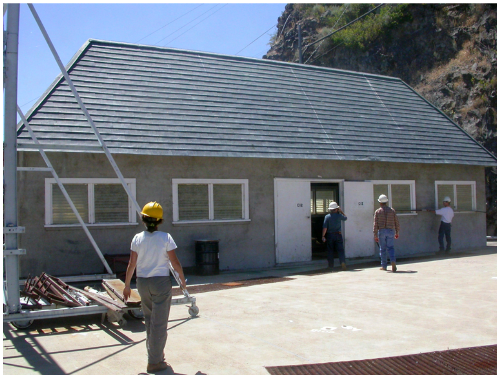
View: COPCO #1 Gatehouse #2, July 2003