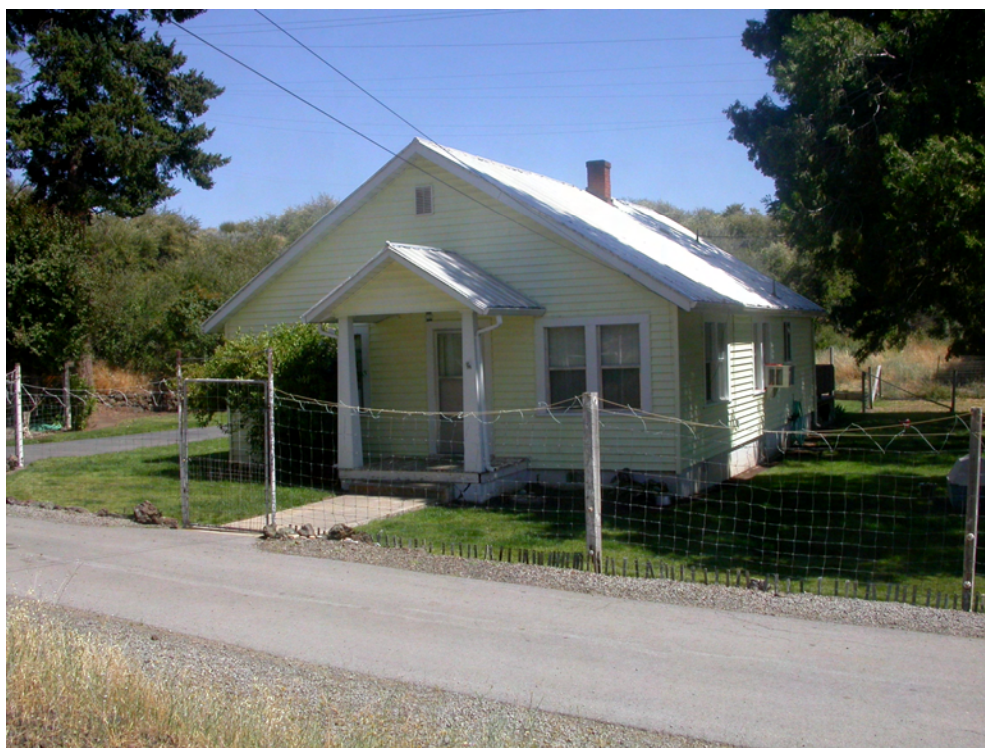
View: COPCO #1 Bungalow #1, front elevation, July 2003