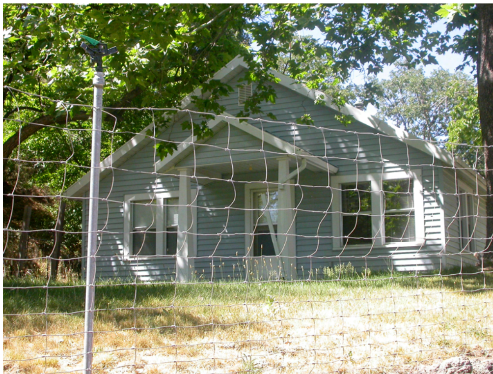
View: COPCO #1 Bungalow #2, 21600 Copco Road – front elevation – July 2003