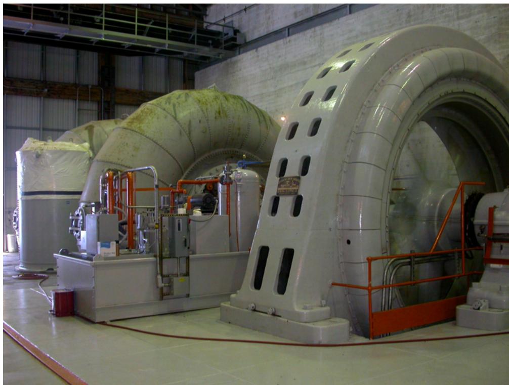
View: COPCO #1 Powerhouse Interior – Turbine/Generator System – July 2003