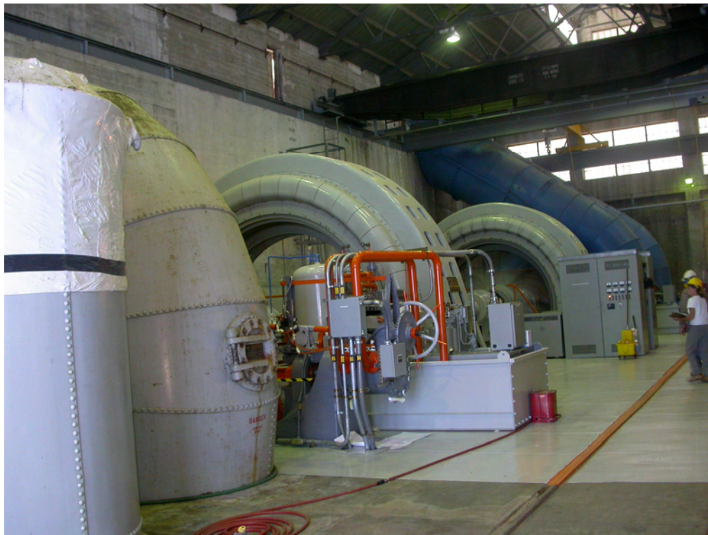
View: COPCO #1 Powerhouse Interior, showing turbine/generators, looking toward penstocks, July 2003