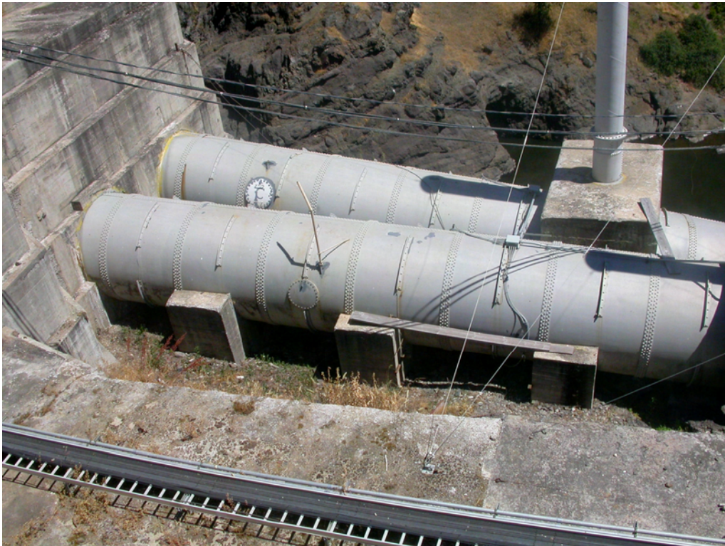
View: COPCO #1 Penstocks exiting gatehouse, July 2003