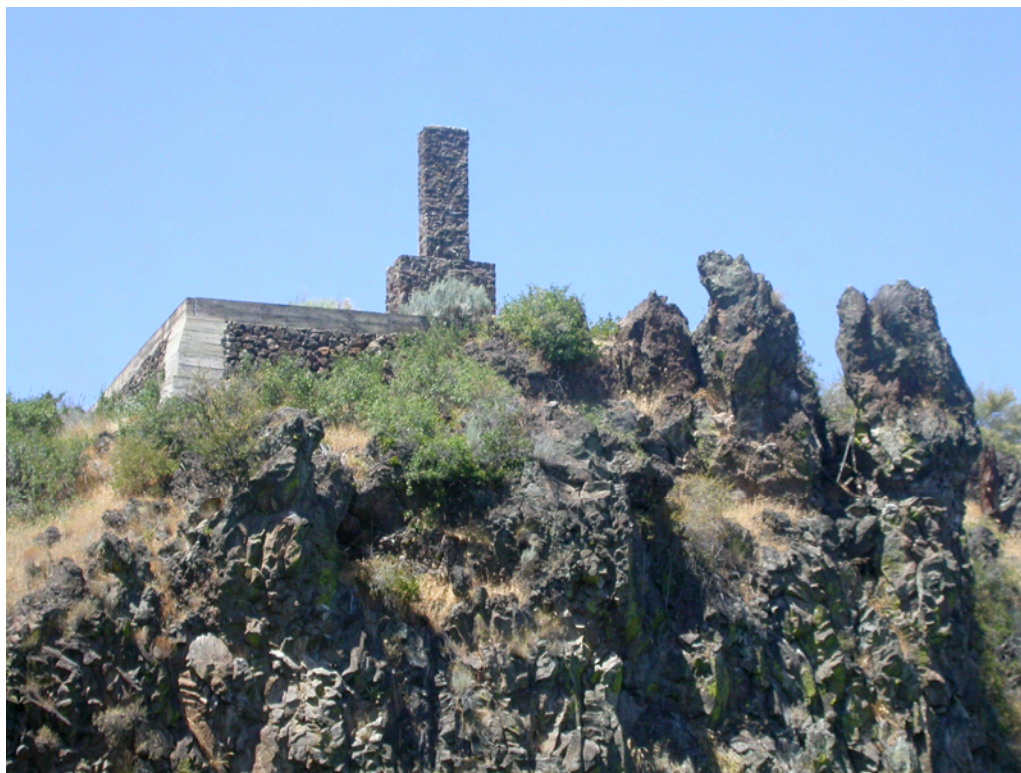
View: COPCO #1 Ruins/remains of Guest House above dam, July 2003