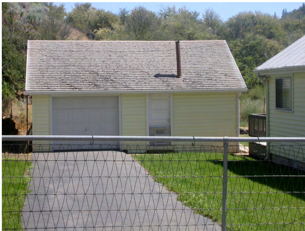
View: COPCO #1 Bungalow #1 garage, July 2003