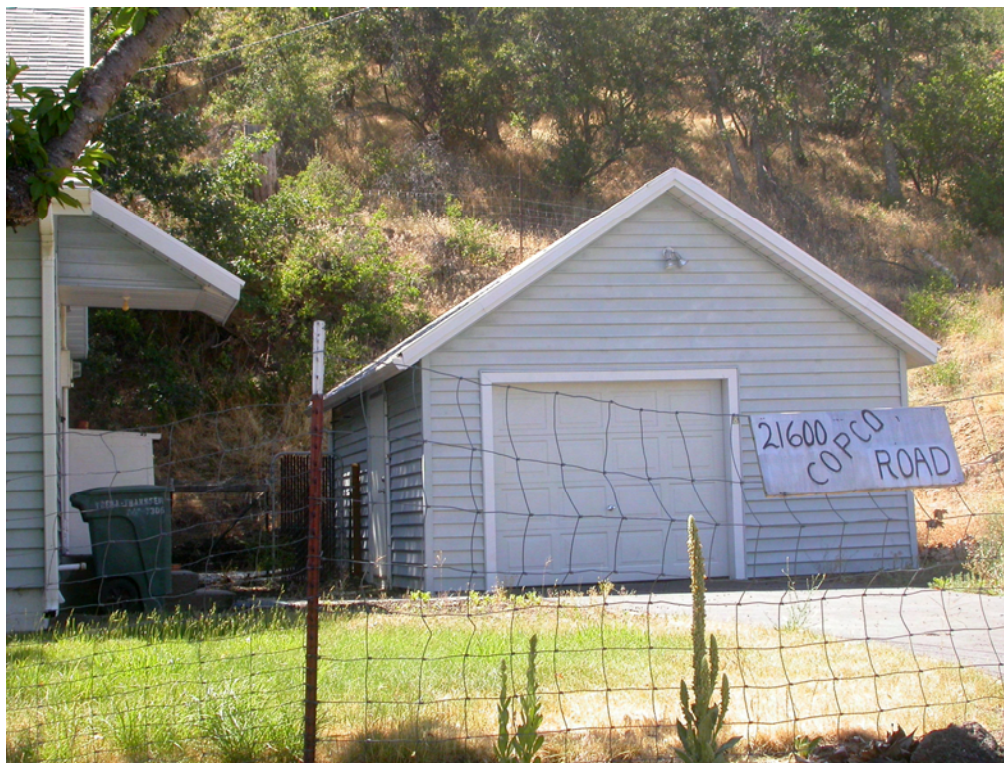
View: COPCO #1, Bungalow #2, 21600 Copco Road – garage – July 2003