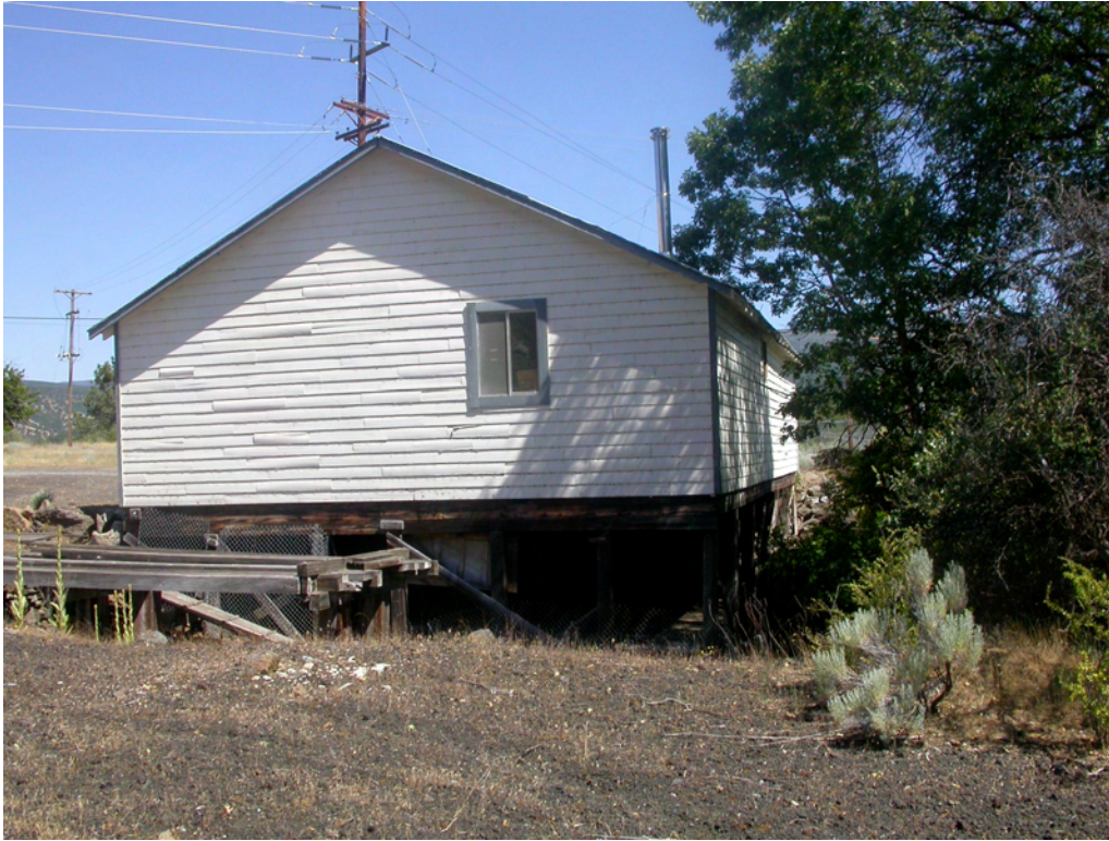
View: COPCO #1 – Garage/Warehouse support structure – side elevation facing road. Note separate platform structure at far left. July 2003