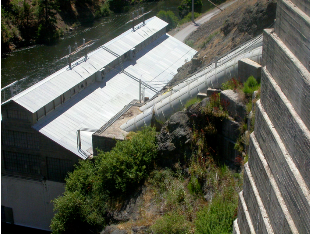
View: COPCO #1 Penstocks entering powerhouse – note poured concrete of dam at right – July 2003