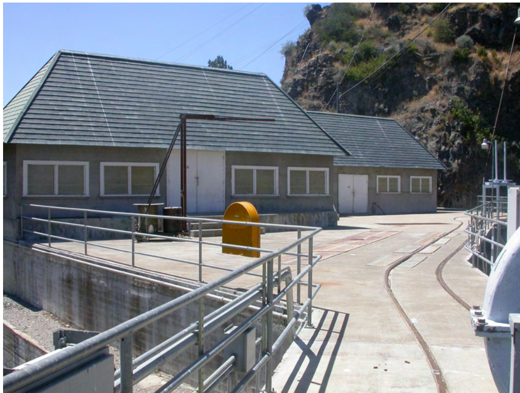
View: COPCO #1 Dam – Gatehouses, July 2003