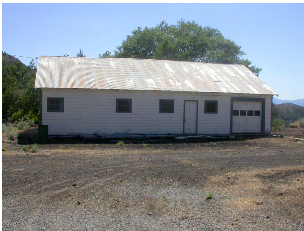
View: COPCO #1 – Garage/warehouse support structure – front elevation facing parking lot – July 2003