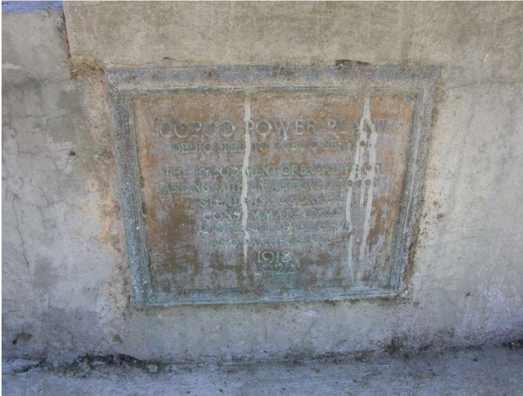
View: COPCO #1 Gatehouse #1 Dedication Plaque, July 2003