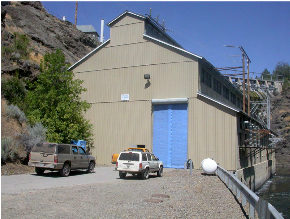
View: COPCO #1, Powerhouse, front (southwest) façade, July 2003