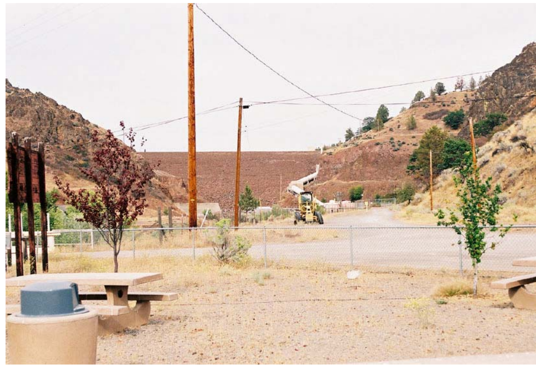
IG10: IRON GATE FISH HATCHERY AND FISH LADDER