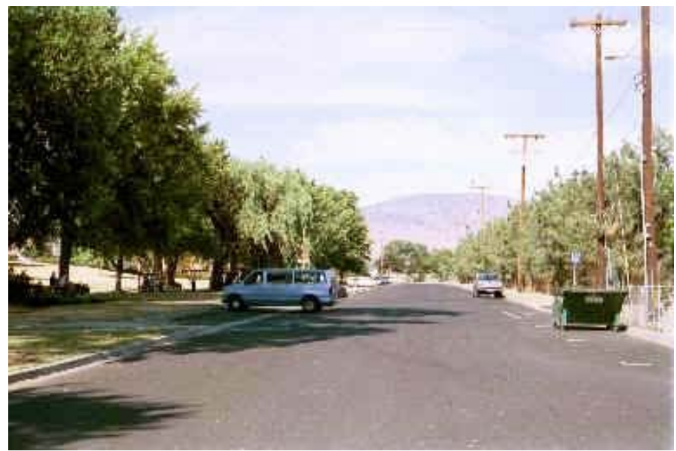
Veteran's Memorial Park Parking Area