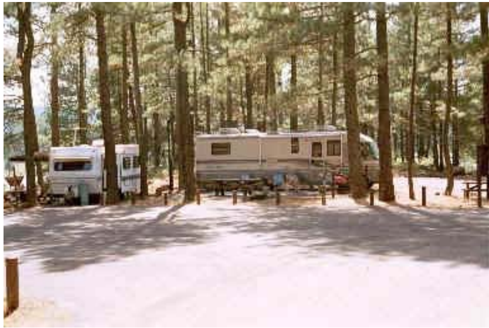
Topsy Recreation Area (BLM)