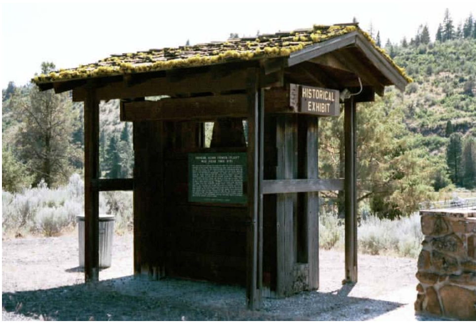
Keno Recreation Area—Interpretive Sign