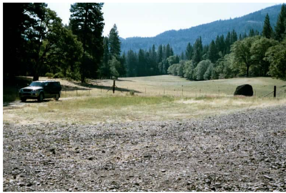
Fishing Access Site 1