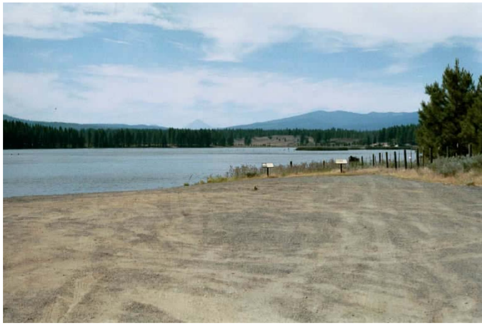
Pioneer Park East—Boat Launch and Parking Area