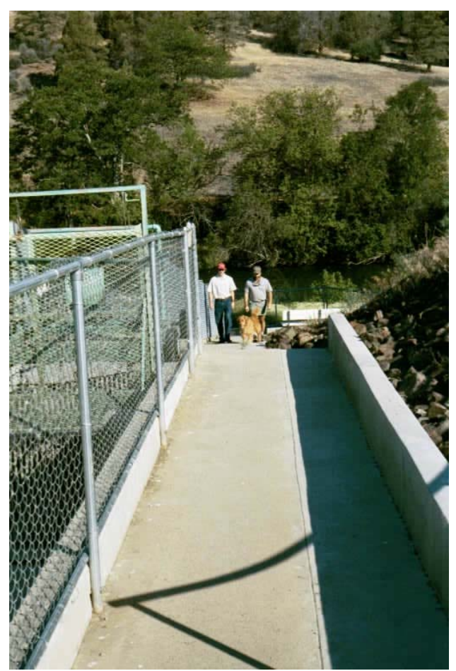
Iron Gate Fish Hatchery—Trail to Fish Ladder