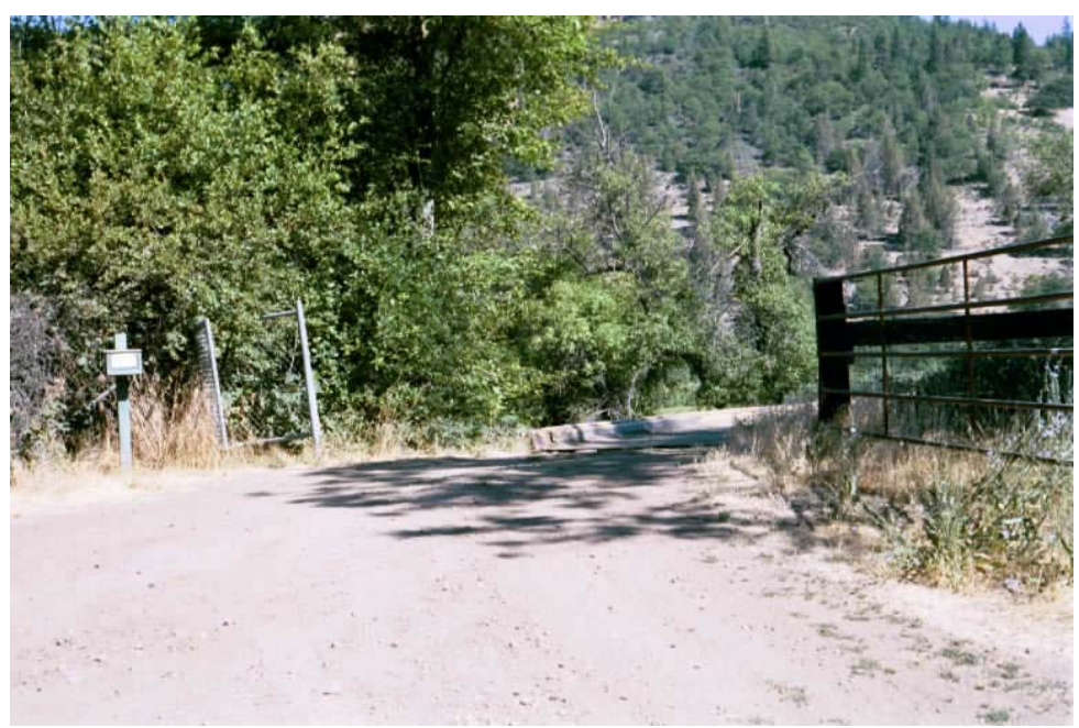
Fishing Access Site 5