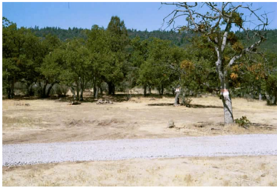
Stateline take-out (PacifiCorp and BLM)