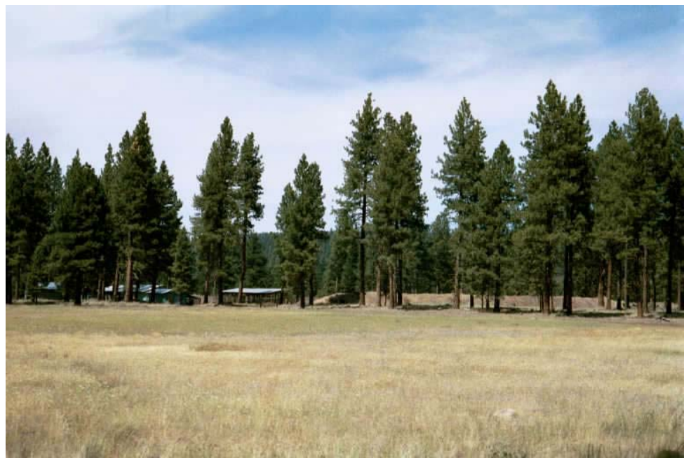
Sportsman's Park—Shooting Ranges