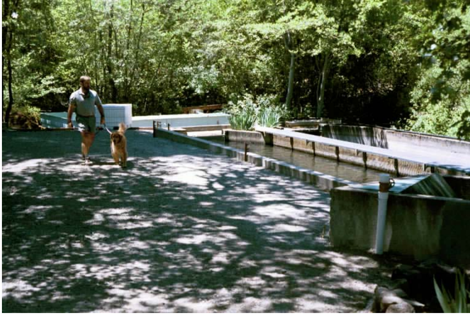
Fall Creek Trail—Fish Rearing Ponds