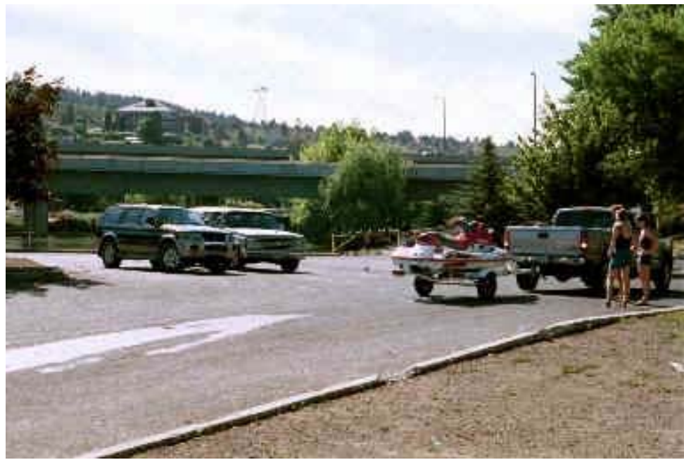
Veteran's Memorial Park and Boat Launch