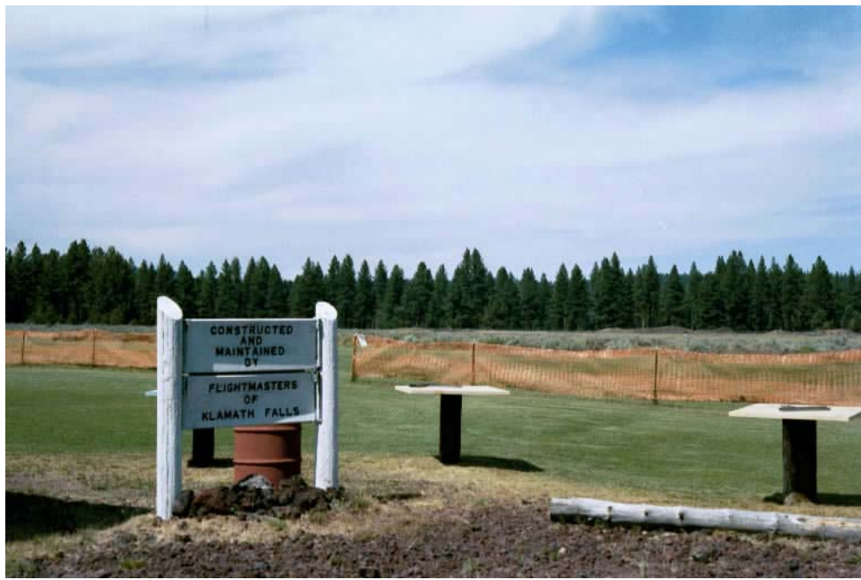
Sportsman's Park—Radio-Controlled Model Airplane Field