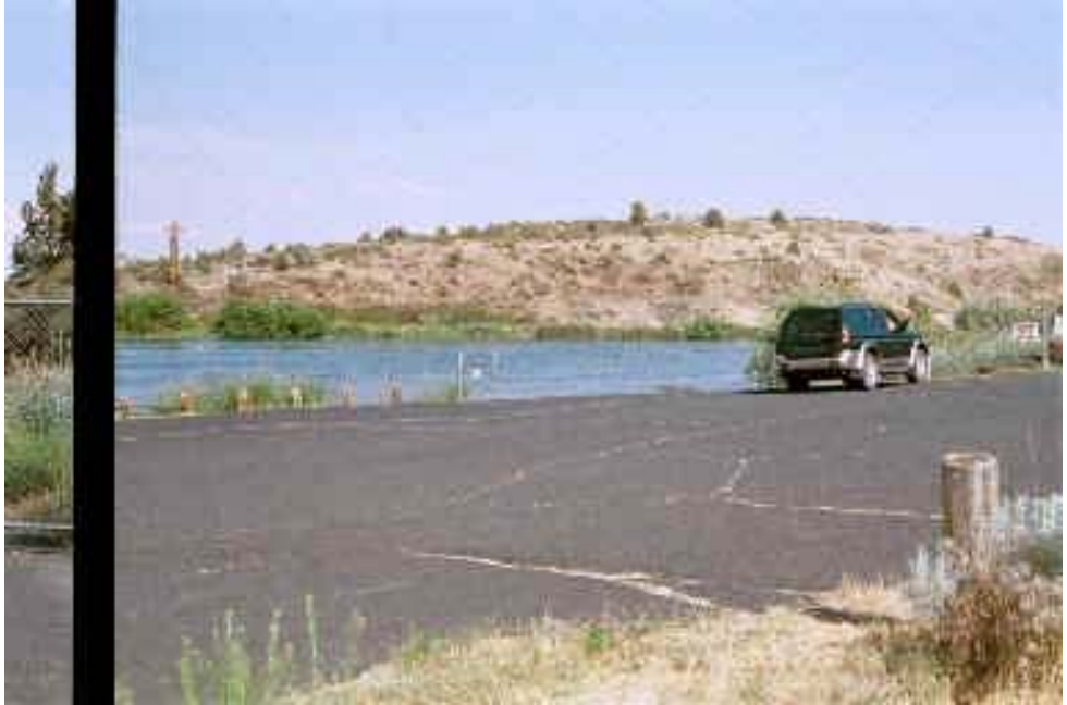
Link River Trail—North Entry