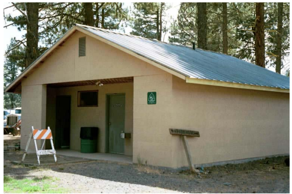
Sportsman's Park—Restrooms at Headquarters Area