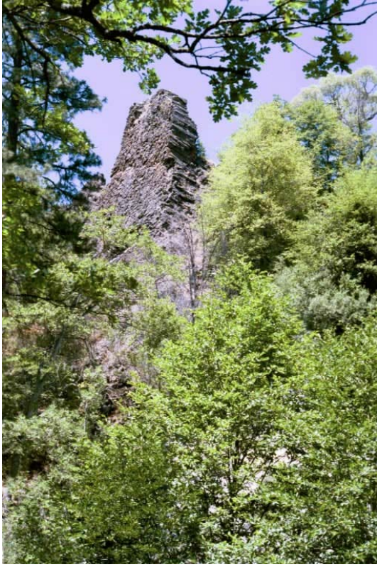
Fall Creek Trail—Columnar Basalt