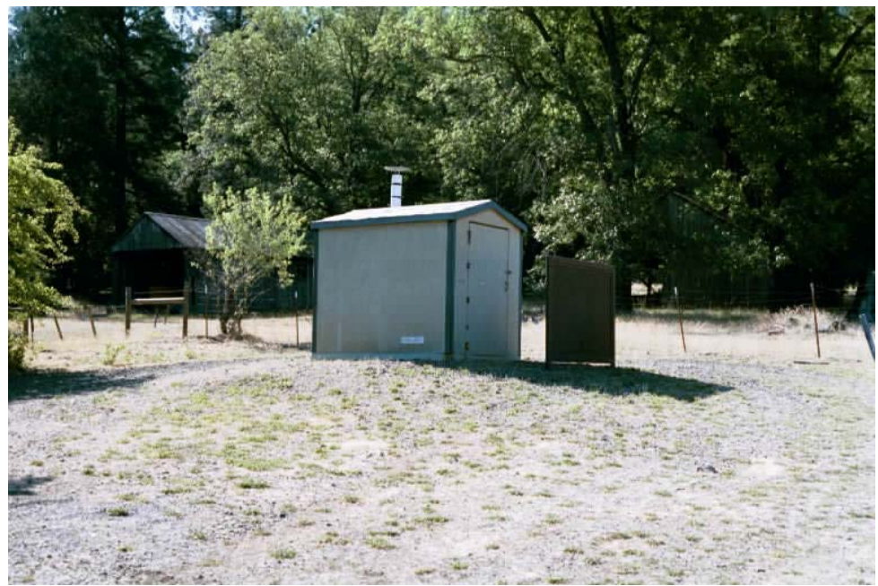
Fishing Access Site 2