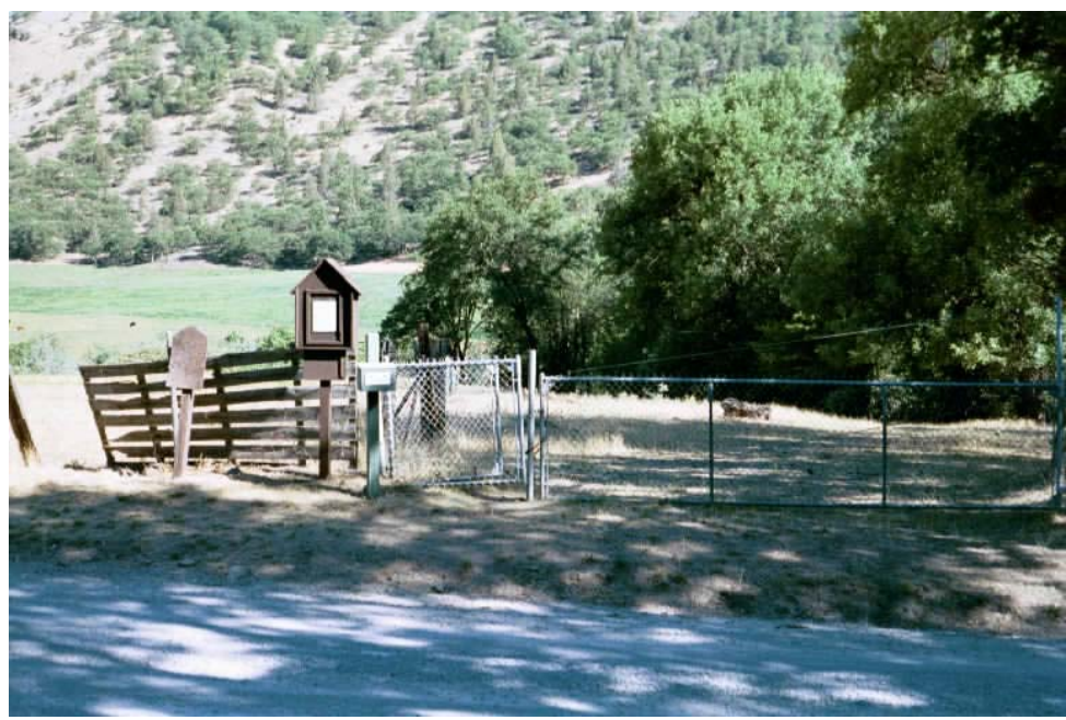
Fishing Access Site 2