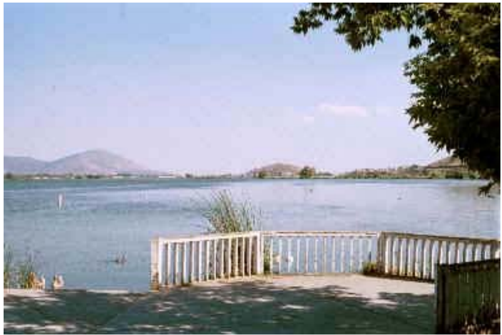
Veteran's Memorial Park and Boat Launch