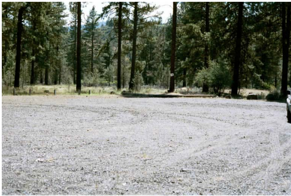
Keno Recreation Area—Day Use Area Parking