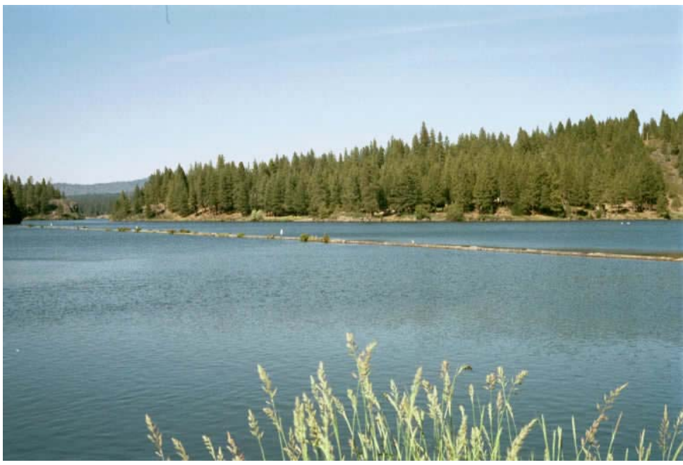
View from J.C. Boyle Dam of the Floating Boom