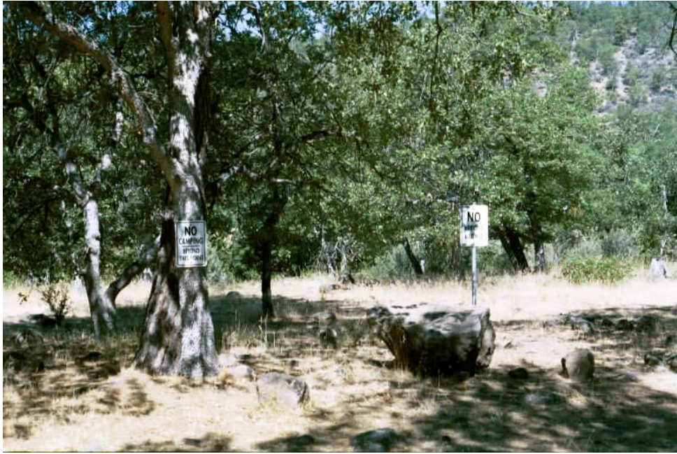
Stateline take-out (PacifiCorp and BLM)