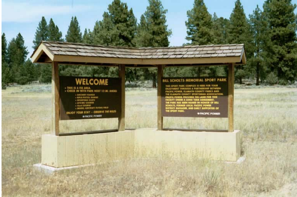
Sportsman's Park—Entry Sign