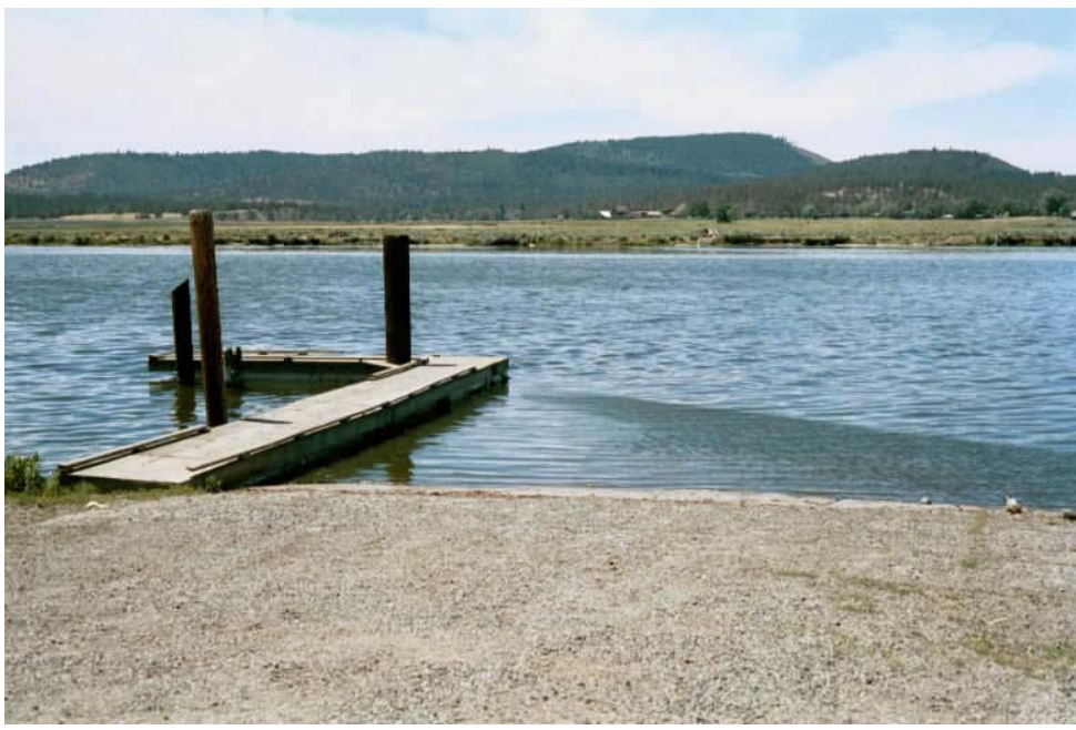
Miller Island Boat Launch—Ramp and Dock