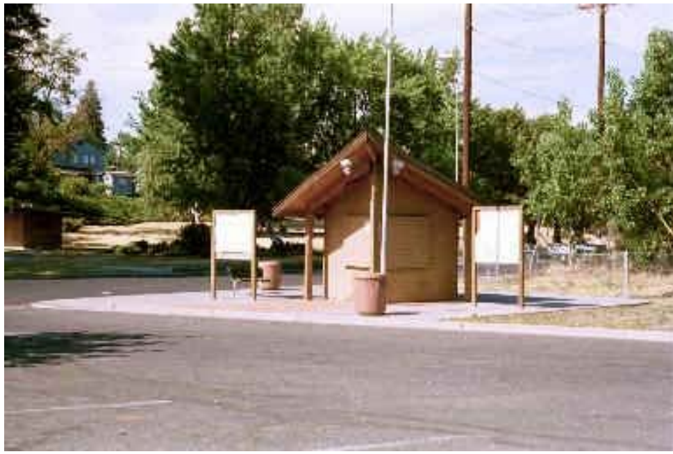
Veteran's Memorial Park and Boat Launch