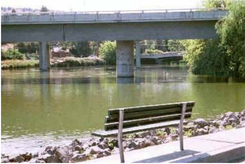
Veteran's Memorial Park and Boat Launch