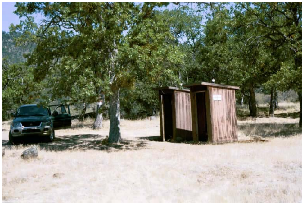
Stateline take-out (PacifiCorp and BLM)