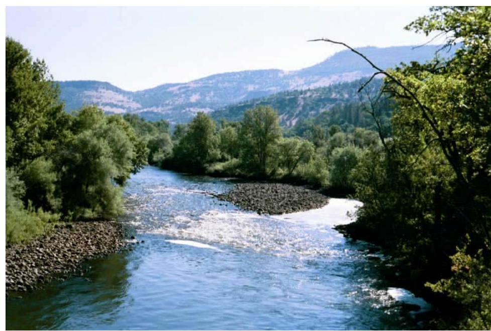
Fishing Access Site 4 and View of River