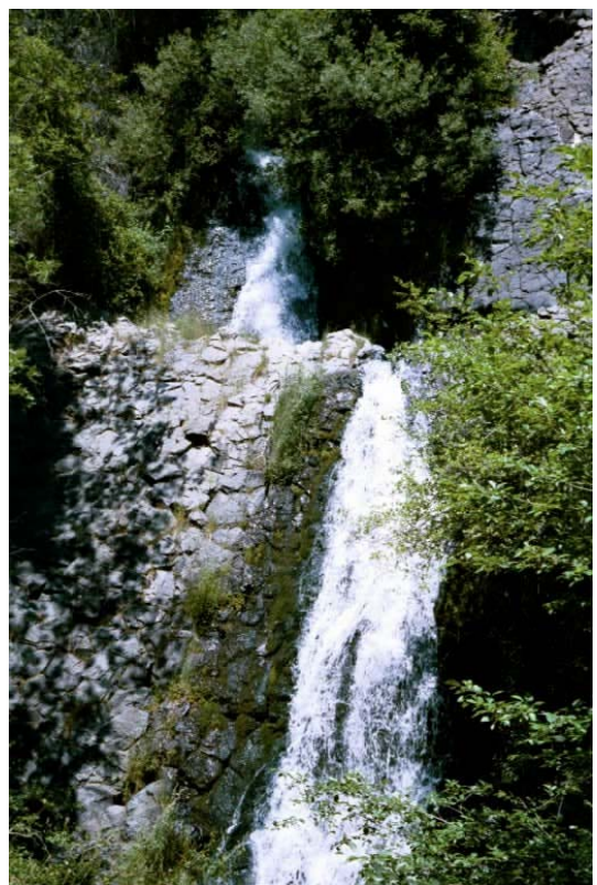
Fall Creek Trail—View of Falls