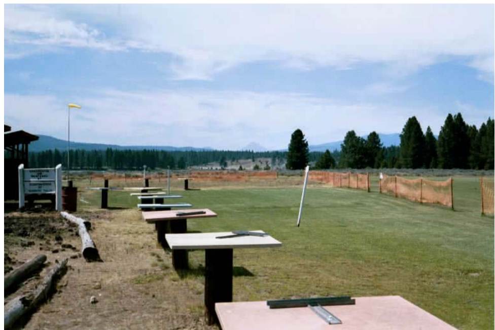
Sportsman's Park—Radio-Controlled Model Airplane Field