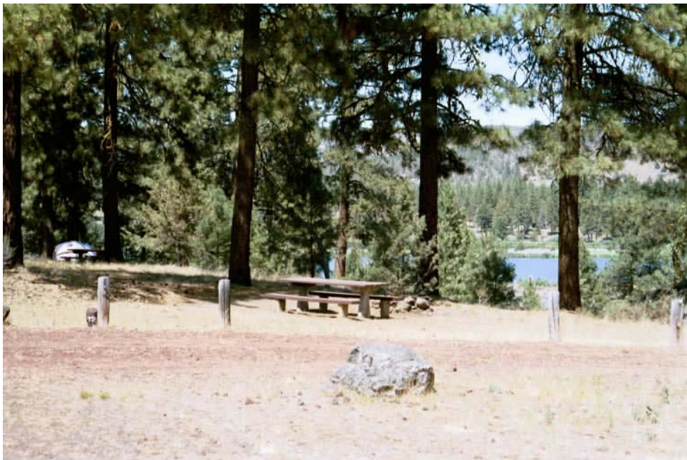
Keno Recreation Area—Campground