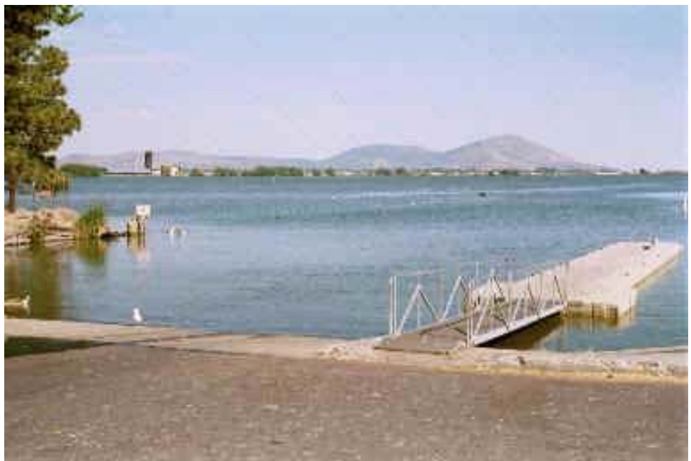
Veteran's Memorial Park and Boat Launch