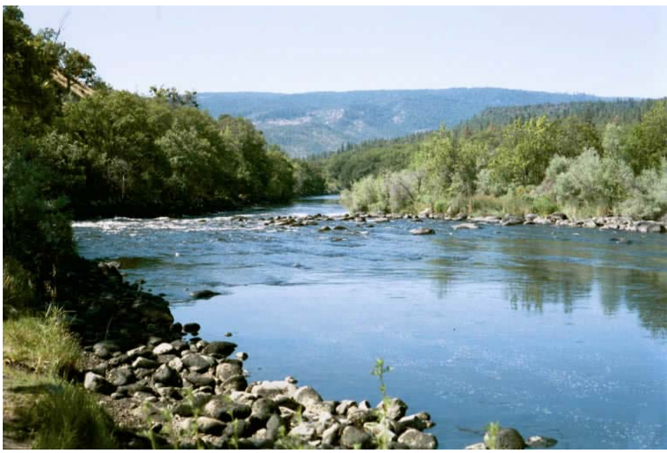
Stateline take-out (PacifiCorp and BLM)