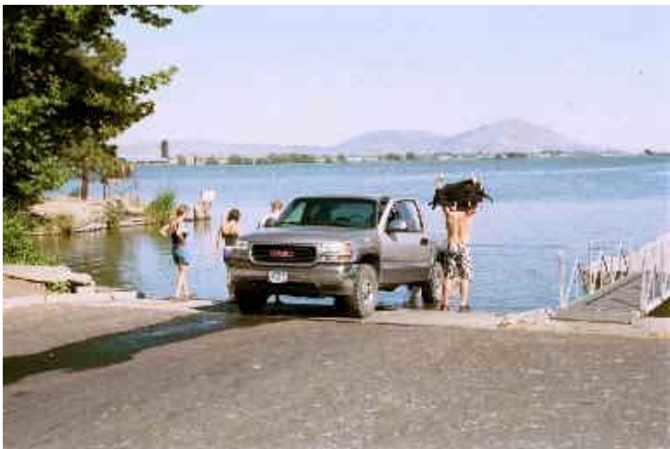
Veteran's Memorial Park and Boat Launch