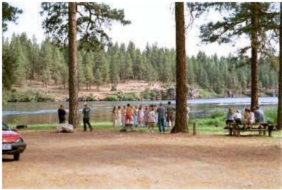
Pioneer Park West—Day Use Area