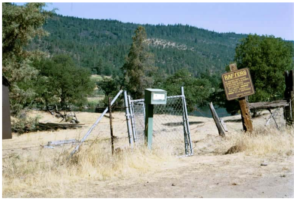
Fishing Access Site 6