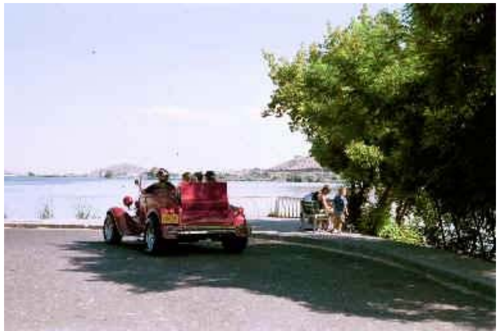
Veteran's Memorial Park and Boat Launch