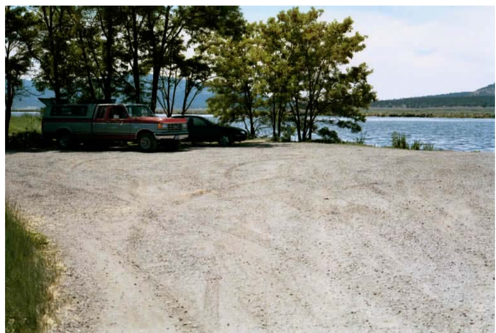
Miller Island Boat Launch—Parking Area