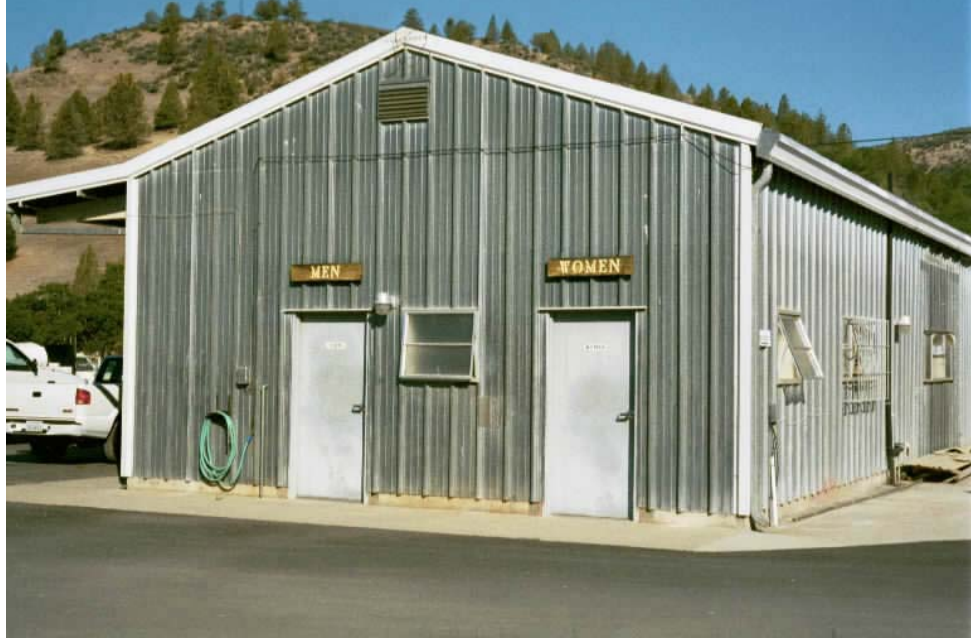
Iron Gate Fish Hatchery—Restrooms