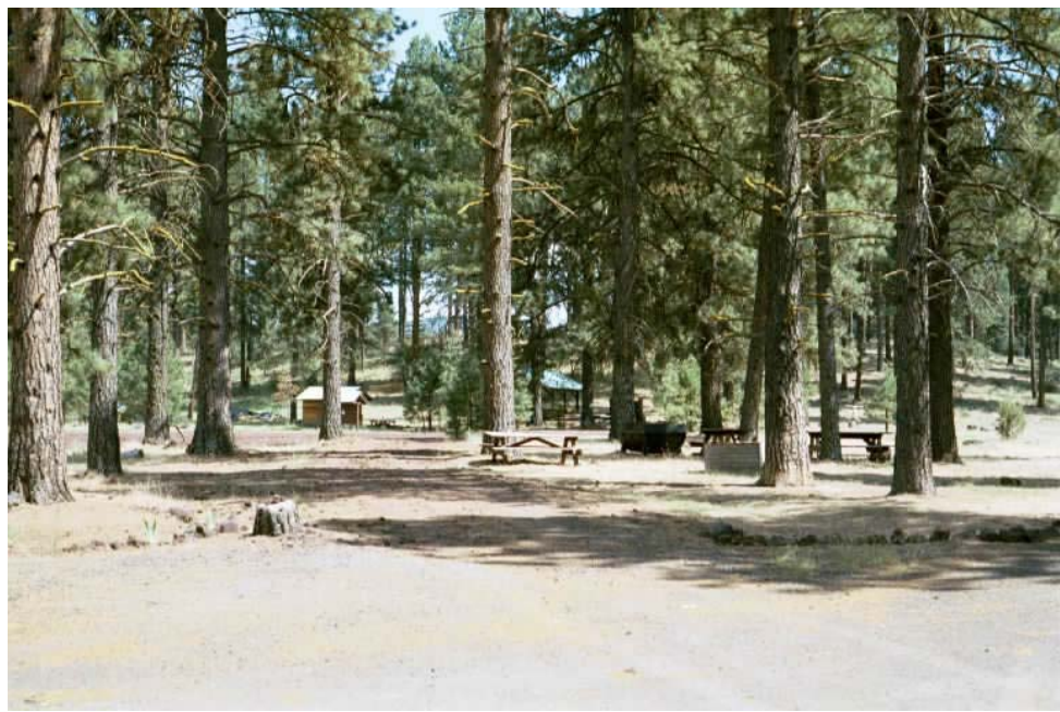
Sportsman's Park—Archery Range