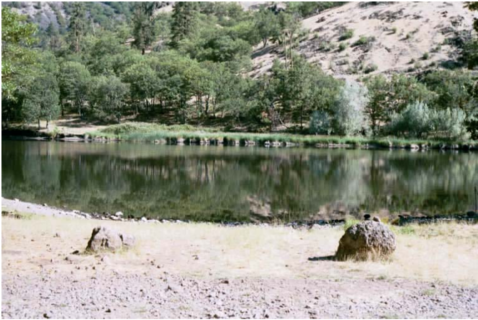
Fishing Access Site 1