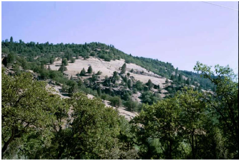
Fishing Access Site 4 and View of Old Logging Slide Area