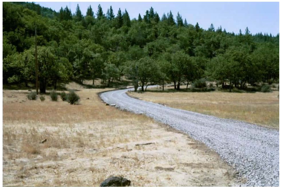
Stateline take-out (PacifiCorp and BLM)