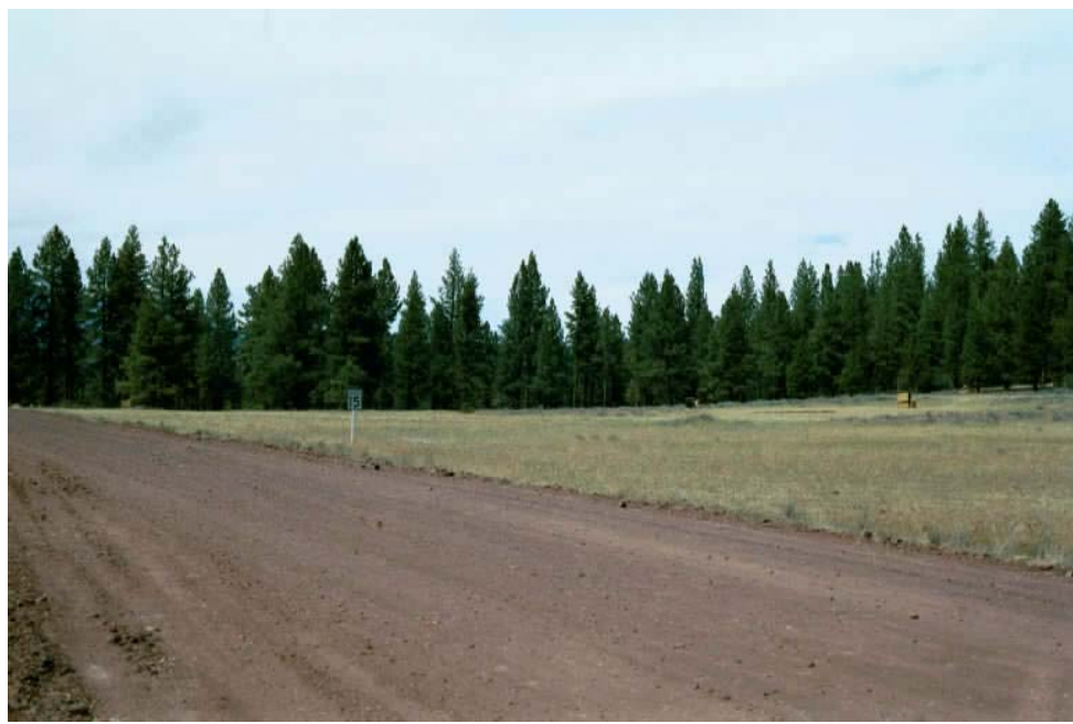
Sportsman's Park—Entry Road and Archery Range