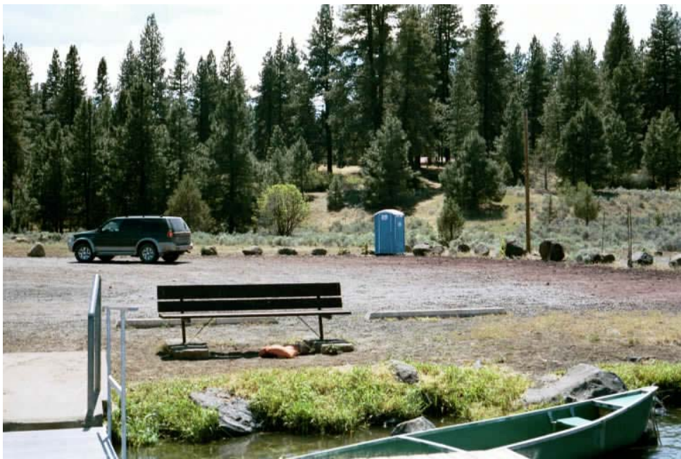
Keno Recreation Area—Boat Launch