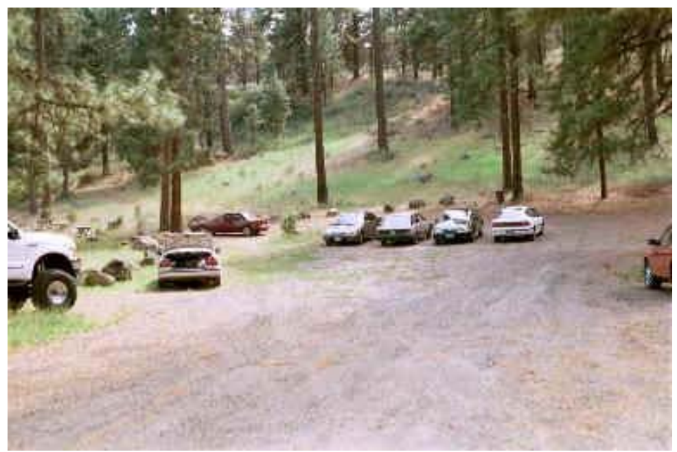
Pioneer Park West—Day Use Area