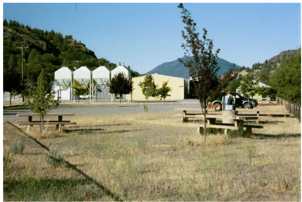
Iron Gate Fish Hatchery—Picnic Area