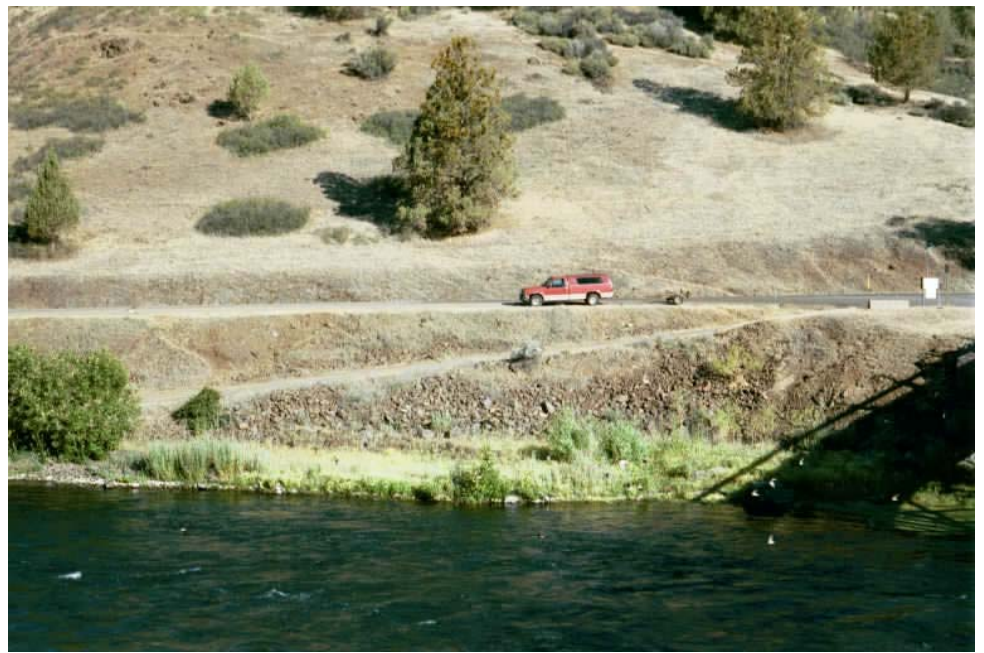
Iron Gate Fish Hatchery—Iron Gate Access Boat Launch