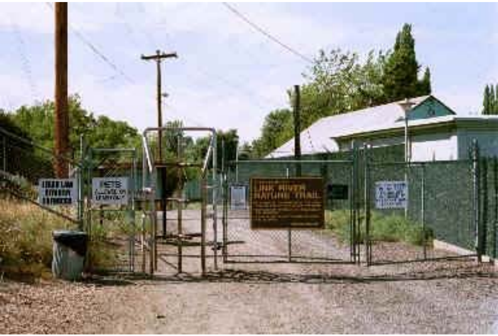
Link River Trail—South Entry