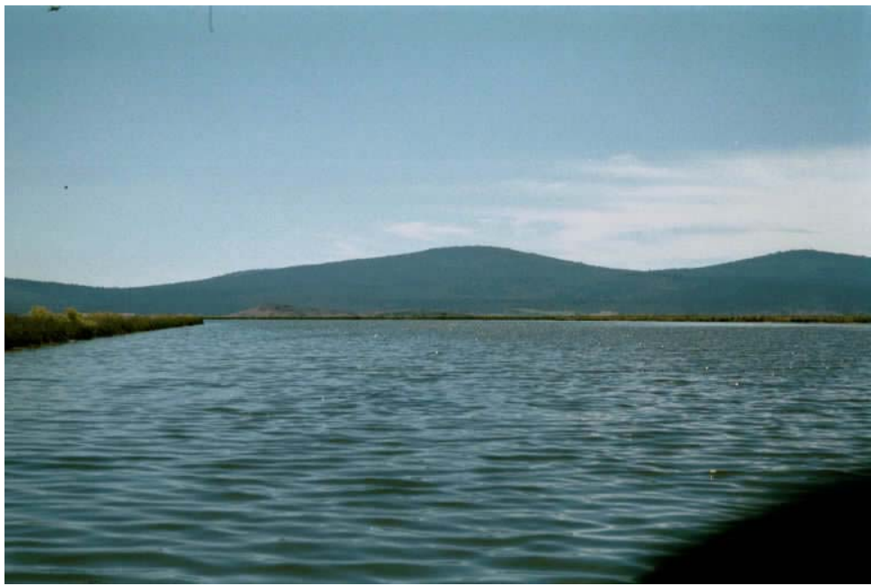
Miller Island Boat Launch—View to the West