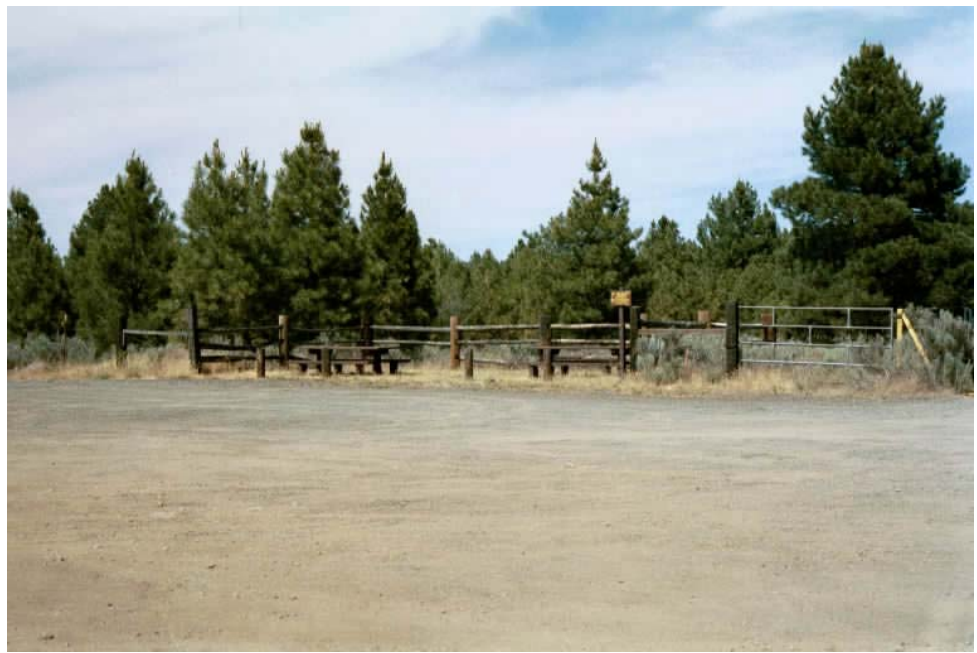
Pioneer Park East—Day Use Area