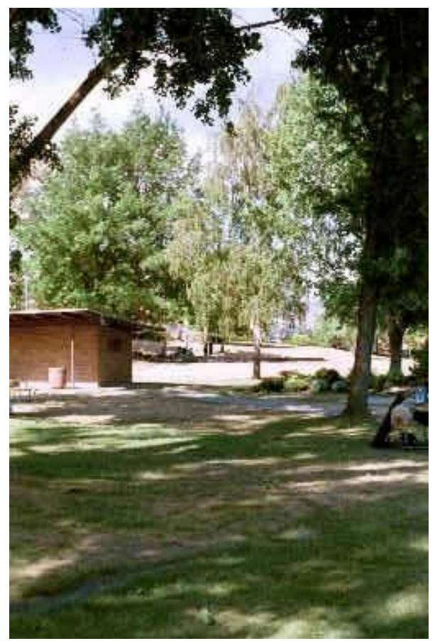
Veteran's Memorial Park Picnic Area