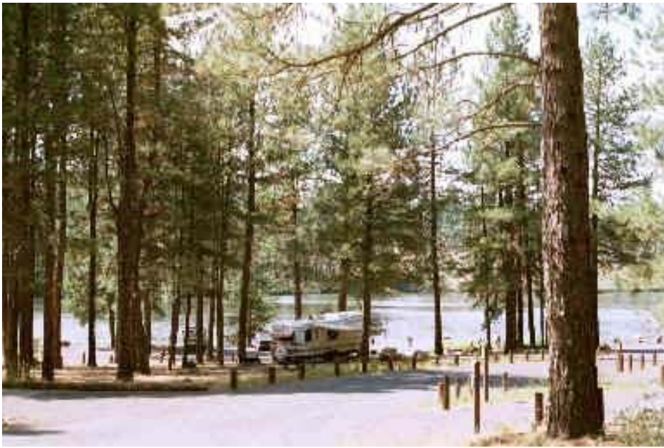
Topsy Recreation Area (BLM)