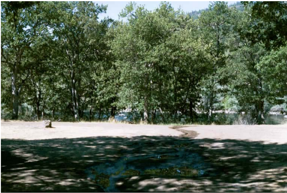
Stateline take-out (PacifiCorp and BLM)