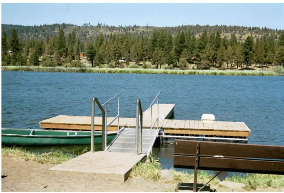
Keno Recreation Area—Boat Dock