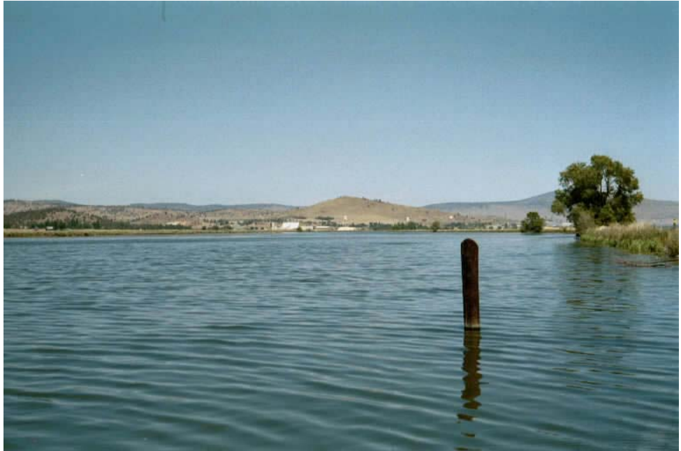
Miller Island Boat Launch—View to the East