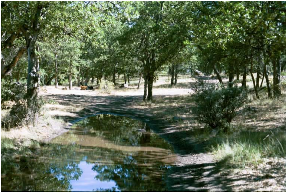
Stateline take-out (PacifiCorp and BLM)