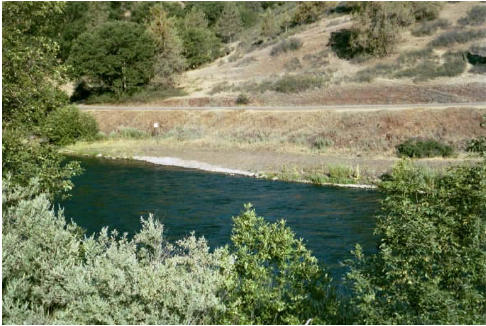
Iron Gate Fish Hatchery—Iron Gate Access Boat Launch