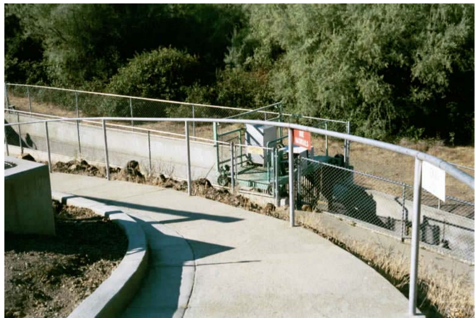
Iron Gate Fish Hatchery—Trail to Fish Ladder