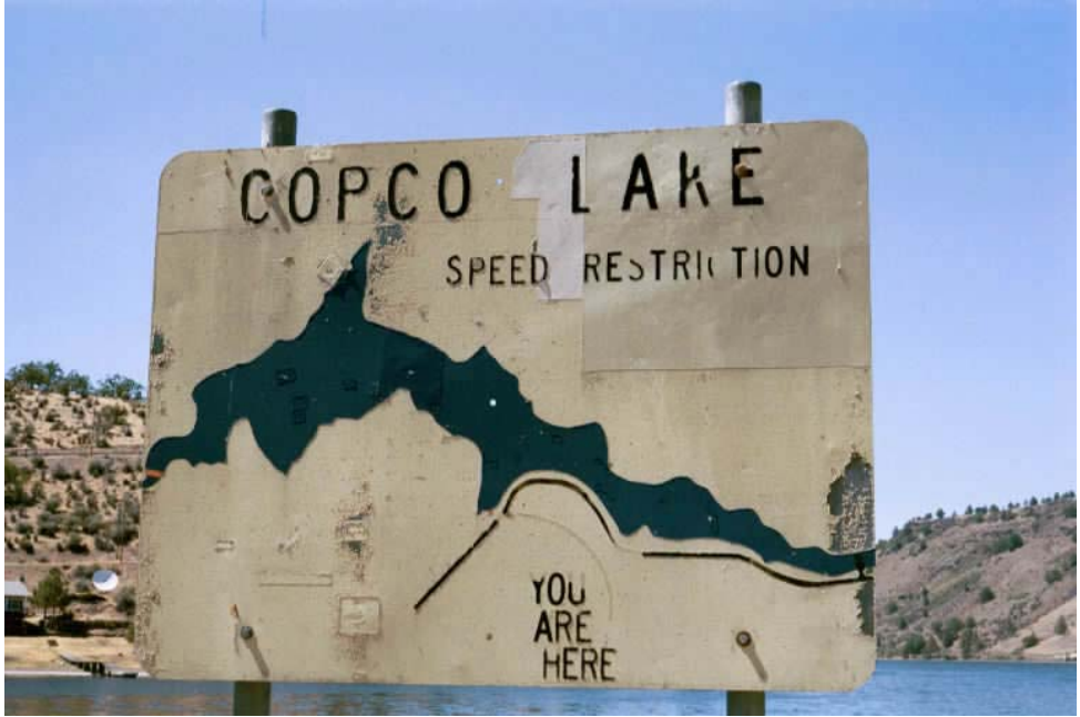
Sign at Mallard Cove