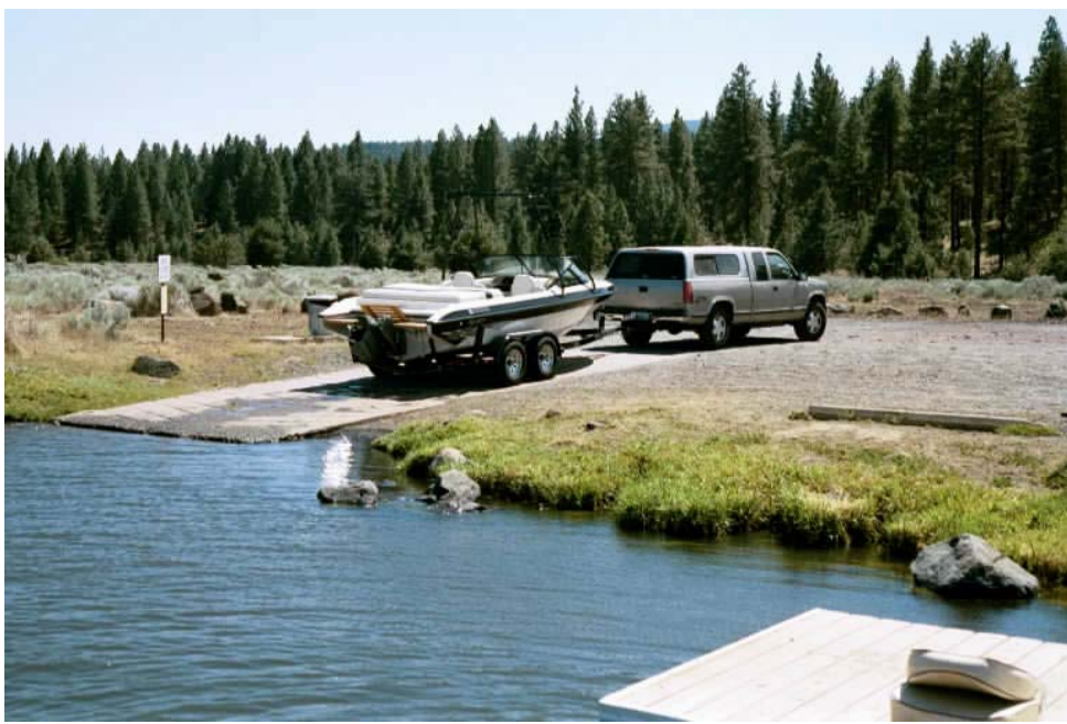
Keno Recreation Area—Boat Launch