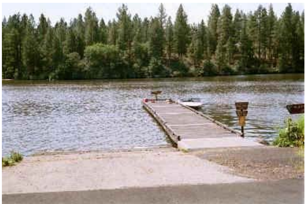
Topsy Recreation Area (BLM)