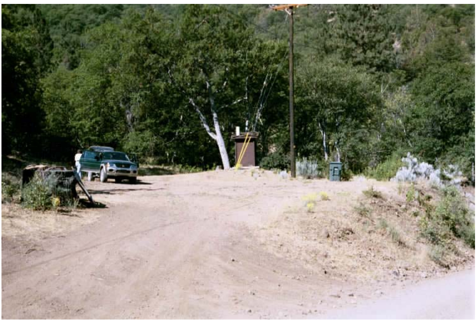
Fishing Access Site 4