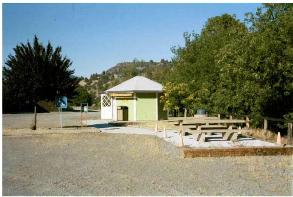
Iron Gate Fish Hatchery—Picnic Area (2001) and Interpretive Kiosk