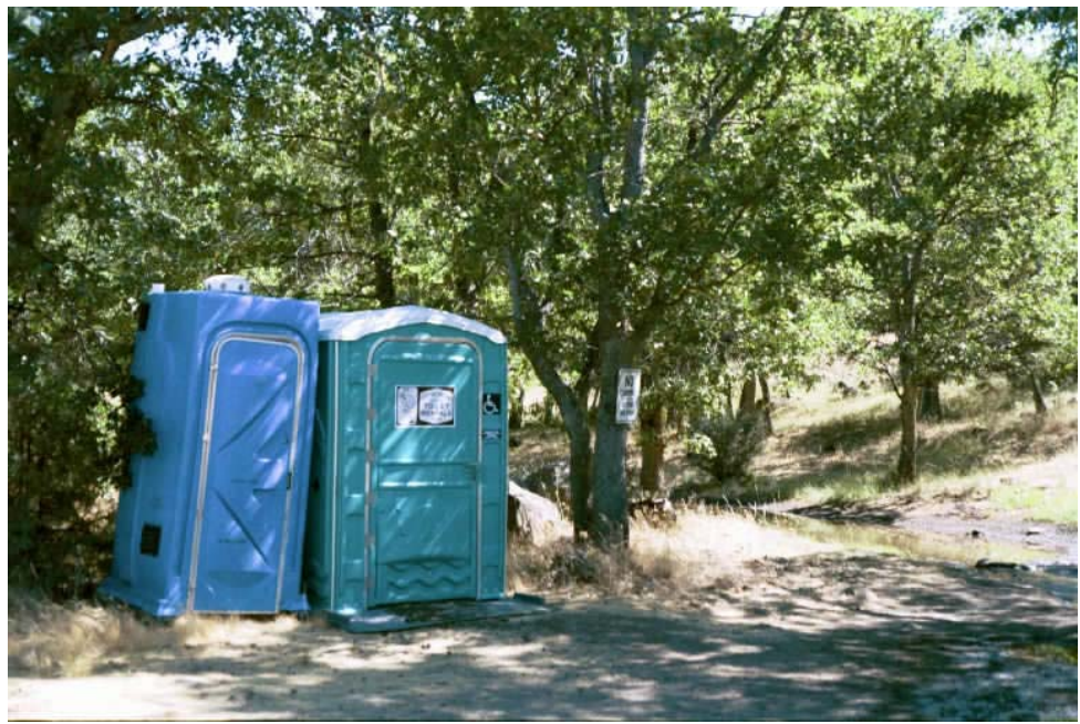
Stateline take-out (PacifiCorp and BLM)