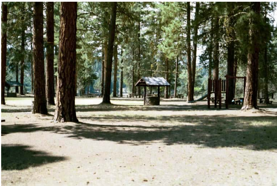
Keno Recreation Area—Upper Day Use Area