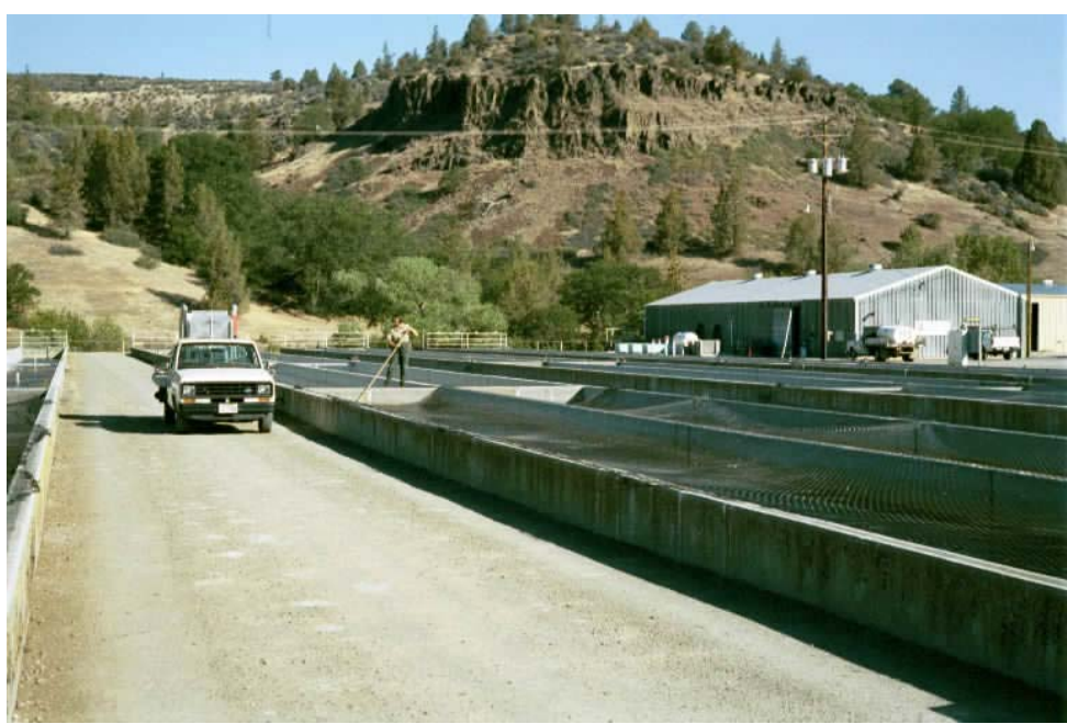
Iron Gate Fish Hatchery—Rearing Ponds