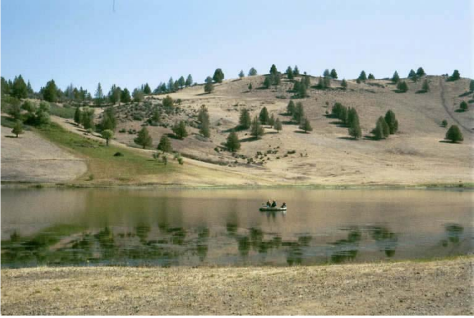
Cove at Long Gulch