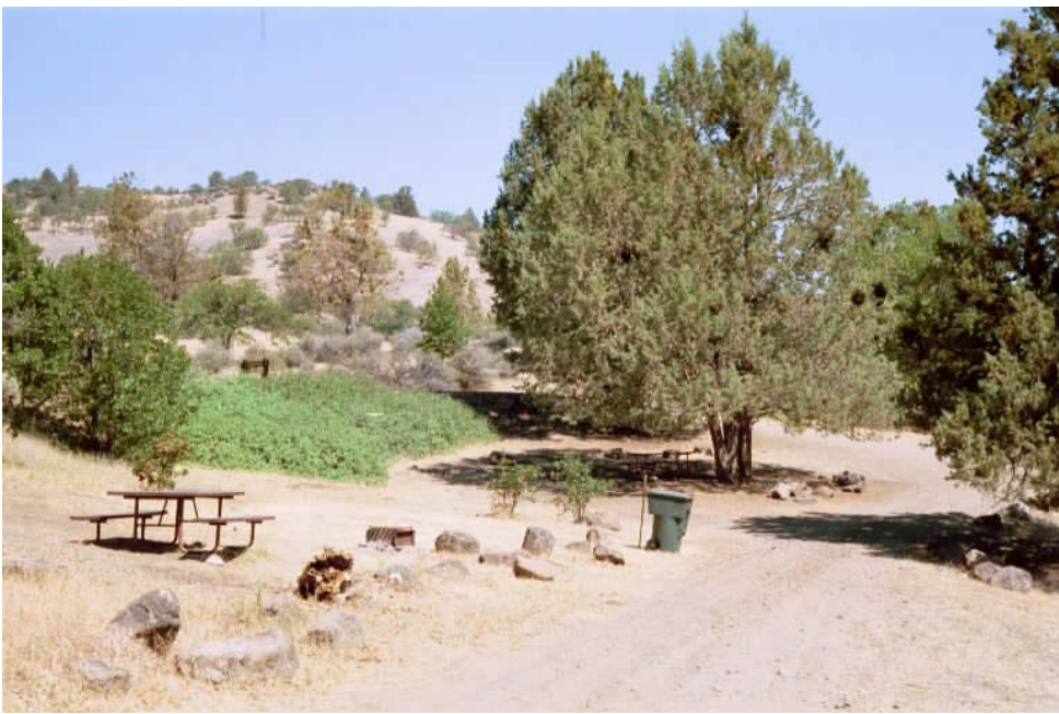
Juniper Point Campground