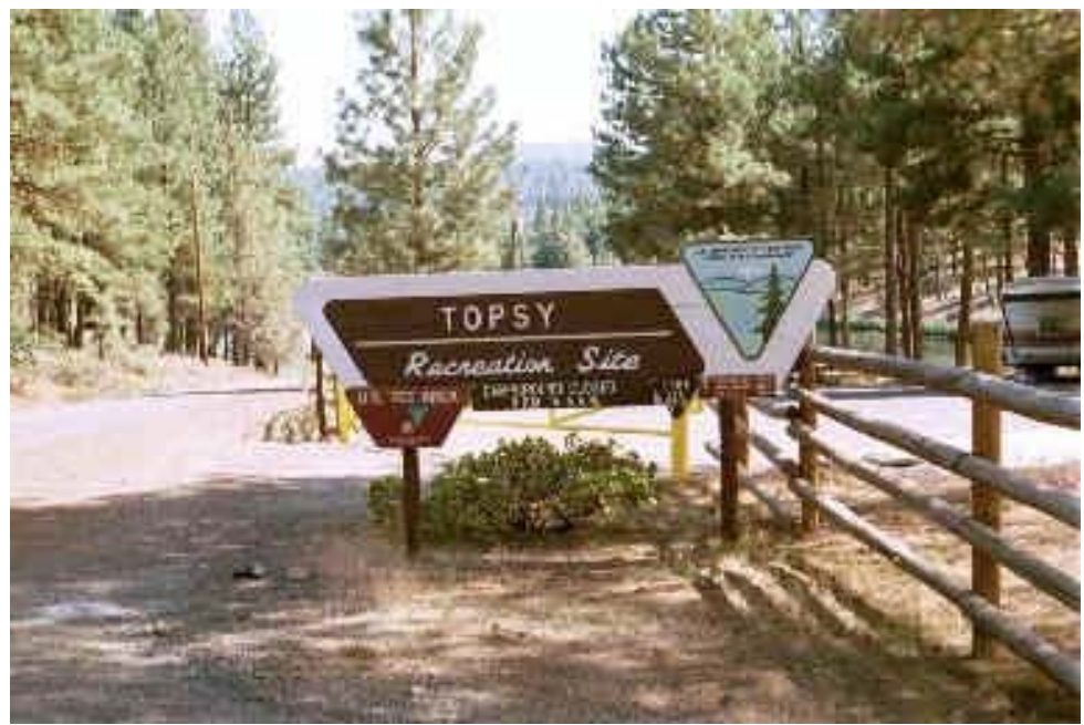
Topsy Recreation Area (BLM)—Entrance Sign