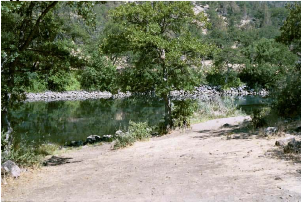
Stateline take-out (PacifiCorp and BLM)