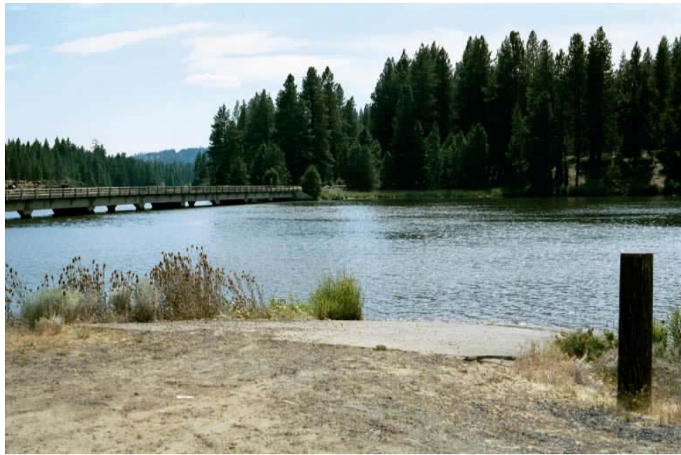
Pioneer Park East—Boat Launch