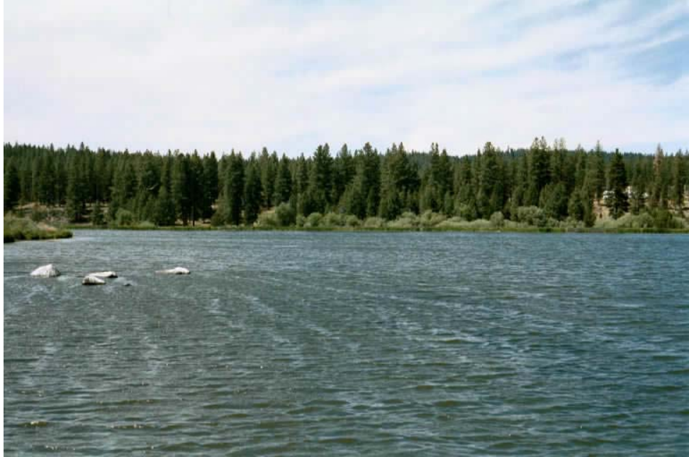
Keno Recreation Area—View of Keno Reservoir