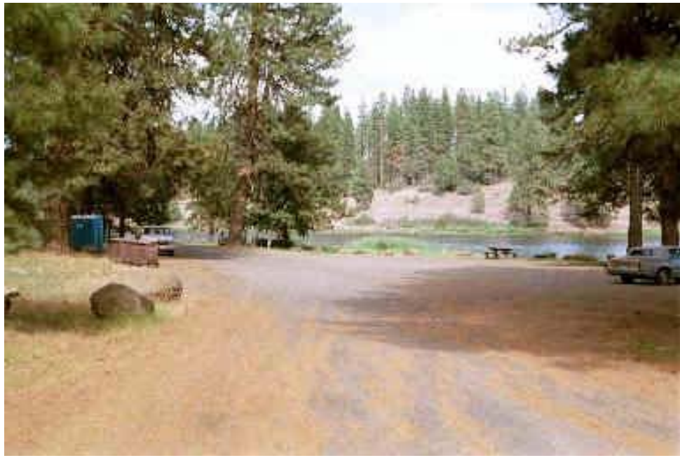
Pioneer Park West—Day Use Area