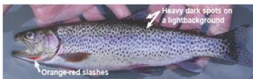
Cutthroat trout Oncorhynchus clarki

IF YOU CATCH A BULL TROUT, RELEASE IT IF YOU DON'T KNOW, LET IT GO. Killing or intentionally harming a bull trout is a violation of the federal Endangered Species Act, and can result in criminal penalties of up to $25,000 and up to six months in jail, and/or a civil penalty of up to $12,500. Contact your local state or federal agency with any information regarding the illegal harvest of bull trout. 877-WDFW-TIP (877-933-9847) Consult the current Washington Fishing Rules Pamphlet or visit WDFW's website at www.wdfw.wa.gov for up-to-date angling regulations.