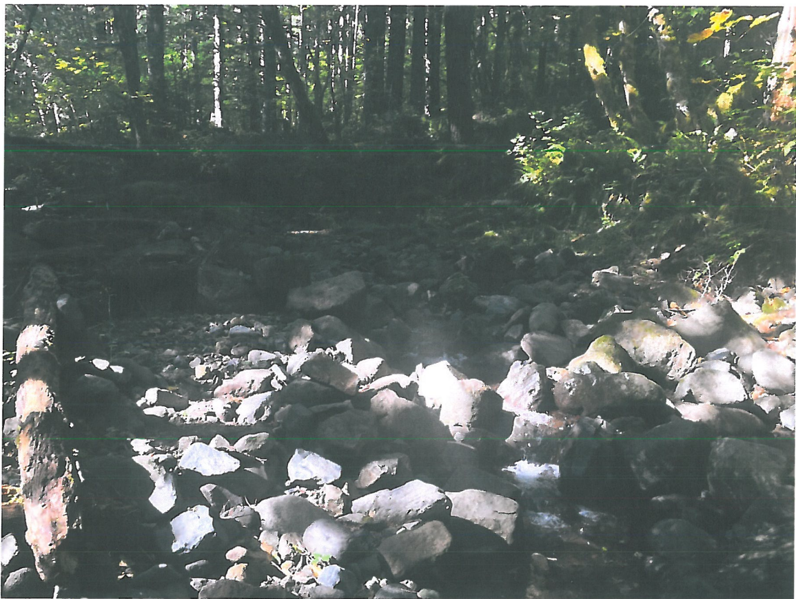
Figure 3. Spencer Creek channel showing limited spawning gravel and low levels of functional large wood.