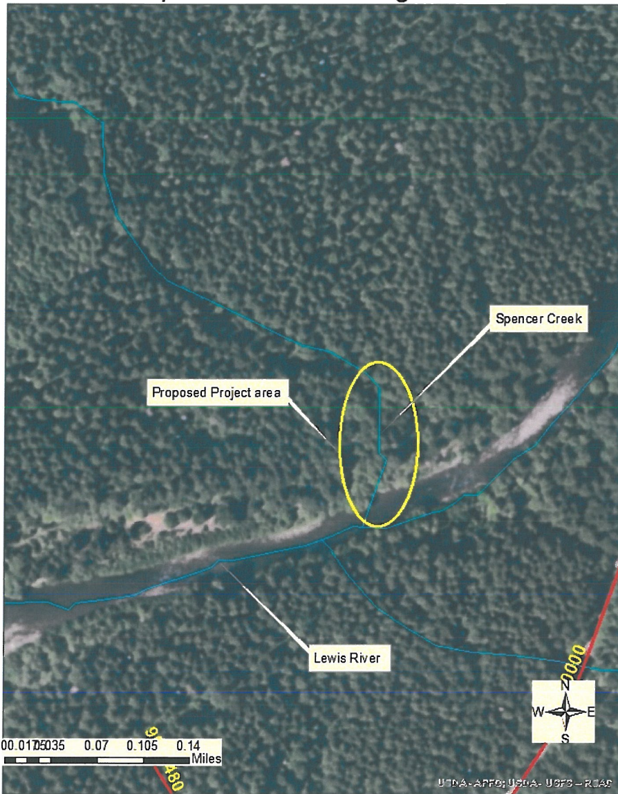
Figure 2. Spencer Creek project area enlarged view.