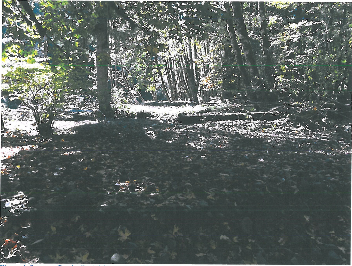
Figure 4. Spencer Creek alluvial fan at the confluence of the mainstem North Fork Lewis River.