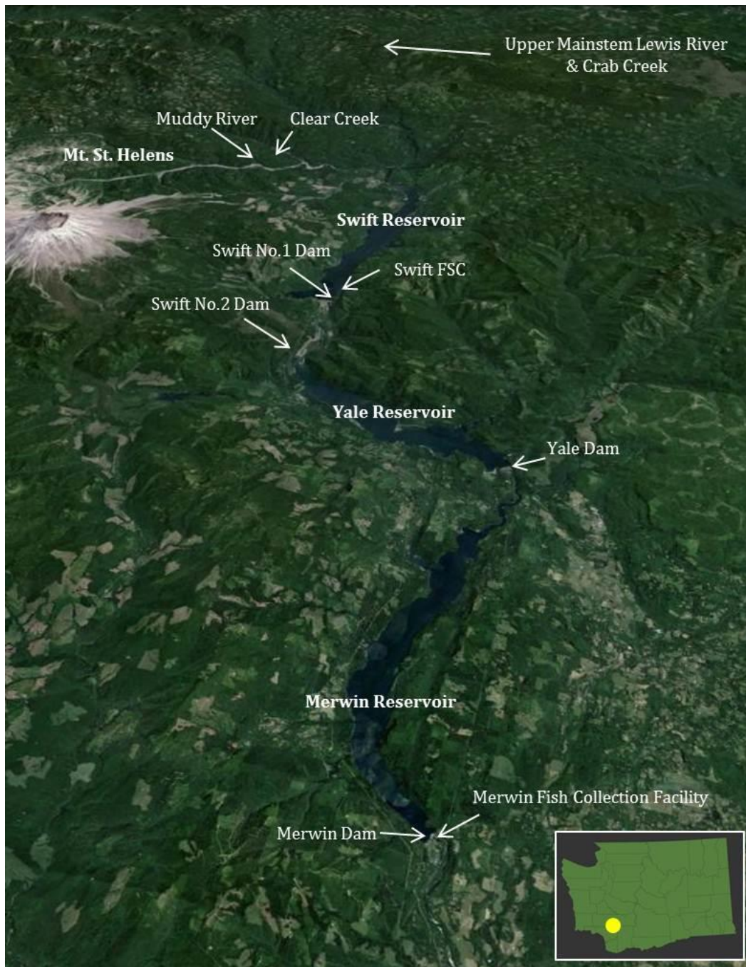
Figure 1.0-1. An overview of key features of the North Fork Lewis River Hydroelectric Project area located in southwest Washington.