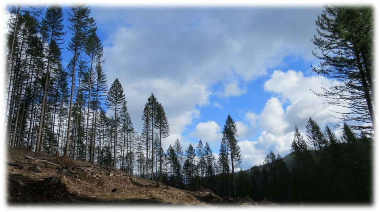
Unit 1 – Beats Clearcut