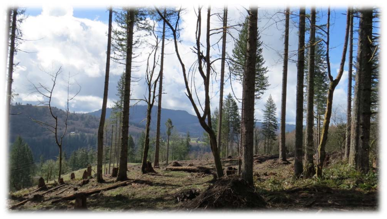
Unit 1 – Skull Candy Completed Harvest Area