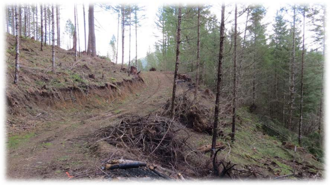
Unit 1 – Road through Bose Thin