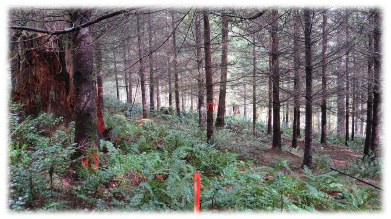
Unit 1 – Proposed DNR Access Road