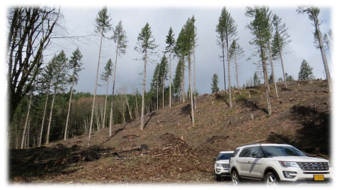
Unit 1 – Skull Candy Completed Harvest Area