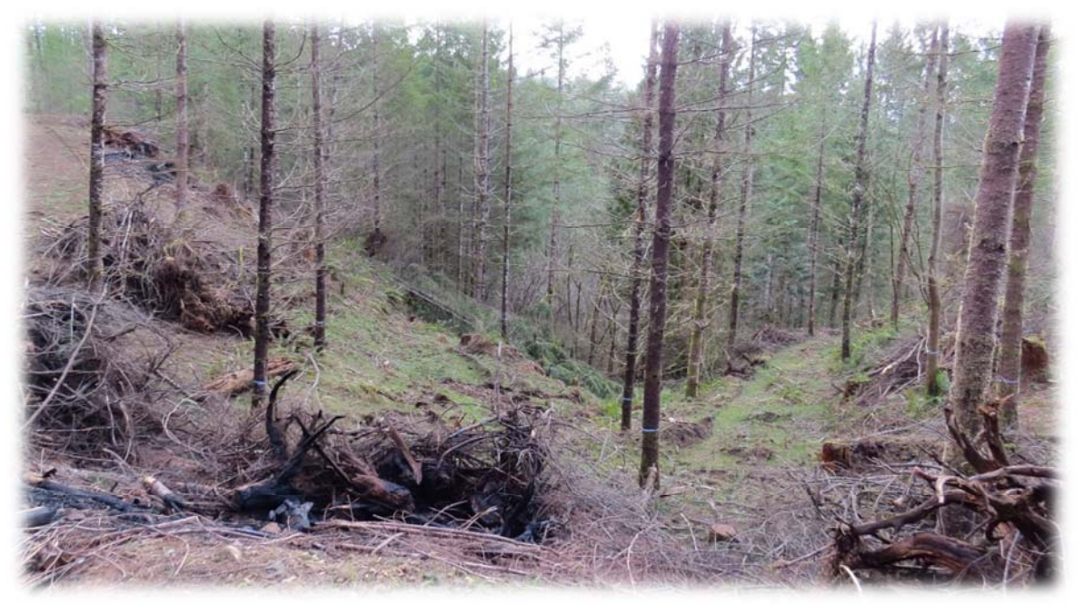
Unit 1 –Bose Thin