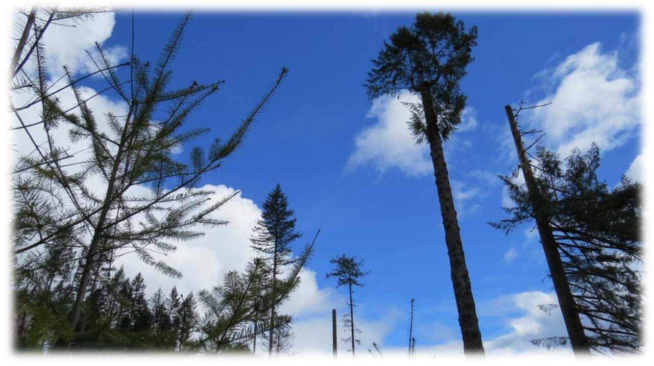
Unit 1 – Snag Tree