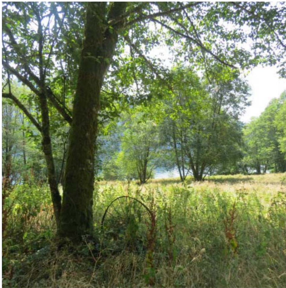
Upper McKee Meadow – August 2015