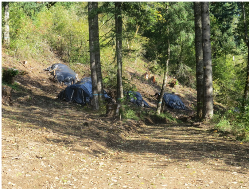
Upper McKee (slash piles covered and ready to be burned December 2016)