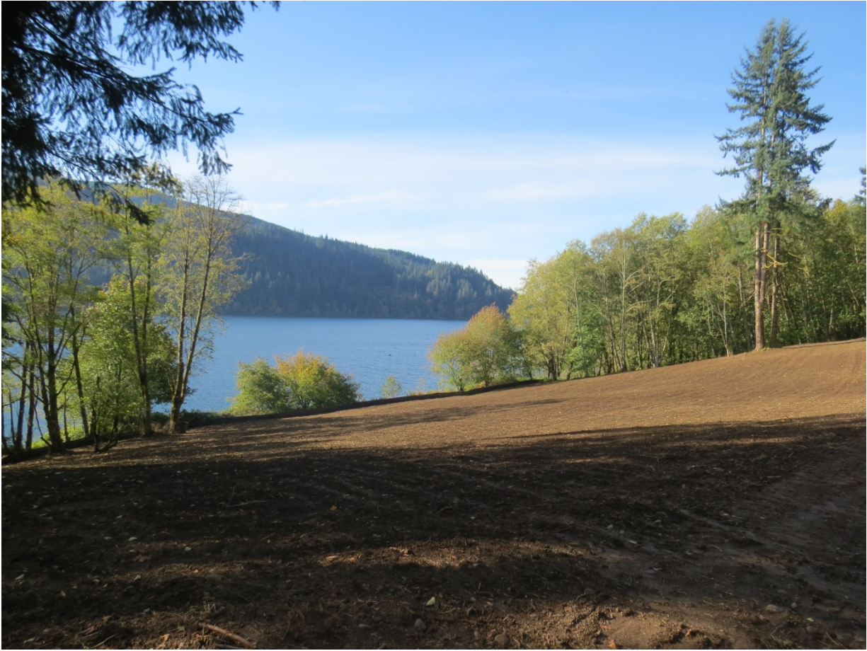
Upper McKee Meadow – October 2016