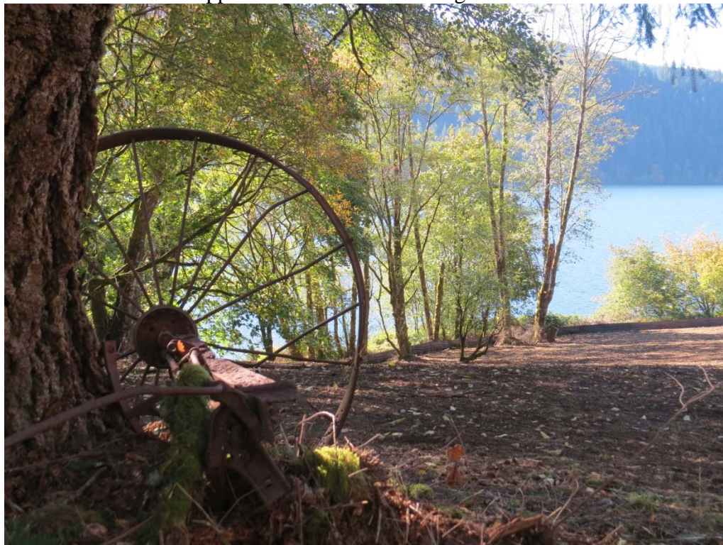
Upper McKee Meadow – October 2016