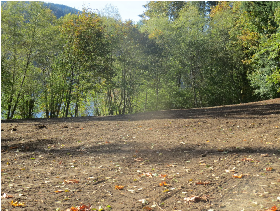
Lower McKee Meadows – October 2016