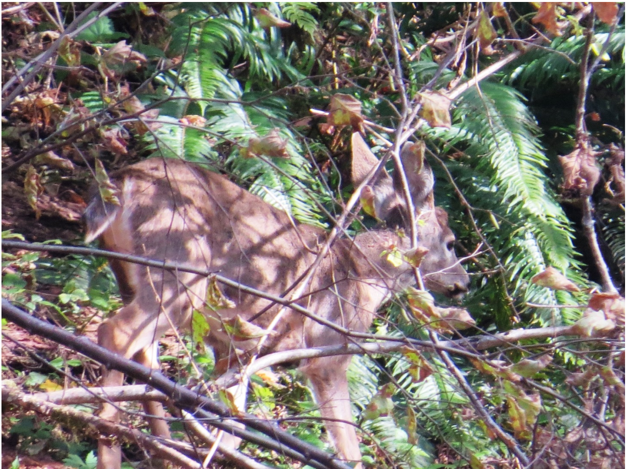
Wildlife greeting us when we arrived – October 2016

<11:30am Meeting Adjourned – return to HCC>