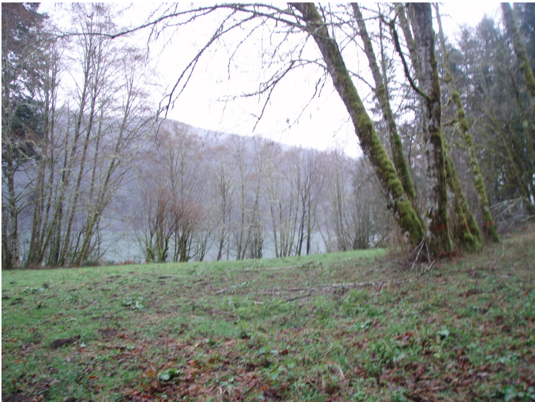
Lower McKee Meadows – March 2016