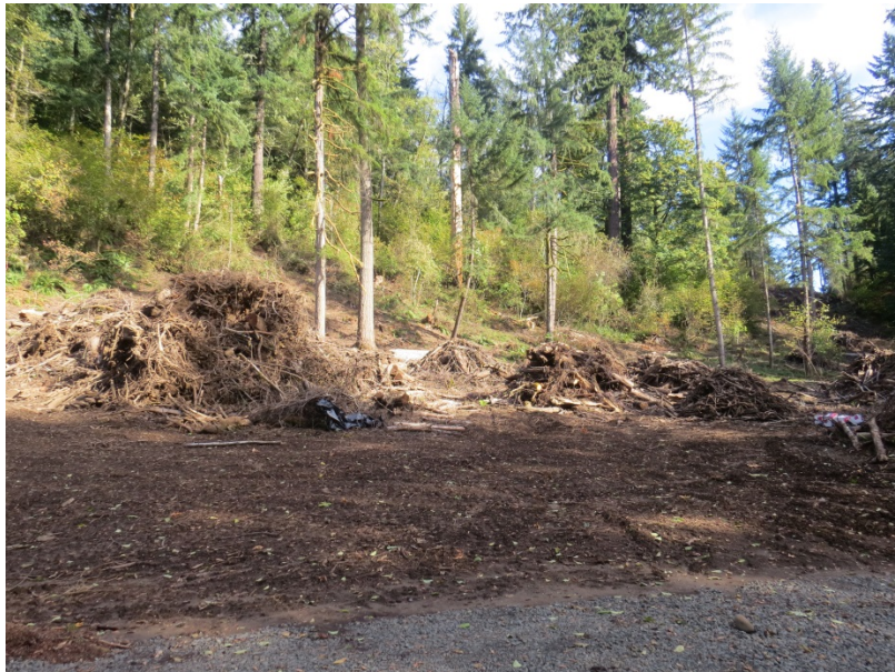
Upper McKee (slash piles still needing to be covered) – October 2016