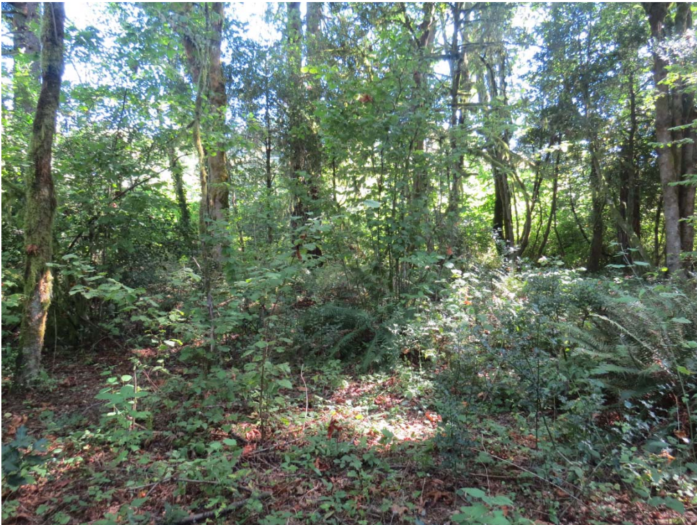
Project proposed for clearing adjacent to Merwin Substation (approximately .75 acres)