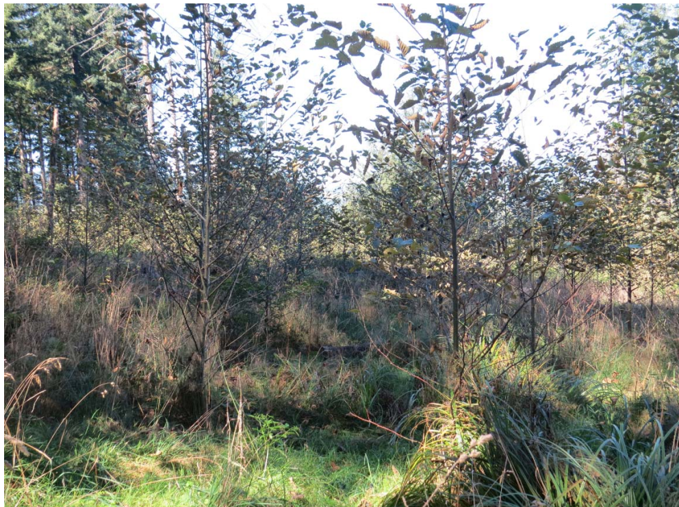
121547CC alder sapling three years after planting and 2015 treatment of naturally regenerated alder