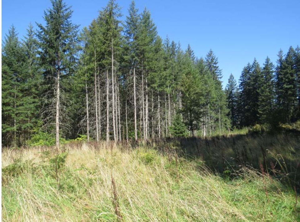
Buncombe Hollow Meadow - September 2016