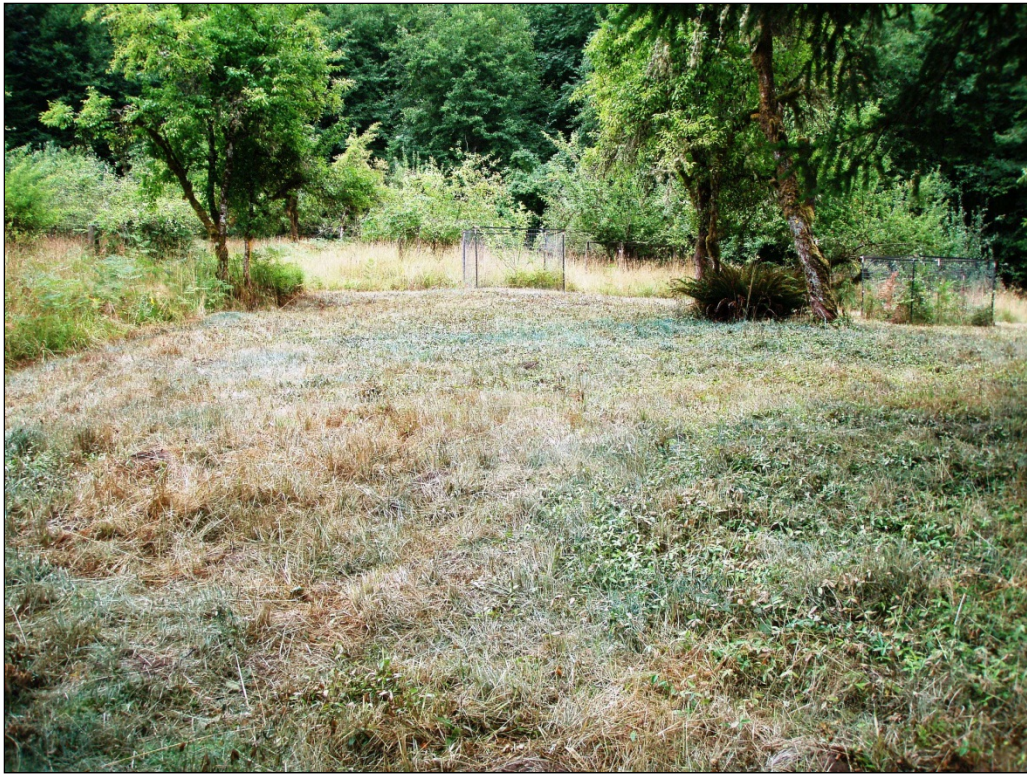
Buncombe Hollow Orchard periwinkle control - August 2013