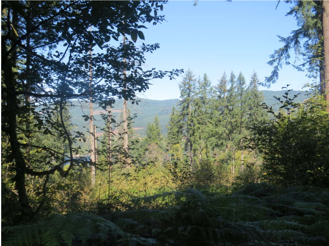
Snag retention and red alder sapling growth in 121547CC