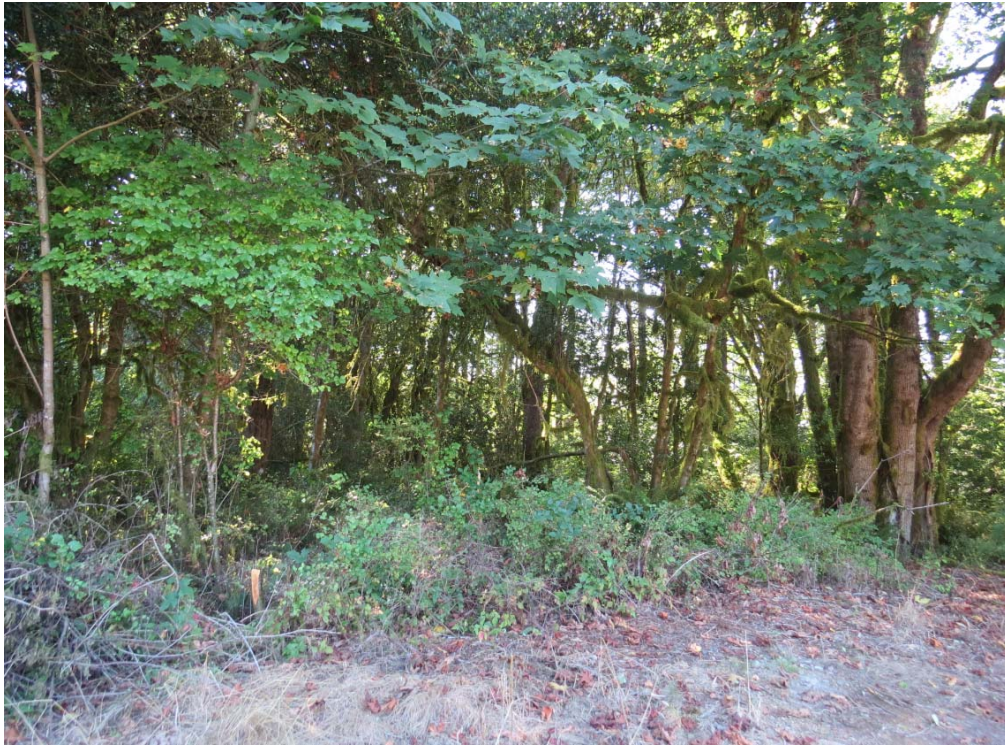
Project proposed for clearing adjacent to Merwin Substation (approximately .75 acres)