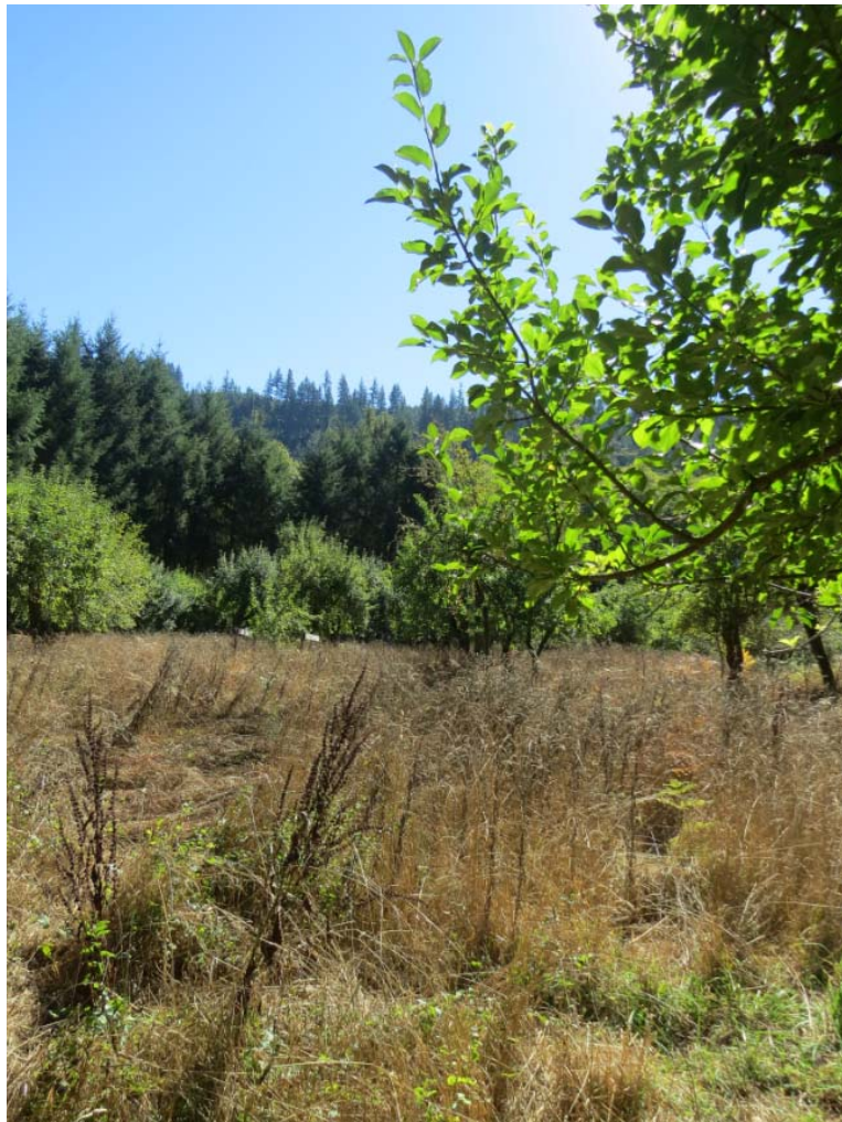
Buncombe Hollow Orchard - September 2016