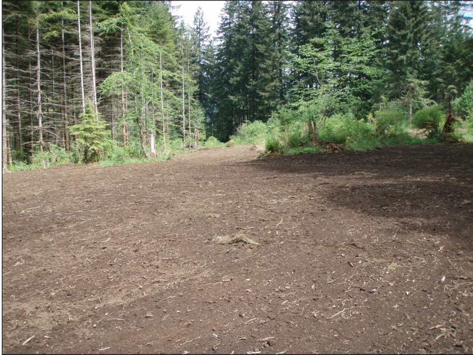
Buncombe Hollow Meadow following grass seeding - May 2013