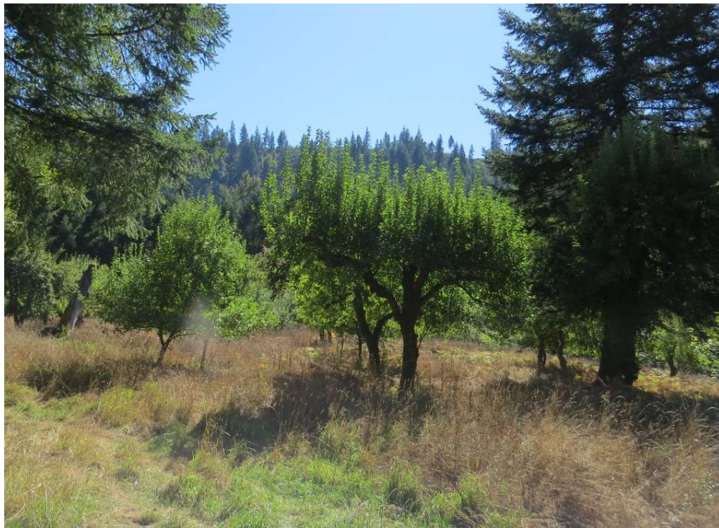
Buncombe Hollow Orchard - September 2016