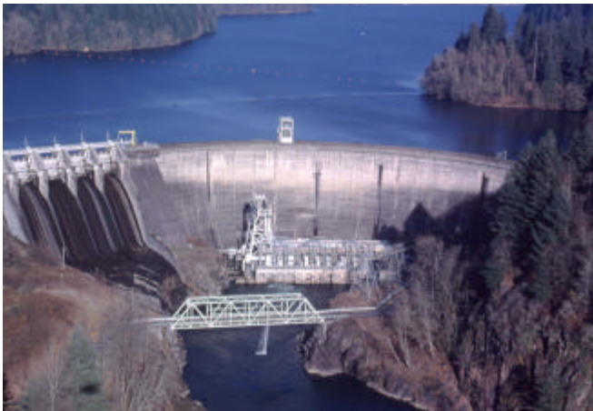
Figure A.3.1-1. Merwin Dam and Powerhouse.

Merwin Dam impounds a southwestward flowing stretch of the Lewis River near Ariel, Washington. The main dam is a concrete variable radius arch dam with a crest length of 728 feet and maximum height of 313 feet. The north (right) abutment of the arch rests against a 75-foot-long concrete gravity thrust block with a maximum height of 145 feet. Immediately north of the thrust block is a 206-foot-long gravity section that contains the