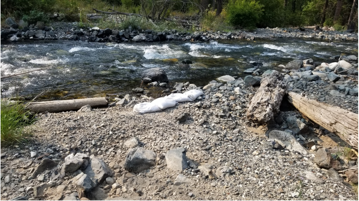
Figure 3. Photo of Wallowa Falls side-channel barrier of small channel halfway down the main side-channel.