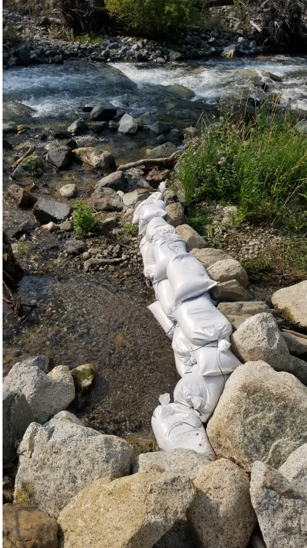
Figure 2. Photo of Wallowa Falls side-channel barrier on upstream end.