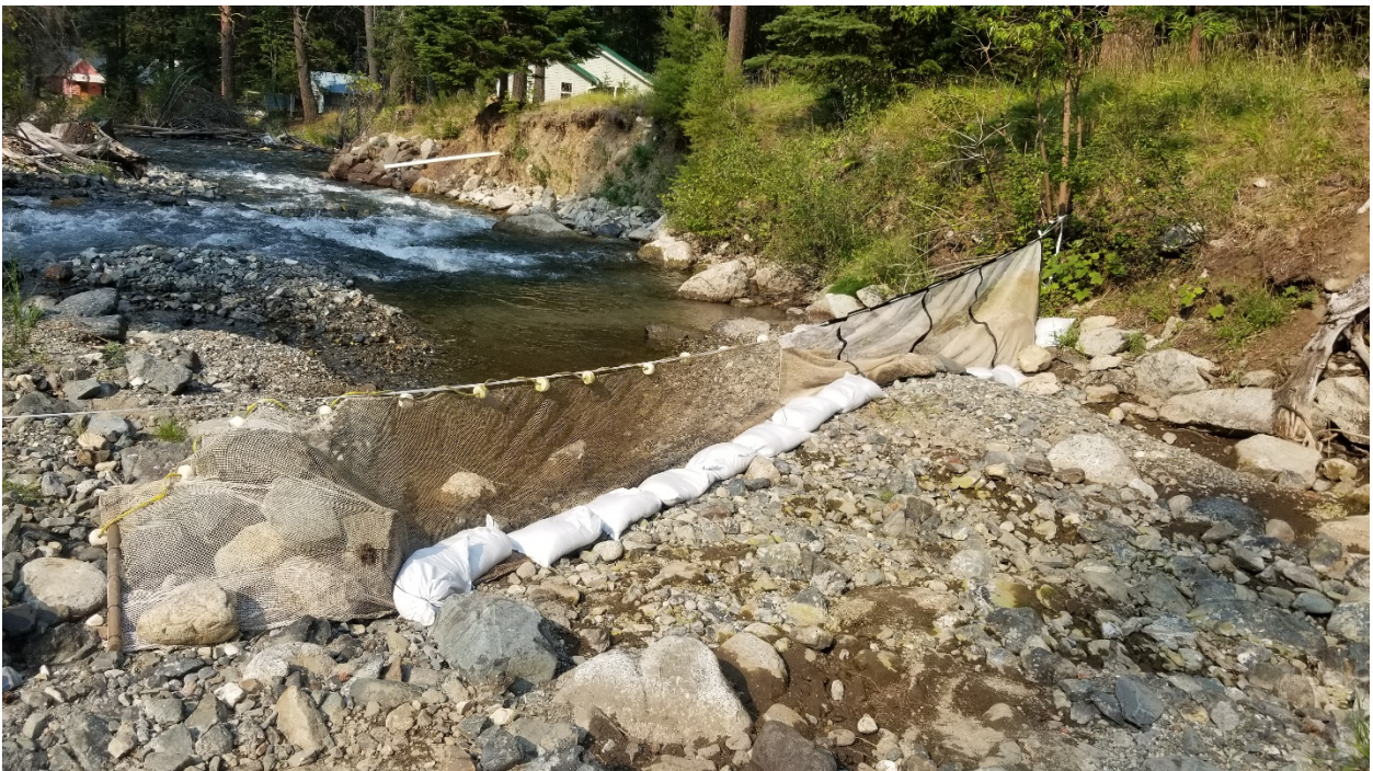
Figure 4. Photo of Wallowa Falls side-channel barrier at the downstream end.