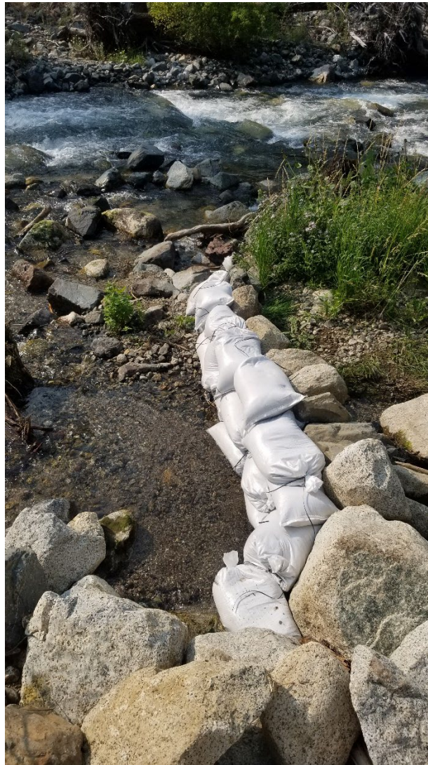
Figure 2. Photo of Wallowa Falls side-channel barrier on upstream end.

barrier at the upstream end utilized sandbags, stacked one on top the other for the entire width of the side-channel (Figure 2). This sandbag berm diverted all water from the tailrace channel into the West Fork Wallowa River, effectively dewatering the side-channel for the entirety of the survey period. A large deposit of gravel from erosion upstream was deposited at the downstream end of the side-channel where it again connects with the West Fork Wallowa (Figure 3), this and further incised channelization of the West Fork at this location made it unnecessary during the survey period to string a net at this location as there was no hydraulic connection after the side-channel was dewatered. Further specifics to the Emergency Action Plan concerning this side-channel can be found in Appendix A.