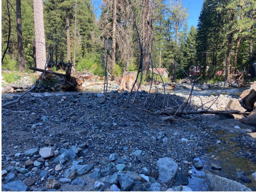
Figure 3. Bottom end of side-channel showing deposited gravel bar and no hydraulic connectivity.