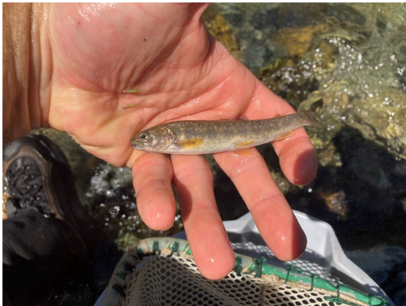
-West Fork Wallowa River side-channel bull trout juvenile 2022