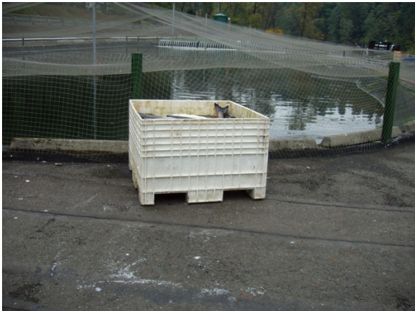
Picture 1. Tote of carcasses at hatchery.