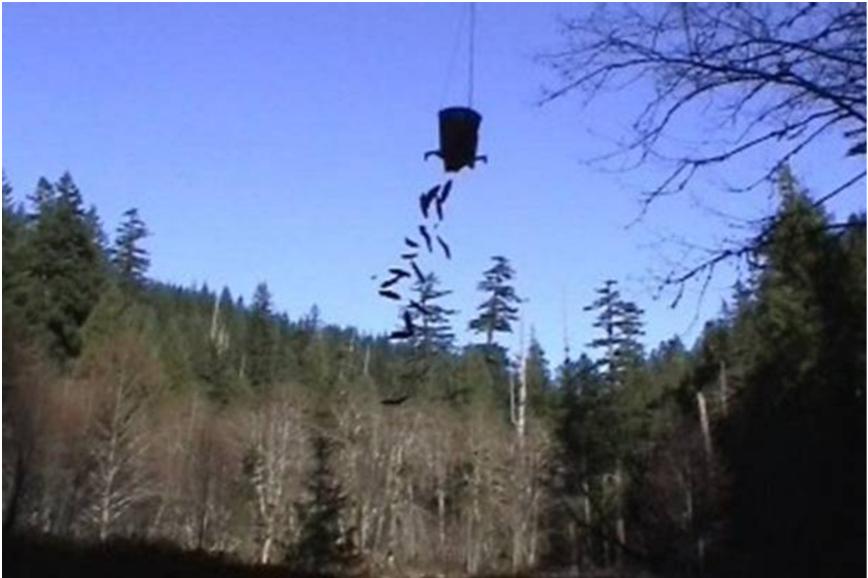
Picture 2. Helicopter Bucket Distributing Fish.