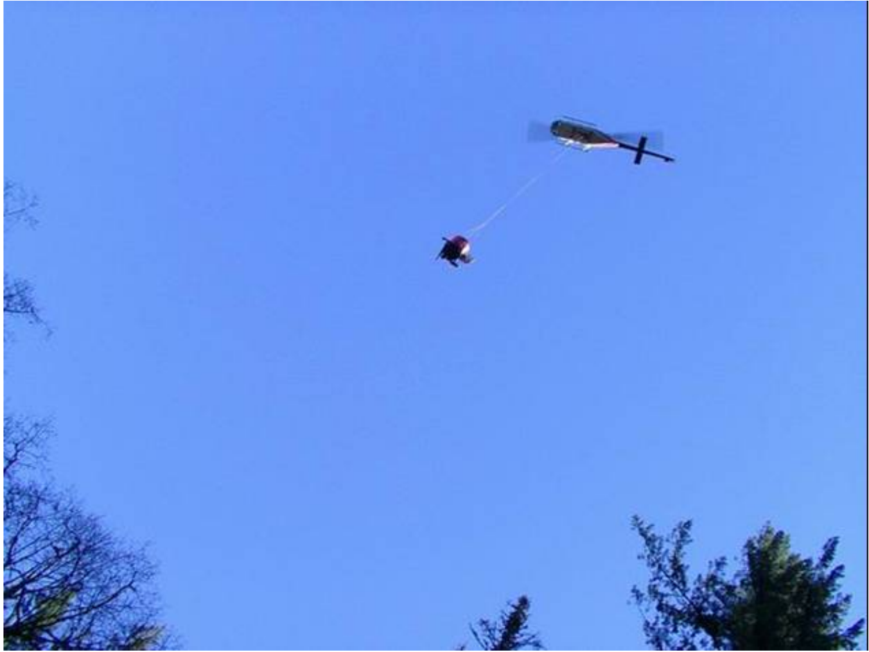
Picture 3. Helicopter with Bucket of fish.