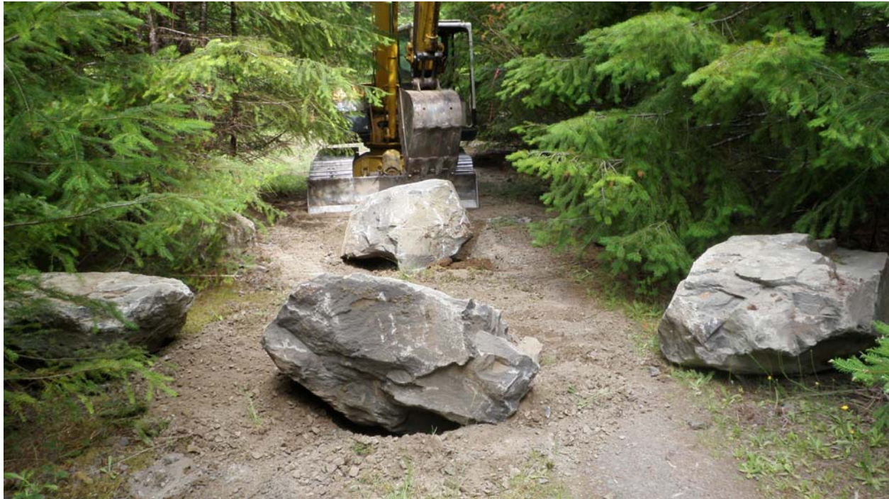
12 boulders 1 cubic yard or larger placed on 9039620 road