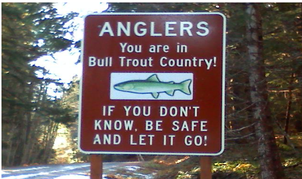
A combination of 24 signs were placed along FS road 90, 25 and other strategic locations.