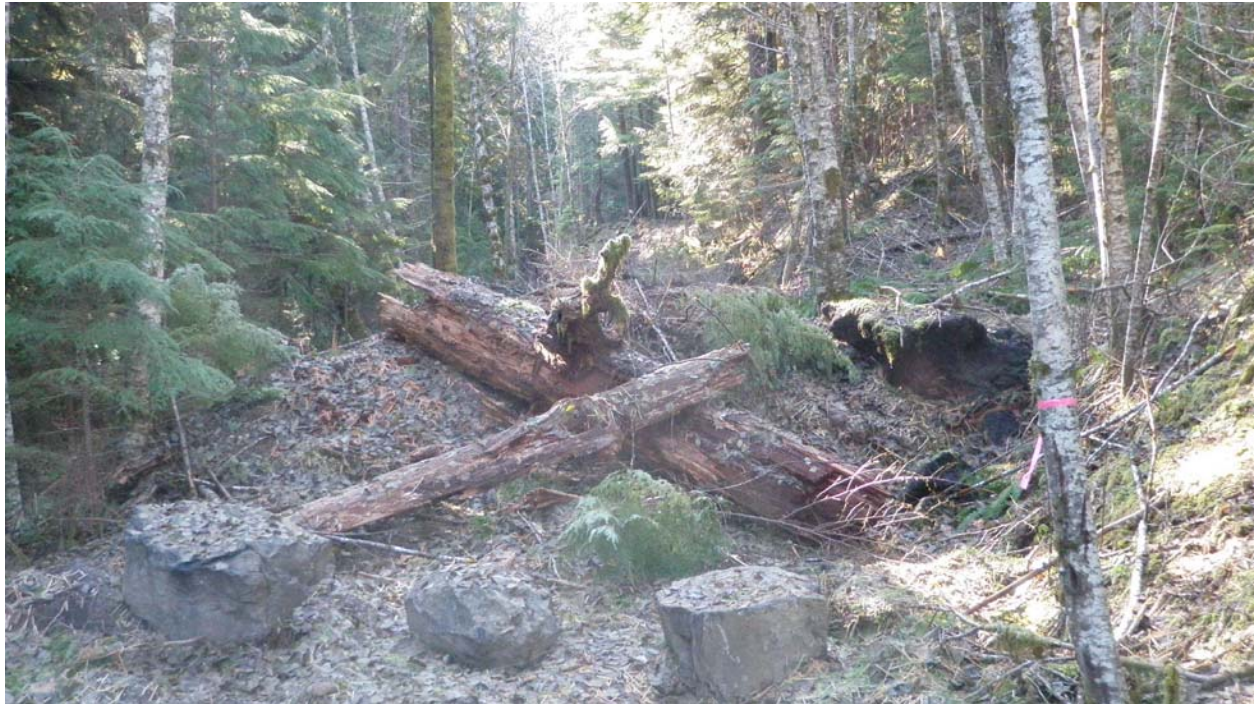
One of 12 road closure berms on the 9300g road