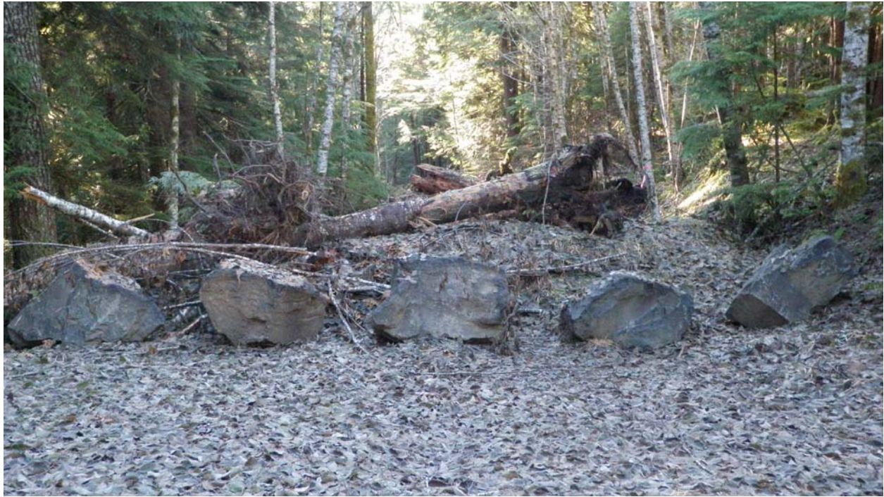
One cubic yard or larger rock and road closure berms with native material at 9300g road