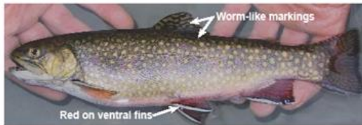
Brook trout Salvelinus fontinalis