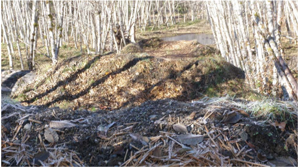
Series of three road closure berms at 93picnic road