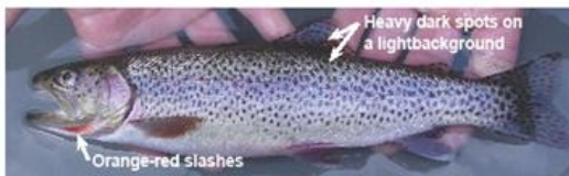
Cutthroat trout Oncorhynchus clarki

IF YOU CATCH A BULL TROUT, RELEASE IT IF YOU DON'T KNOW, LET IT GO. Killing or intentionally harming a bull trout is a violation of the federal Endangered Species Act, and can result in criminal penalties of up to $25,000 and up to six months in jail, and/or a civil penalty of up to $12,500. Contact your local state or federal agency with any information regarding the illegal harvest of bull trout. 877-WDFW-TIP (877-933-9847) Consult the current Washington Fishing Rules Pamphlet or visit WDFW's website at www.wdfw.wa.gov for up-to-date angling regulations.