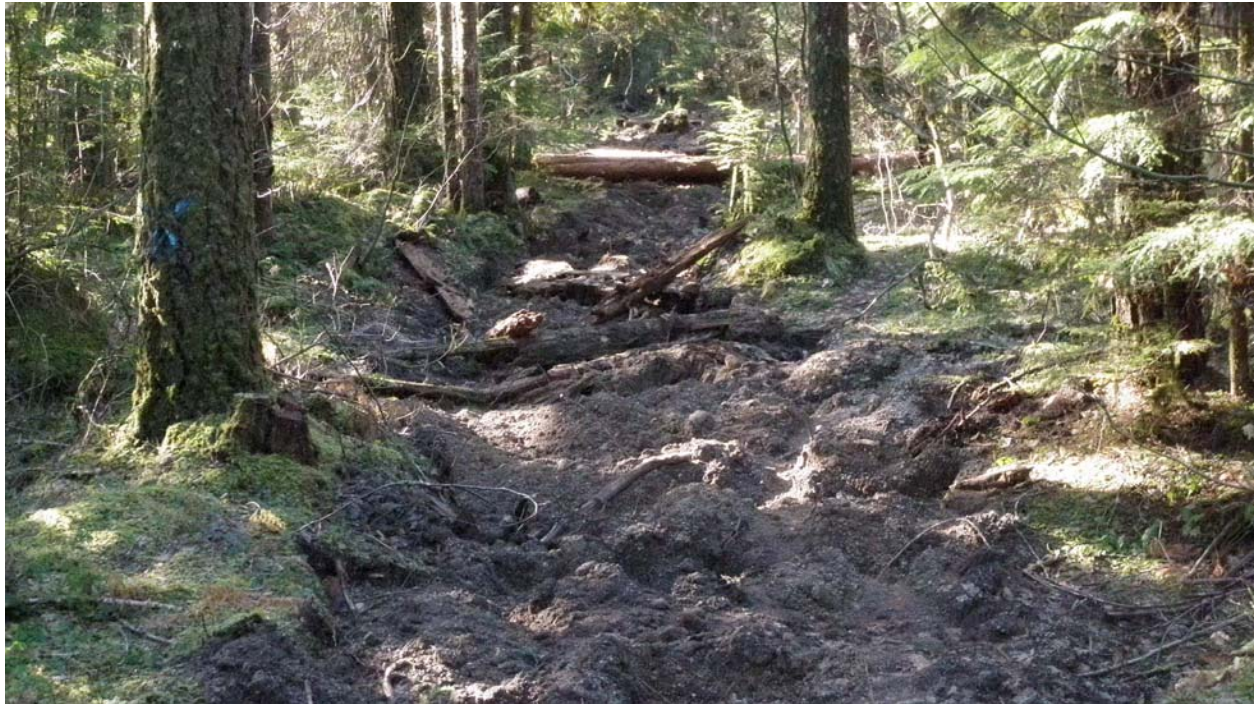
12" deep decompaction, with seed and mulch at 9300cb road