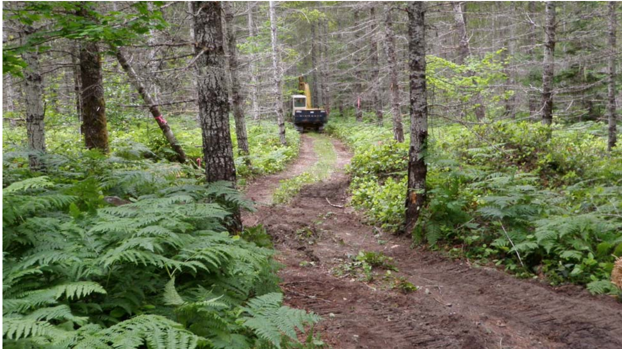
Excavator removing campsites and trash on the 9039250 road