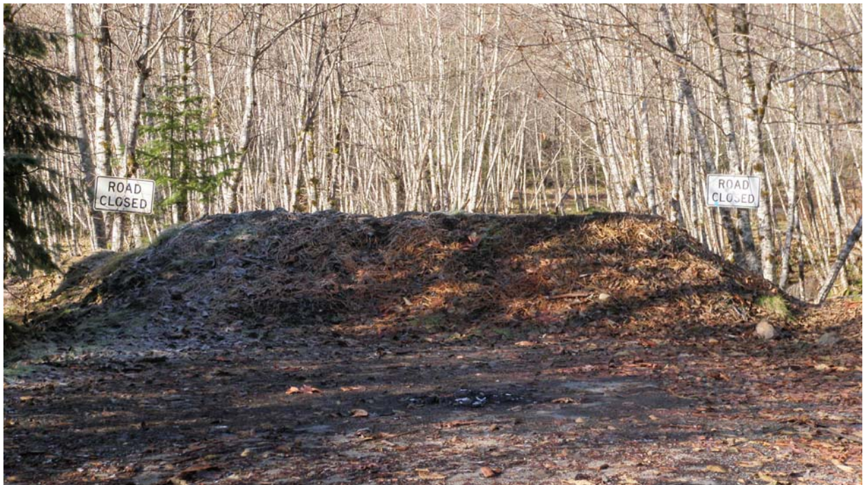
Road closure berm at 93picnic road

One problem was coordinating multiple projects over a series of years to avoid disrupting the needs of other Forest Service activities while achieving the project objectives to close roads and campsites in a cost effective manner.