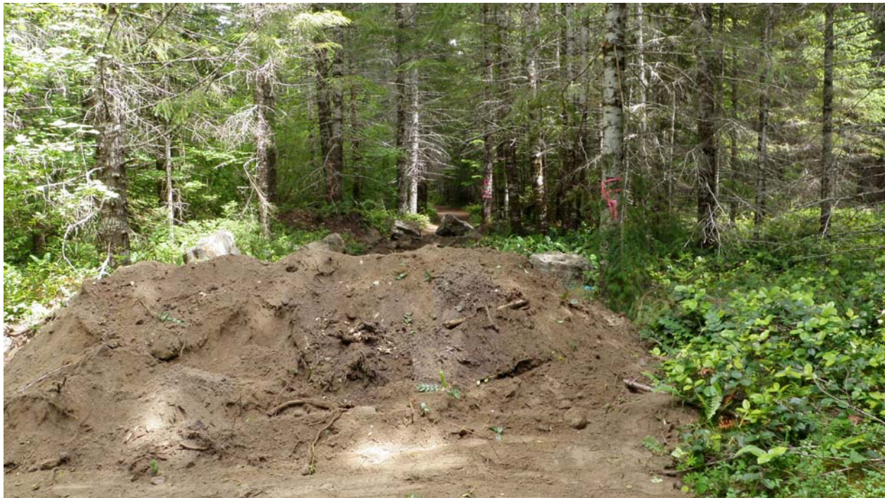
Road closure berm and boulders placed on 2500970 road