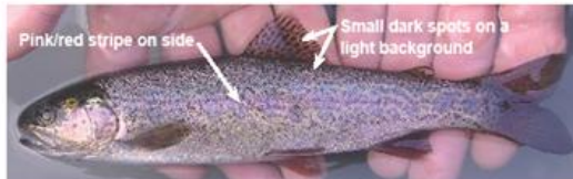
Rainbow trout Oncorhynchus mykiss