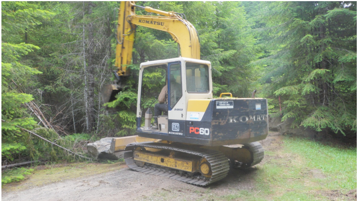
Excavator placing rock on 9039620 road