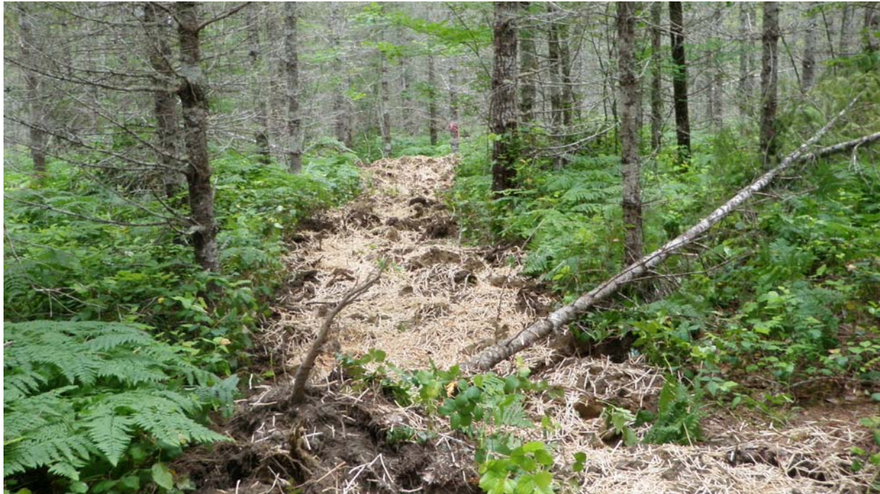
12' deep decompaction with native seed and wood straw mulch on 9039250 road