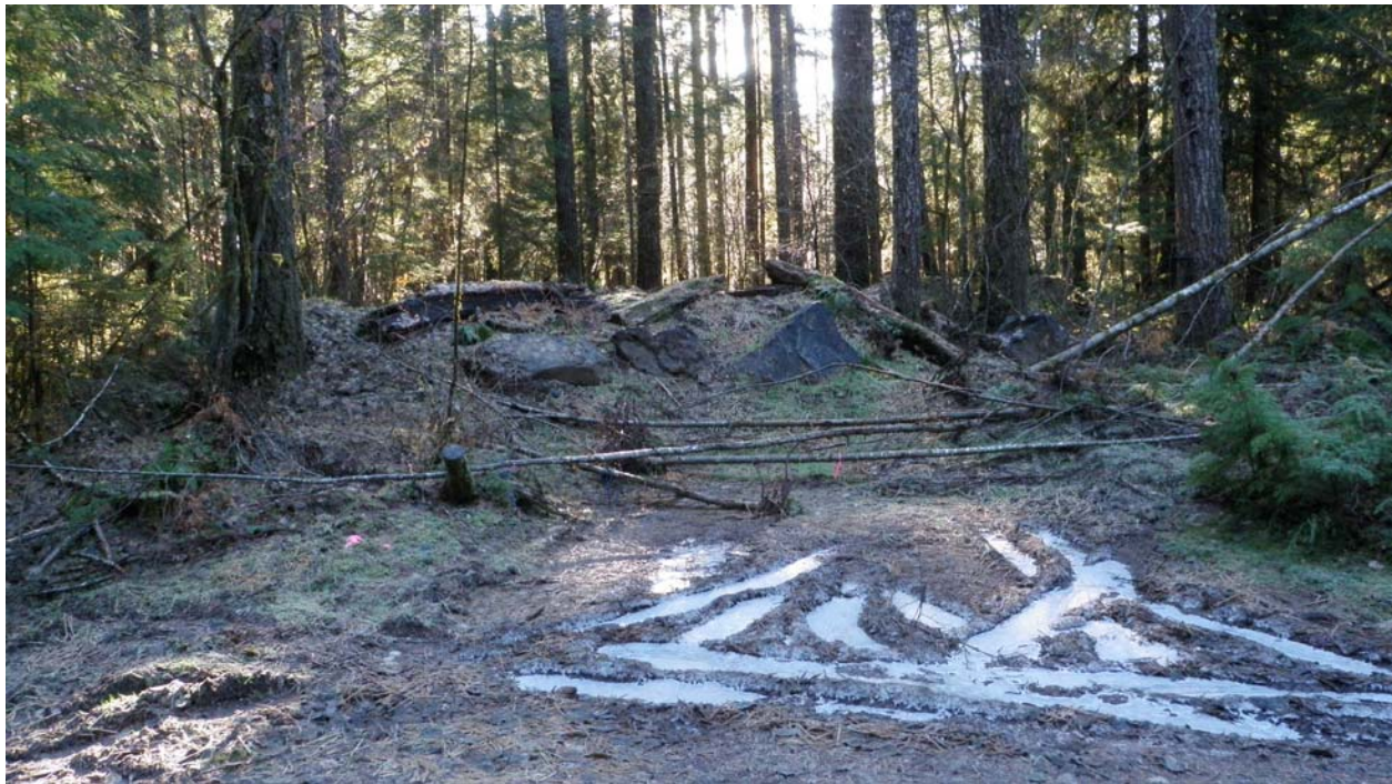
One cubic yard or larger rock and road closure berms with native material at 9300cb road