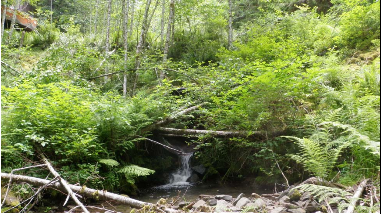
Picture 1. Large culvert prior to excavation, 9300150 road. Michaelis 7/19/2010