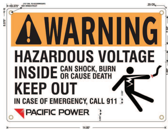
Figure 1—English High-Voltage Warning Sign for Pacific Power (SI# 7999851)

PacifiCorp Substation Engineering Handbook Document 6B.5, Fence Application and Construction.