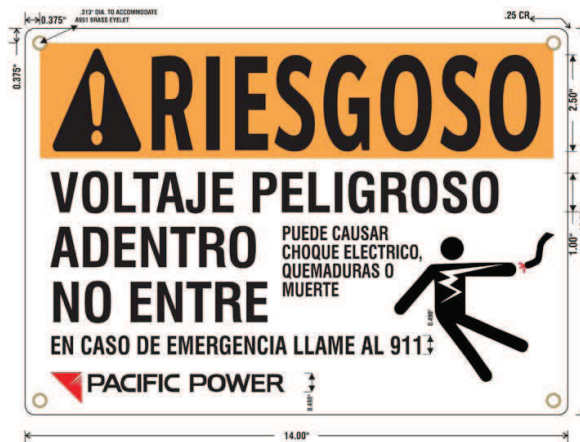
Figure 3—Spanish High-Voltage Warning Sign for Pacific Power (SI# 7999853)